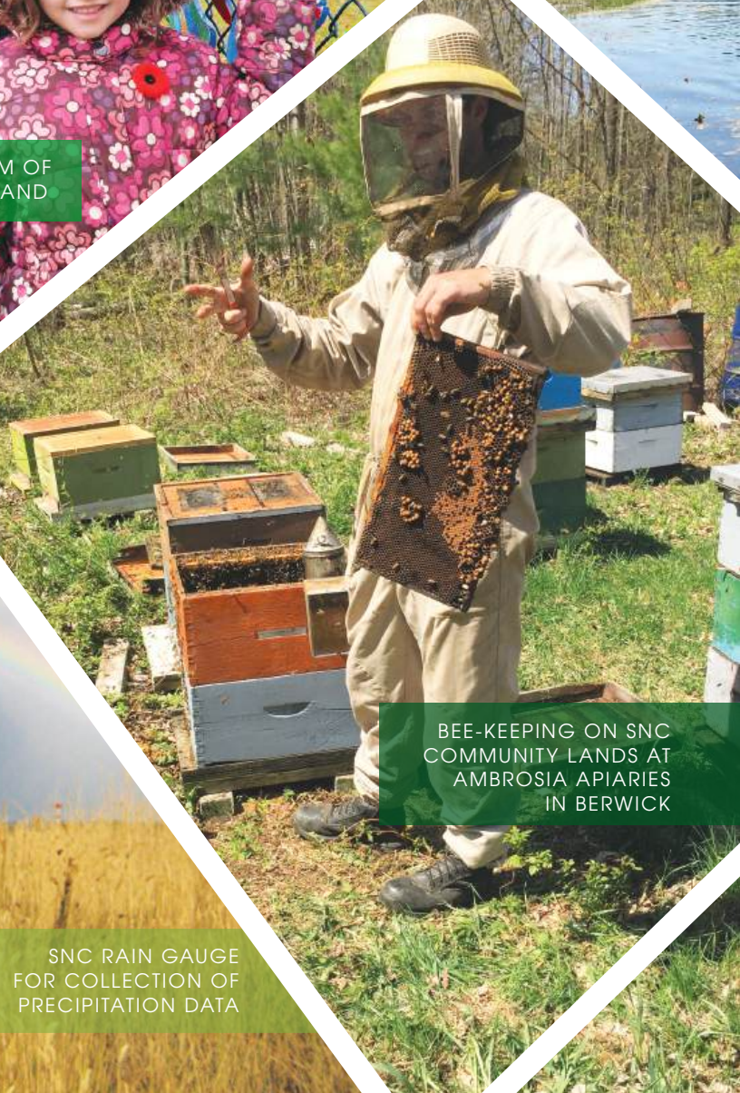
BEE-KEEPING ON SNC COMMUNITY LANDS AT AMBROSIA APIARIES IN BERWICK