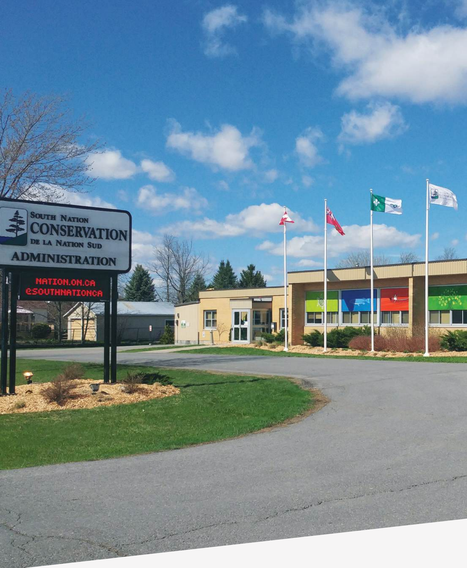
SOUTH NATION CONSERVATION ADMINISTRATION BUILDING, FINCH