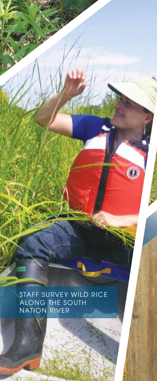
STAFF SURVEY WILD RICE ALONG THE SOUTH NATION RIVER