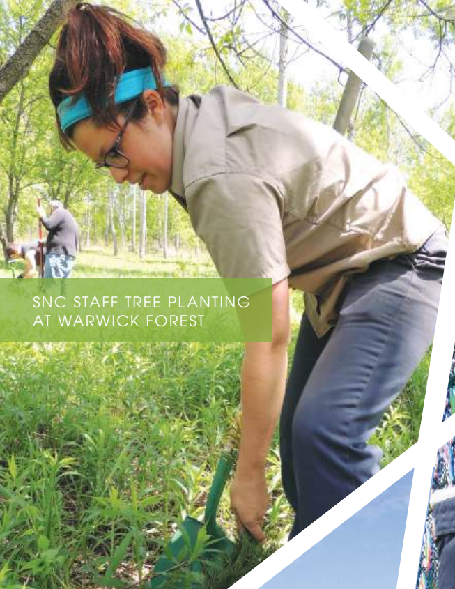
SNC STAFF TREE PLANTING AT WARWICK FOREST