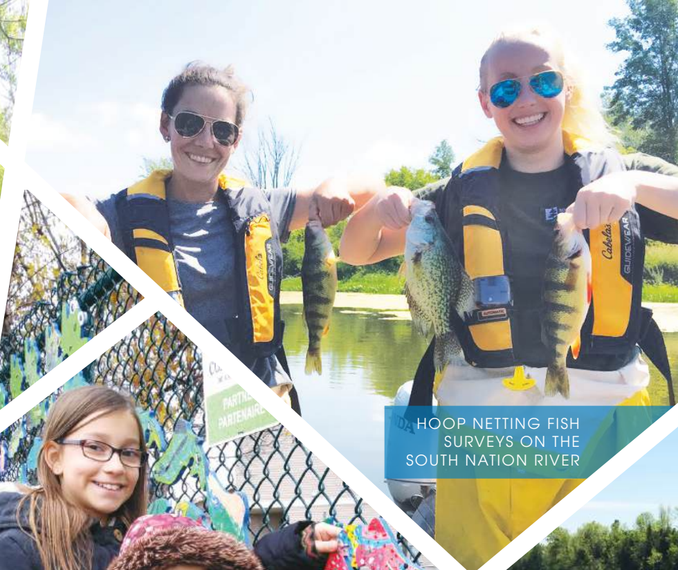
HOOP NETTING FISH SURVEYS ON THE SOUTH NATION RIVER