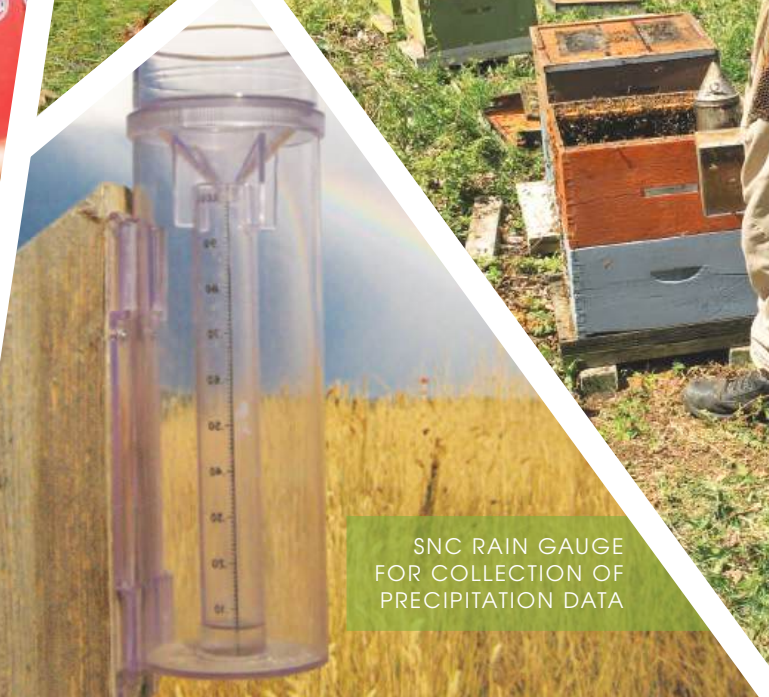
SNC RAIN GAUGE FOR COLLECTION OF PRECIPITATION DATA