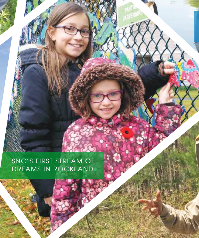
SNC'S FIRST STREAM OF DREAMS IN ROCKLAND