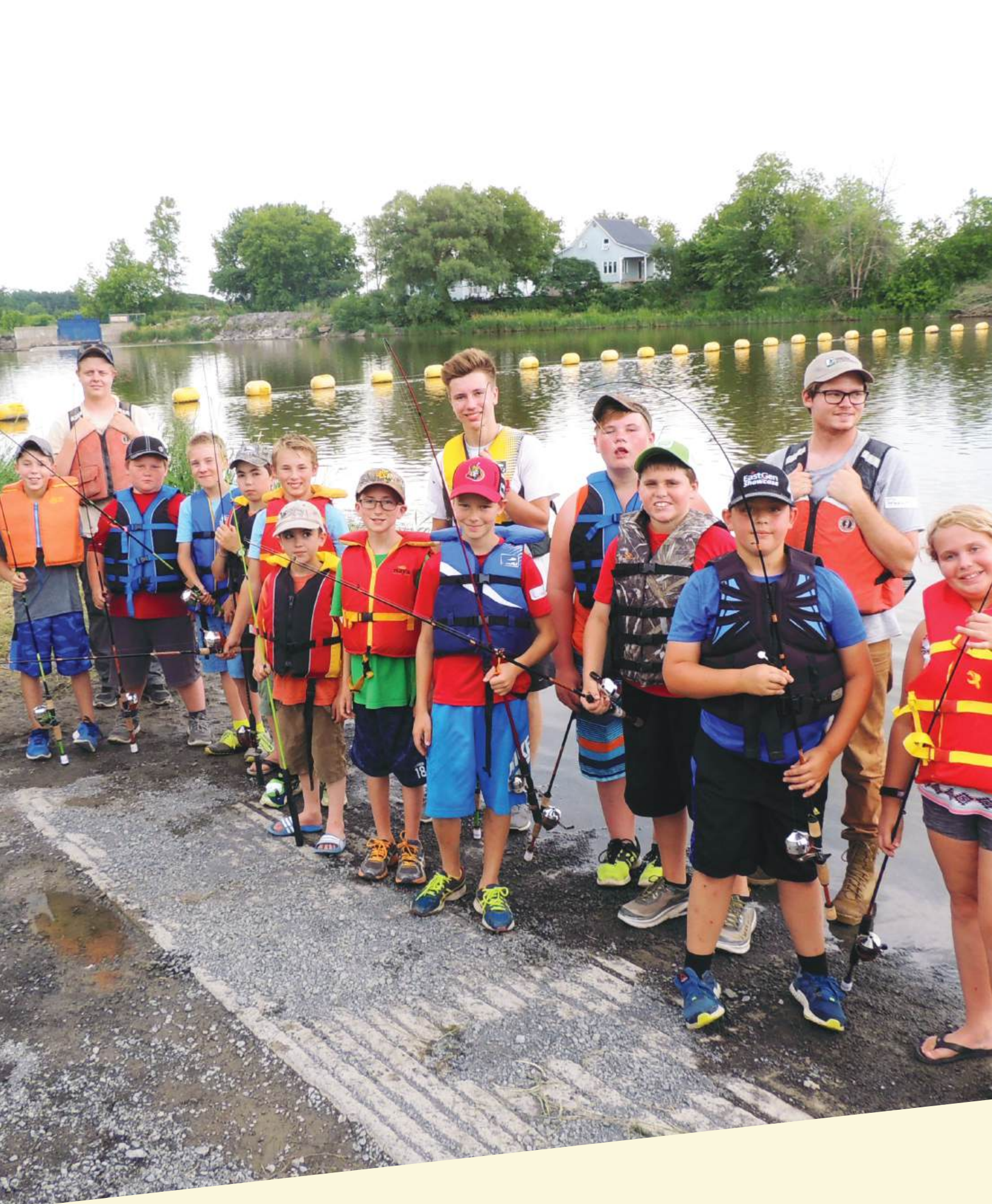
SNC HOSTS DOZENS OF LOCAL YOUTH ANNUALLY AT ITS FISH CAMPS