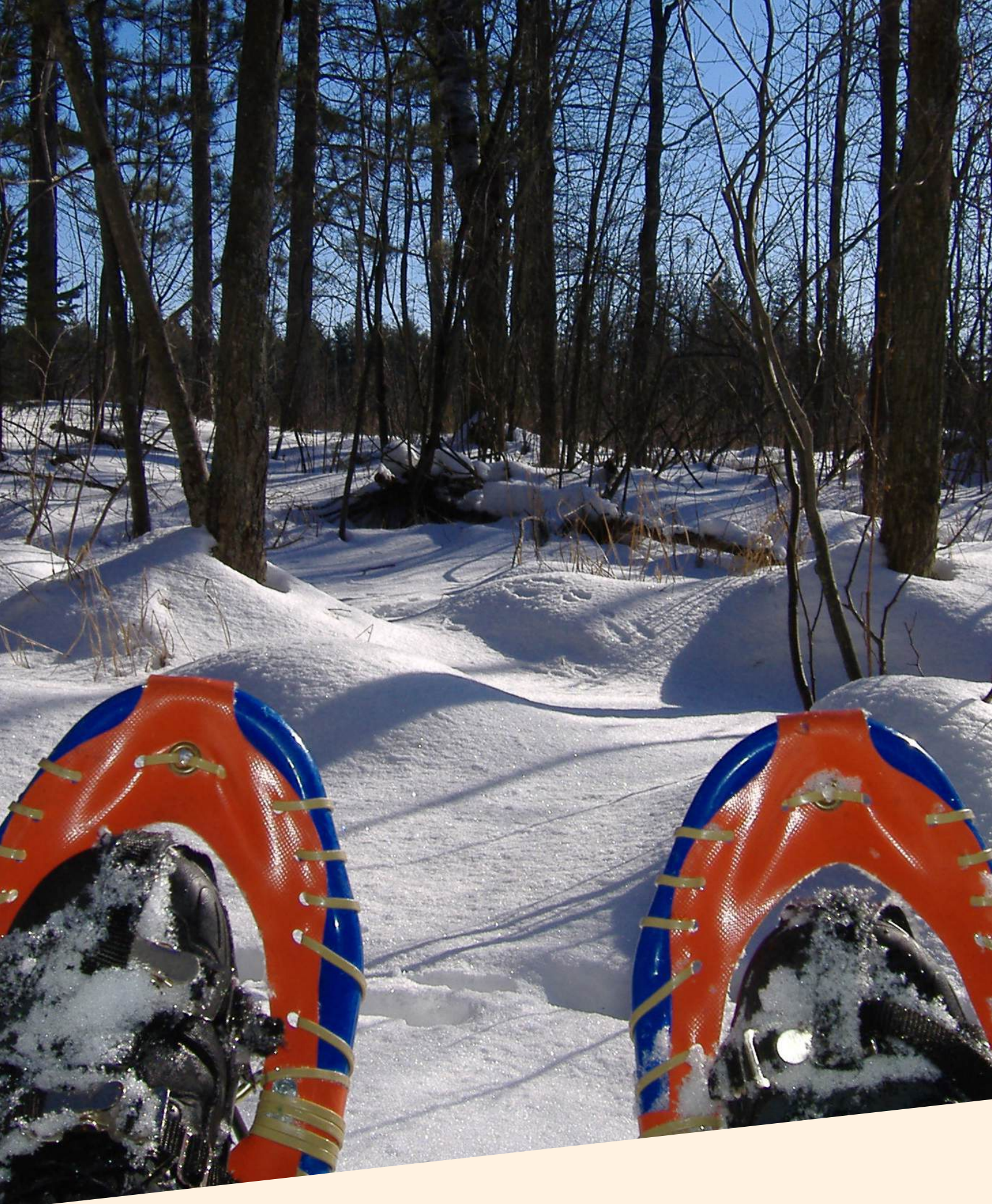
SNOWSHOEING IS A POPULAR PASTIME AT MANY OF SNC'S CONSERVATION AREAS