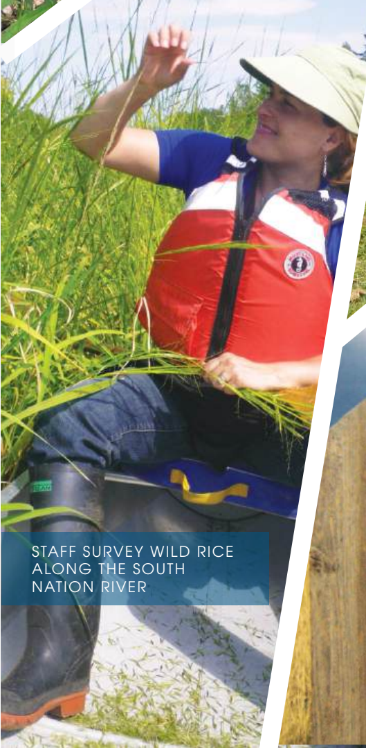
STAFF SURVEY WILD RICE ALONG THE SOUTH NATION RIVER