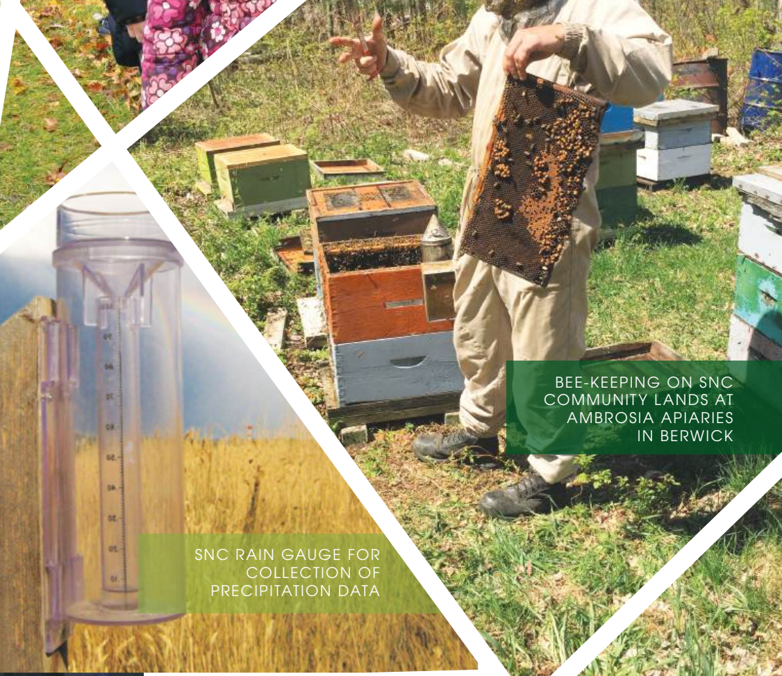
BEE-KEEPING ON SNC COMMUNITY LANDS AT AMBROSIA APIARIES IN BERWICK