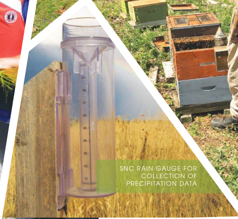
SNC RAIN GAUGE FOR COLLECTION OF PRECIPITATION DATA