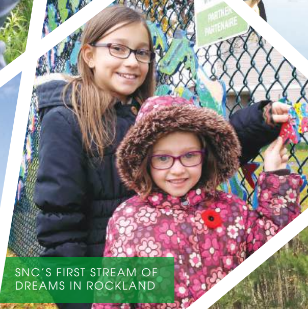
SNC'S FIRST STREAM OF DREAMS IN ROCKLAND