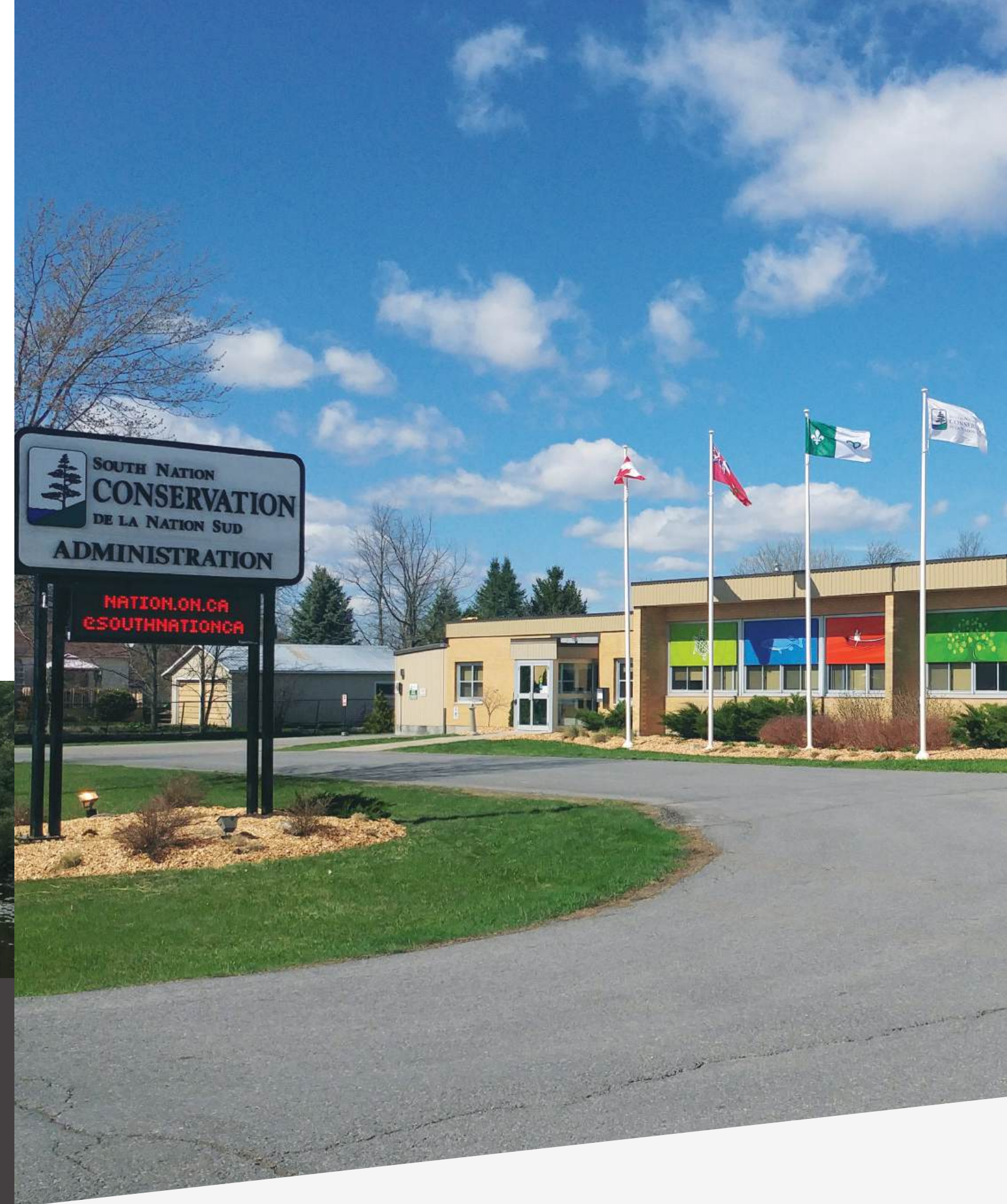
SOUTH NATION CONSERVATION ADMINISTRATION BUILDING, FINCH