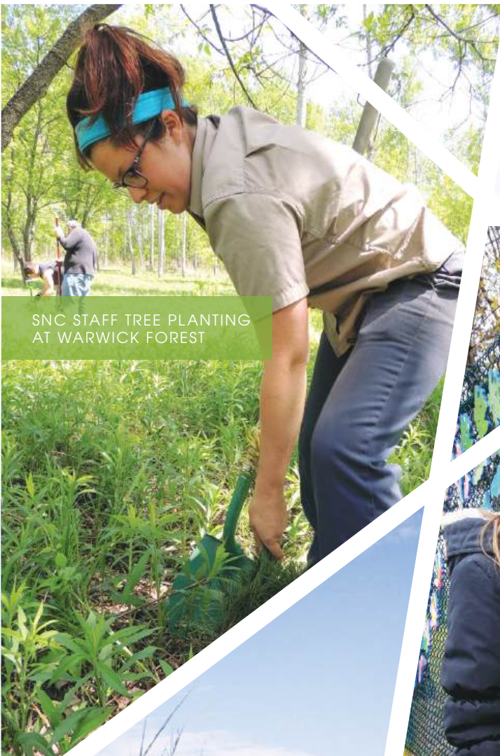
SNC STAFF TREE PLANTING AT WARWICK FOREST