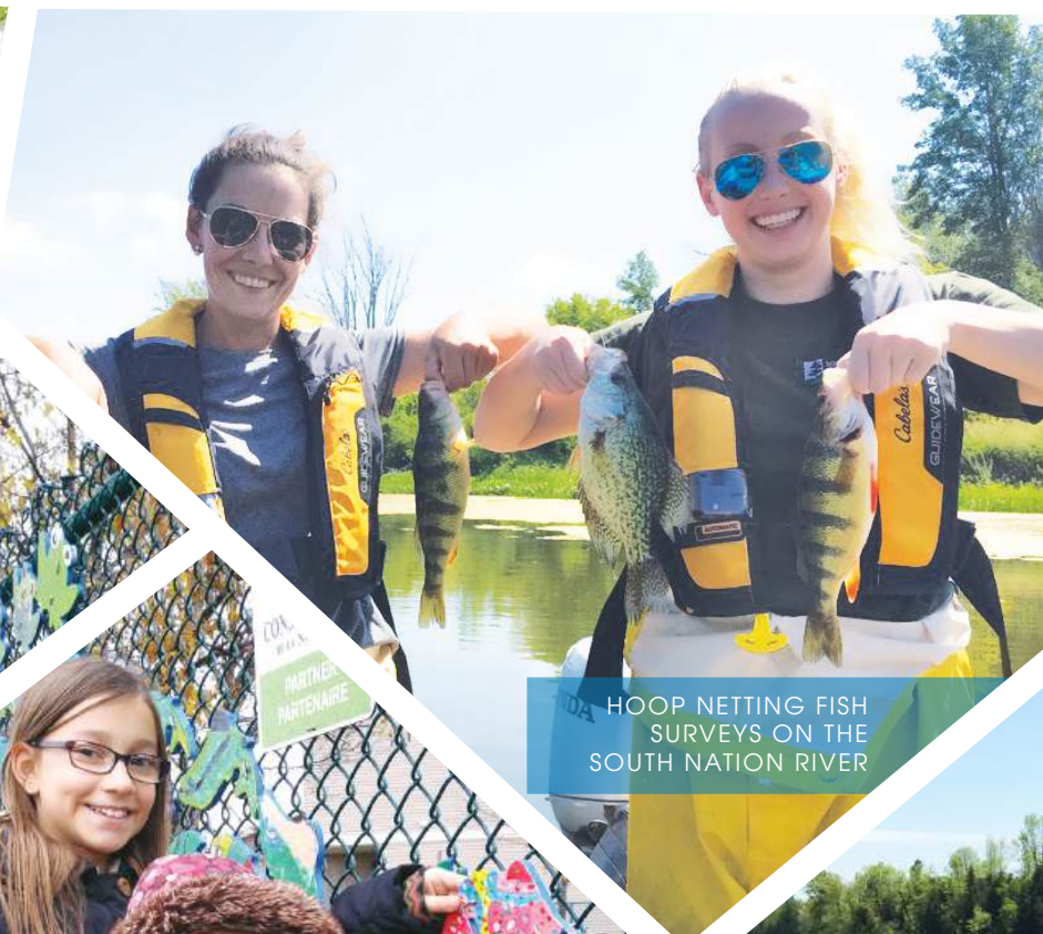
HOOP NETTING FISH SURVEYS ON THE SOUTH NATION RIVER