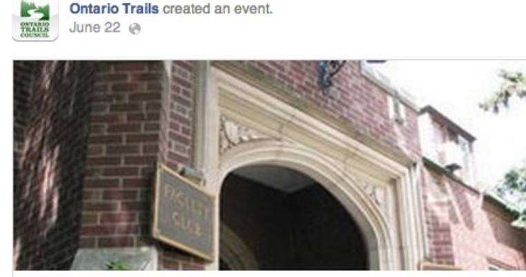
Ontario Trails Council AGM Wednesday, September 24 at 1:00pm McMaster University in Hamilton, Ontario 3 people are going