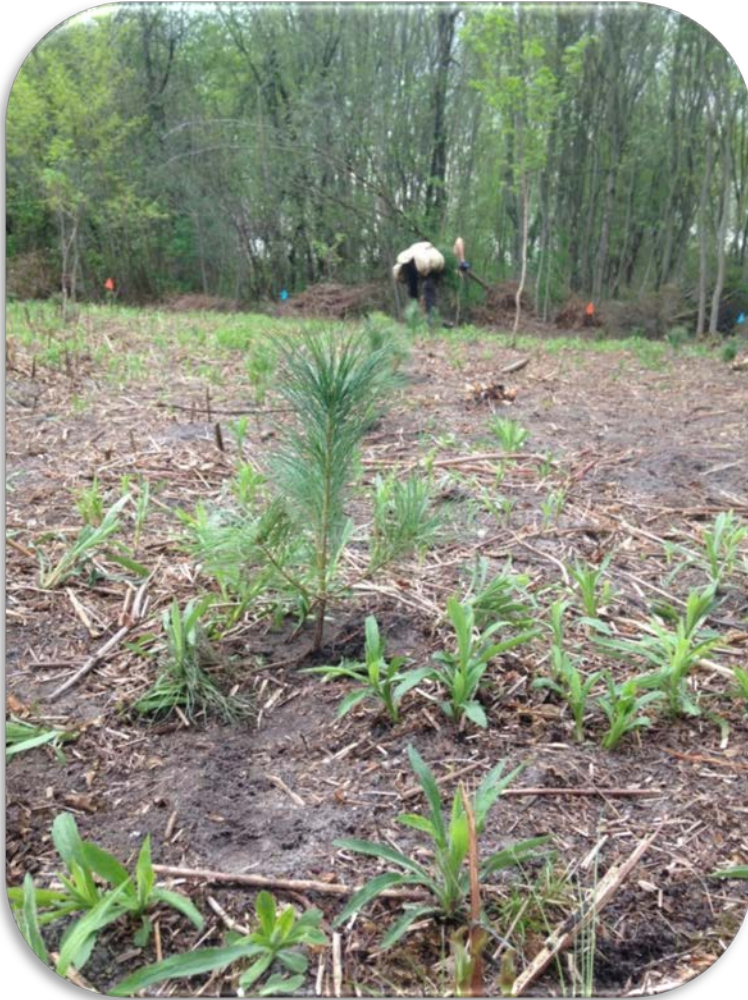
3 yr. old White Pine North Grenville