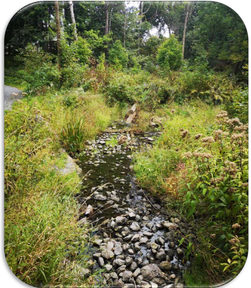
Erosion Control, J. Henry Tweed September 2021