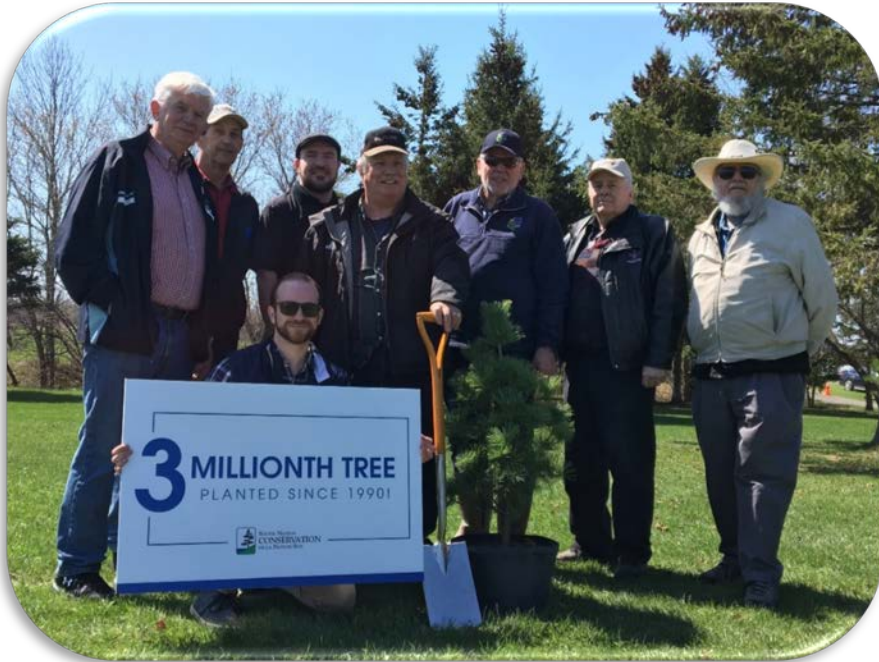
3 Millionth Tree Planted May 5, 2018 Camp Sheldrick