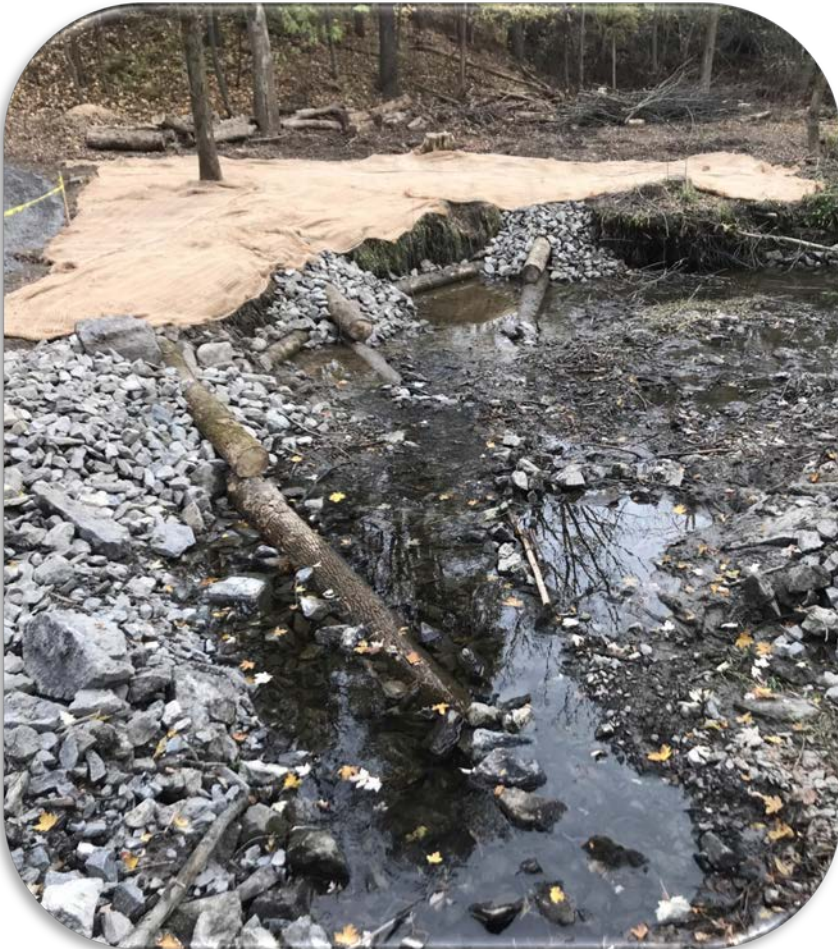
Erosion Control, J. Henry Tweed October 2019