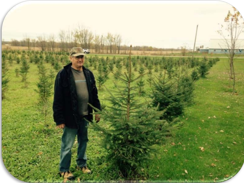
5-year-old white Spruce plantation North Stormont Township