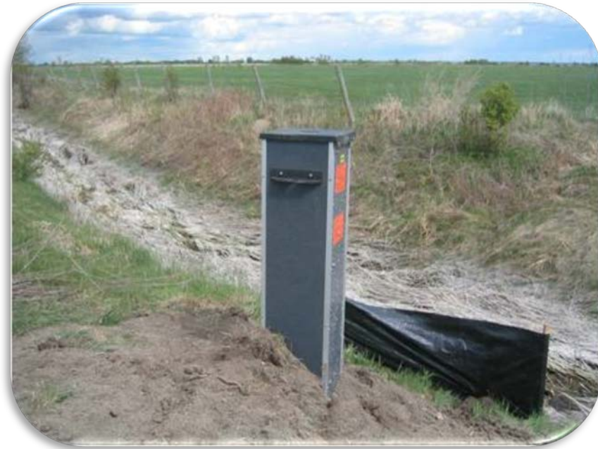
Tile drain control structure

Up to $8,000, grant rates and maximums vary by project type Annual grant budget of ~$60,000