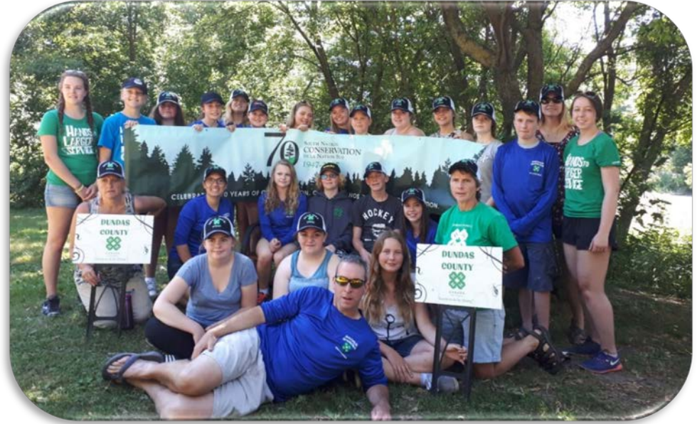
Dundas 4H Club Community Service Project Cass Bridge Conservation Area July 4, 2018