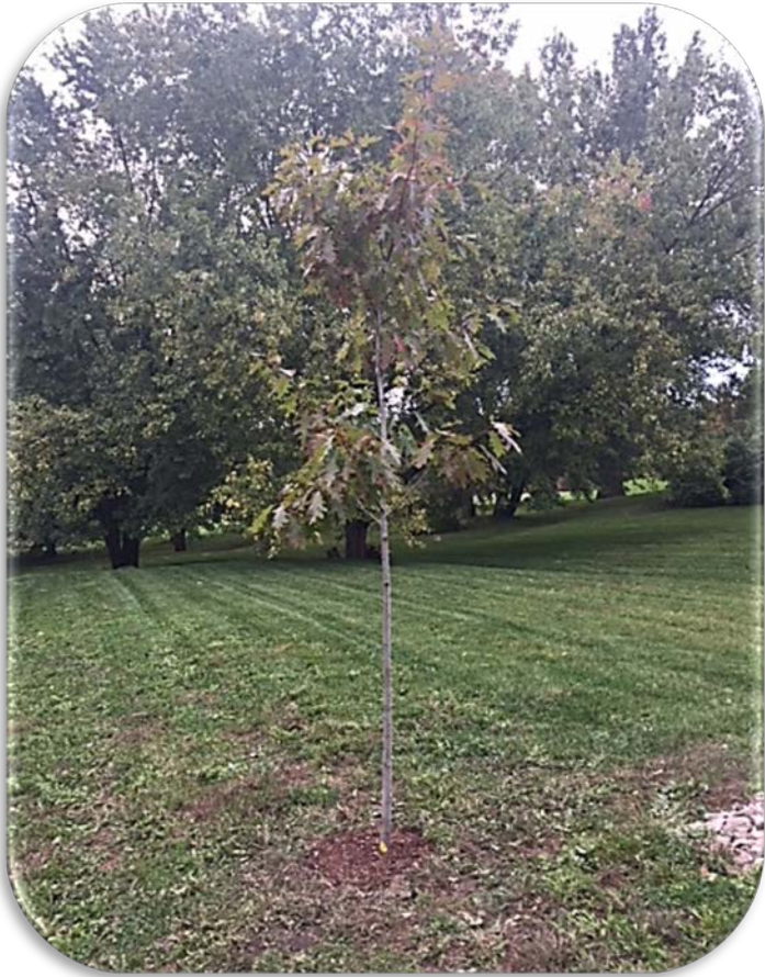
Red Oak replacement tree Carp, ON