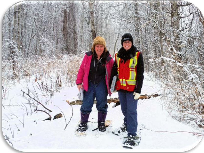
Woodlot Advisory Site Visit South Russell Road Russell Township