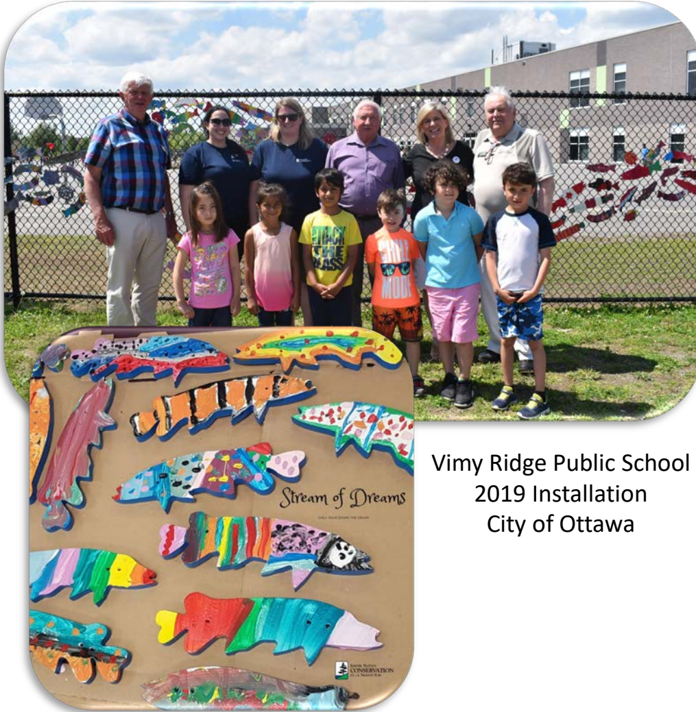
Vimy Ridge Public School 2019 Installation City of Ottawa