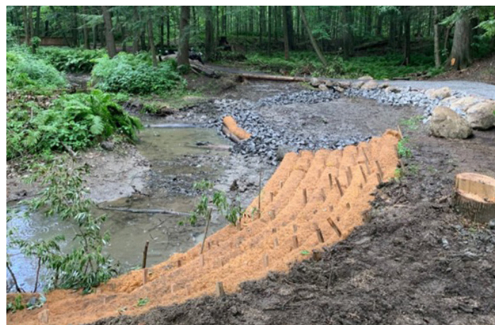
Shoreline restoration, Township of Russell