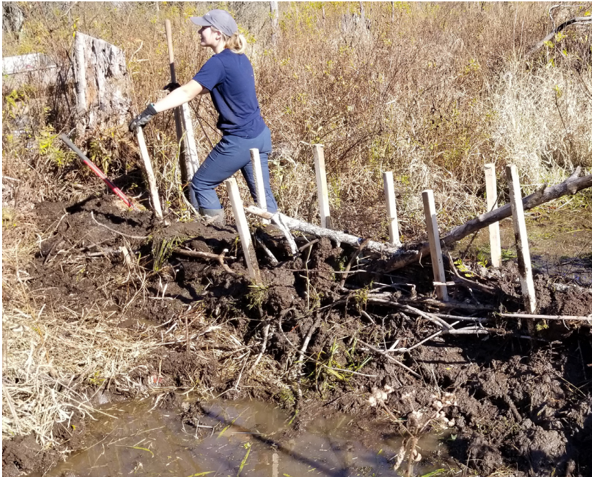
Building beaver dam analogs for wetland restoration, Township of Alfred and Plantagenet