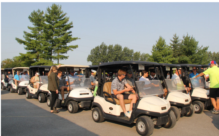
Friends of SNC Golf Tournament Before T-time