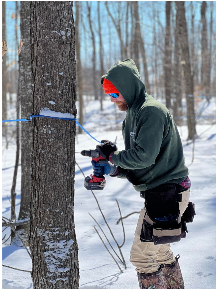
Tree tapping at the Oschmann Forest, Township of North Dundas