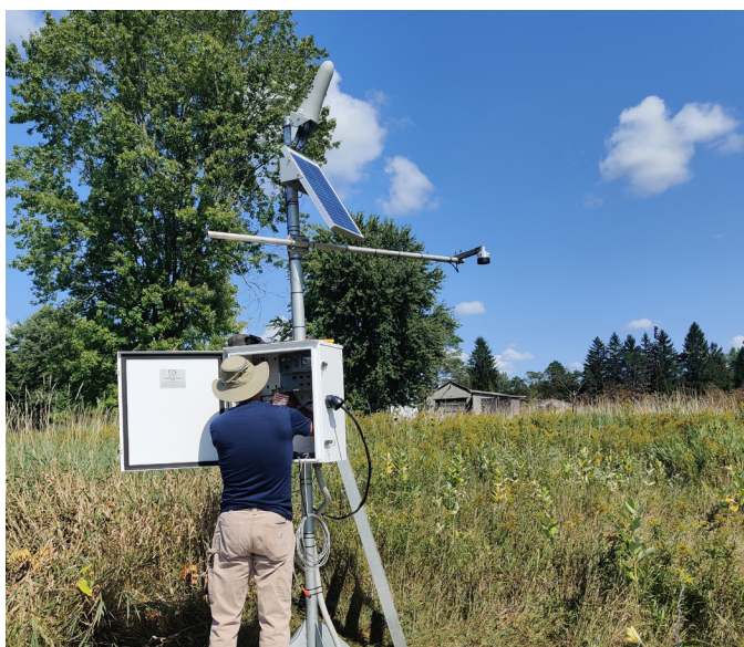
New climate station installed at Mill Run Conservation Area, Township of Augusta