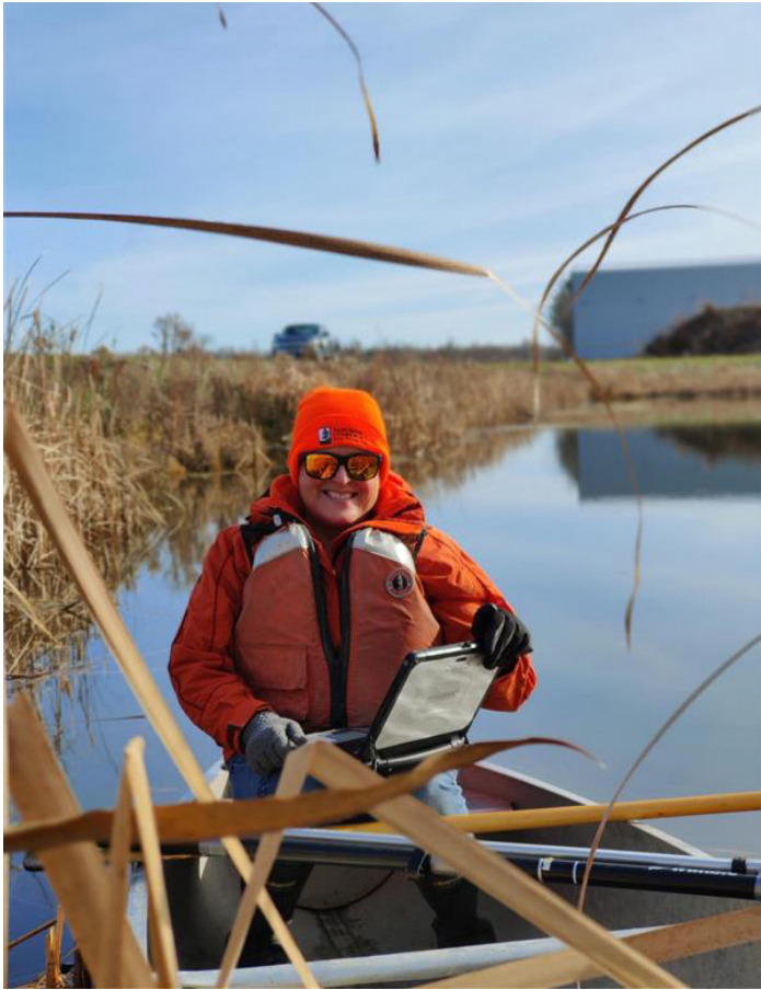
Surveying stormwater ponds in Limoges, Nation Municipality