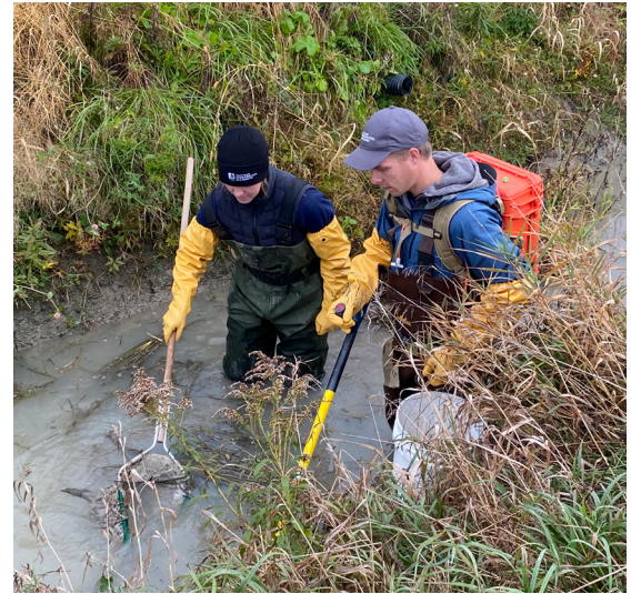
Electrofishing to Classify Municipal Drain, City of Clarence-Rockland