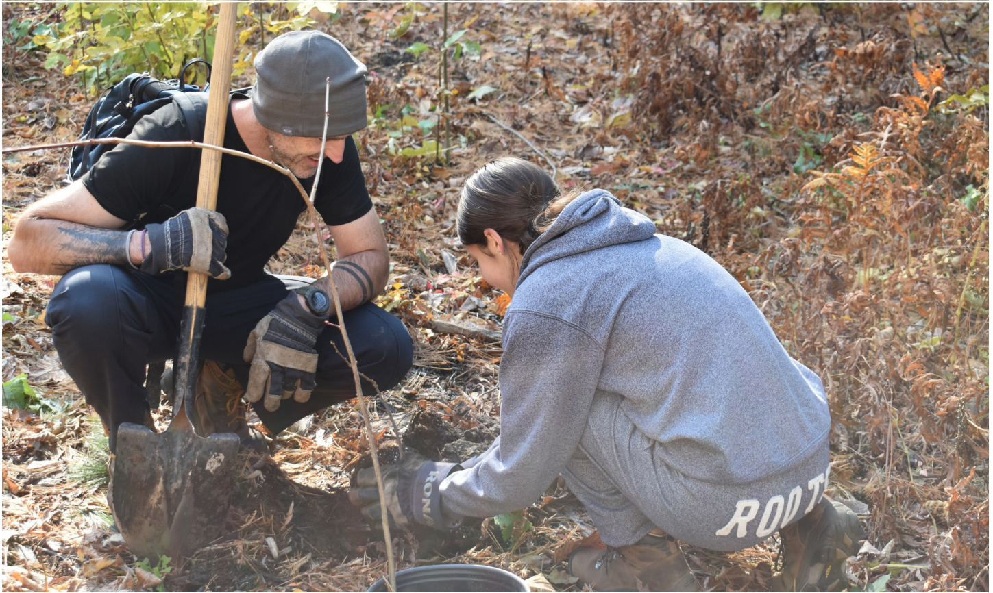
Habitat restoration tree planting, Township of Russell