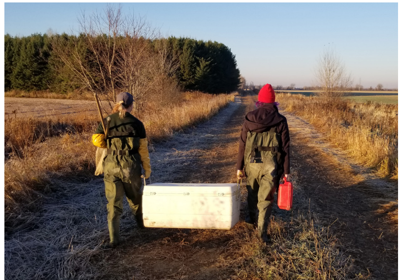
Early morning municipal drain sampling, City of Ottawa