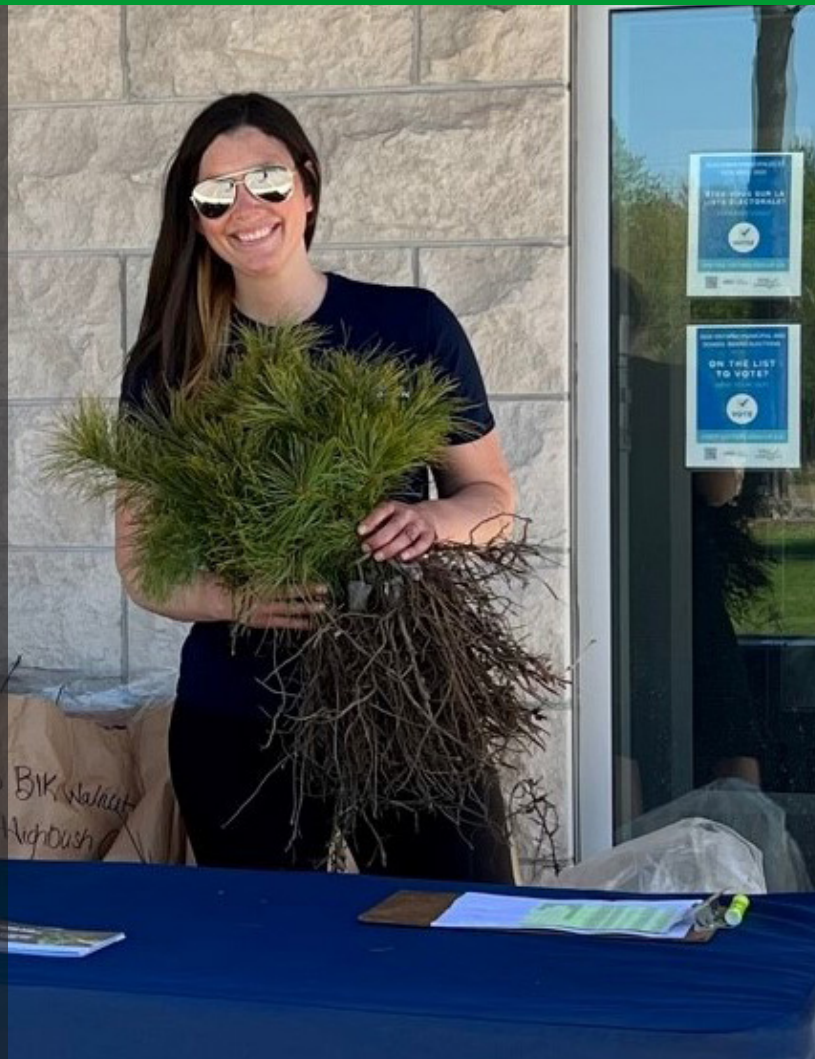
Photo: Municipal Free Tree Pickup

Over 400 free tree seedlings were distributed within each partner municipality from the recommendation in SNC's 2018 Forest Conservation Report.