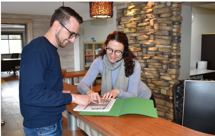
SNC Office, Township of North Stormont