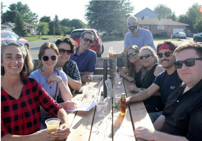
75th Anniversary Radler Launch at Humble Beginnings Brewery