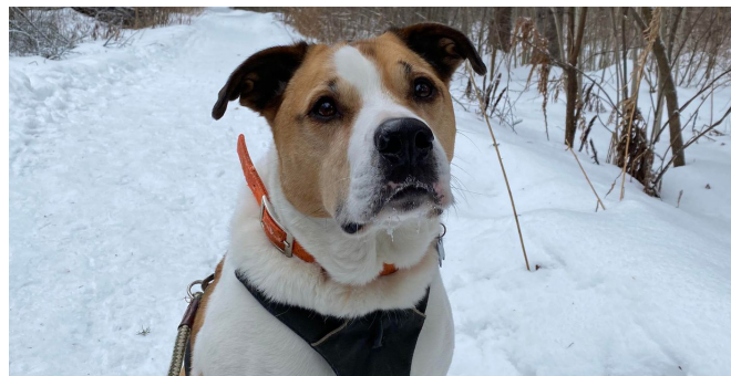
Furry friend participating in the 75km challenge