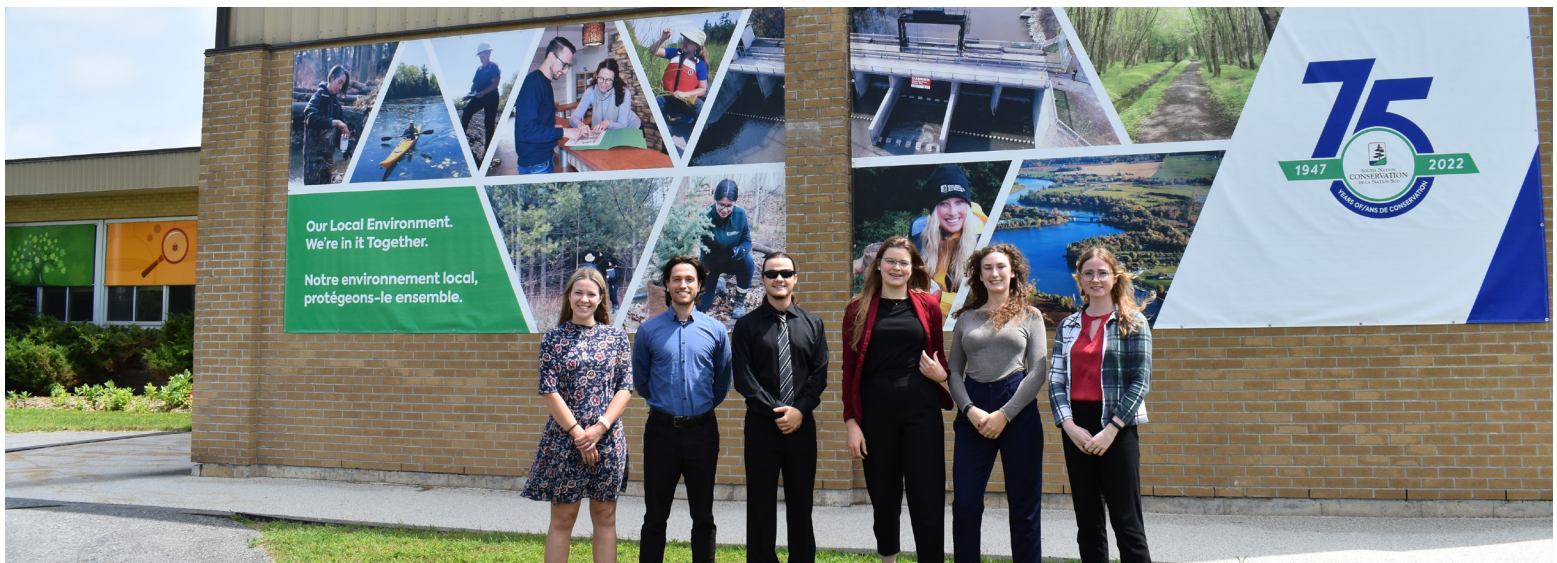
2022 Summer Students, Township of North Stormont

SNC programs and outreach initiatives helped commemorate this significant milestone by highlighting how water resource management and conservation lands stewardship have helped contribute to a Living Natural Legacy for the region.