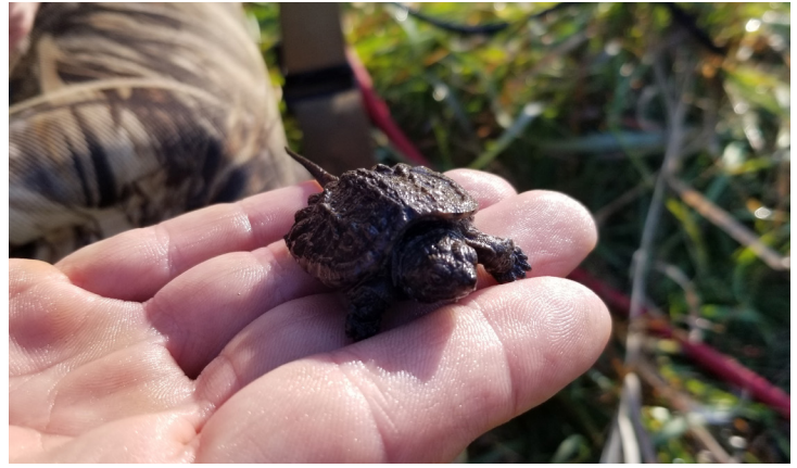
Hatchling snapping turtle in Black Creek, Township of Russell