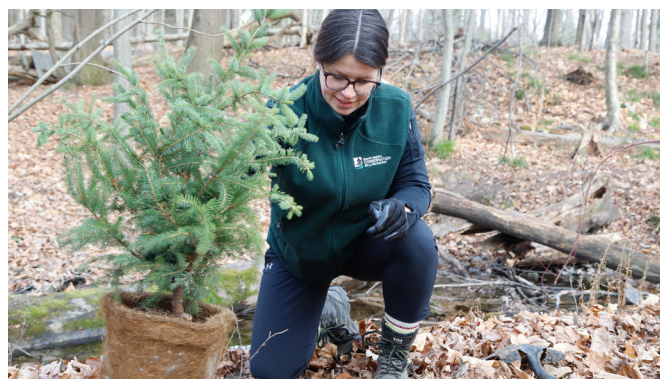
Tree planting at J. Henry Tweed Conservation Area

Politicians emphasized the valuable role that Conservation Authorities play in helping to design safe and sustainable communities by balancing the impacts of people and nature, economy and ecology, through environmental and geotechnical planning reviews completed through the Integrated Watershed Management Approach.