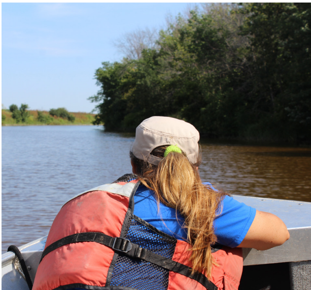
South Nation River