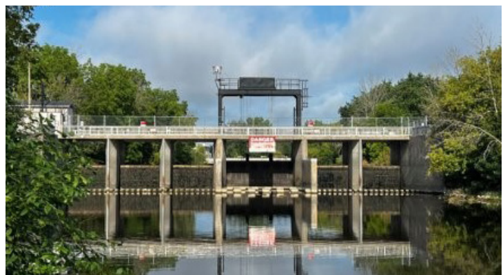
Chesterville Dam, Township of North Dundas

SNC operates several water control structures including dams, weirs and berms to reduce risk to life and property from natural hazards.