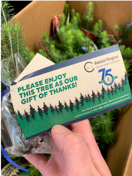
Free Tree Campaign - National Nurses Week