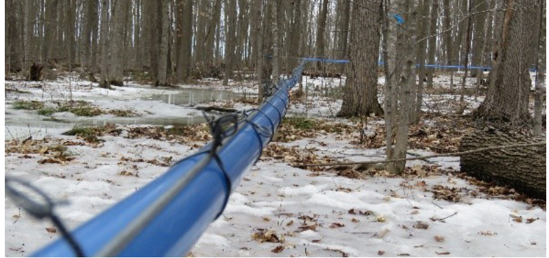
Maple taps at the Oschmann Forest, Township of North Dundas

30 acres of SNC land is leased to local farmers.