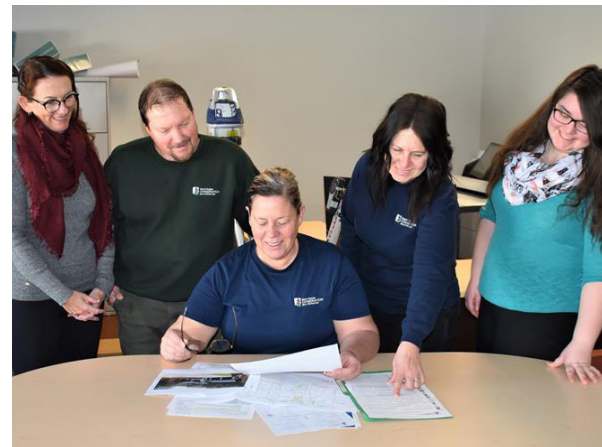
SNC's septic team works together to inspect private sewage systems under the Ontario Building Code

273 of 274 septic systems in drinking water source protection areas were inspected in 2022, following initial inspections last completed in 2017.