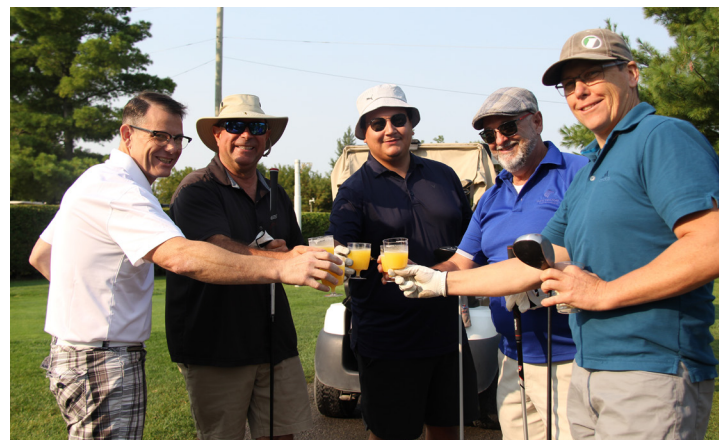
A toast to Friends of SNC, Municipality of Casselman