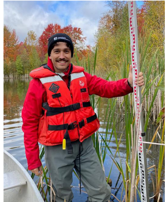
Pond survey, Nation Municipality