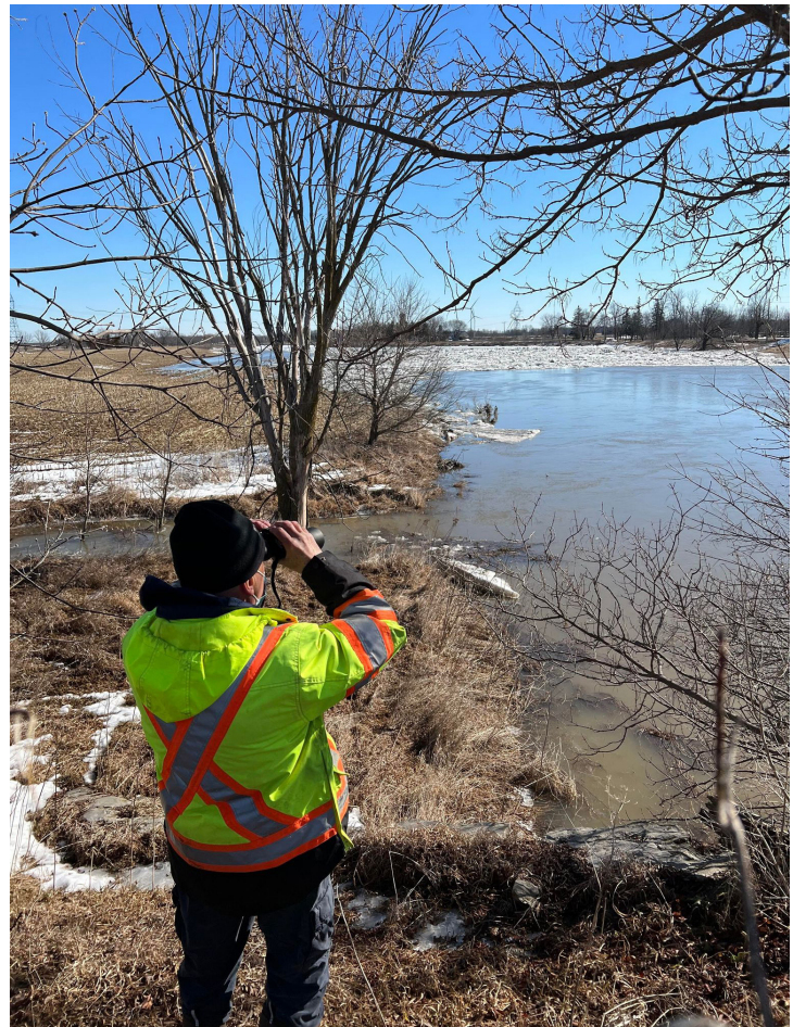
Ice Jam at South Nation River, Township of North Stormont

Under the Low Water Response Program, which advises of possible drought conditions, SNC did not issue any notices in 2022.