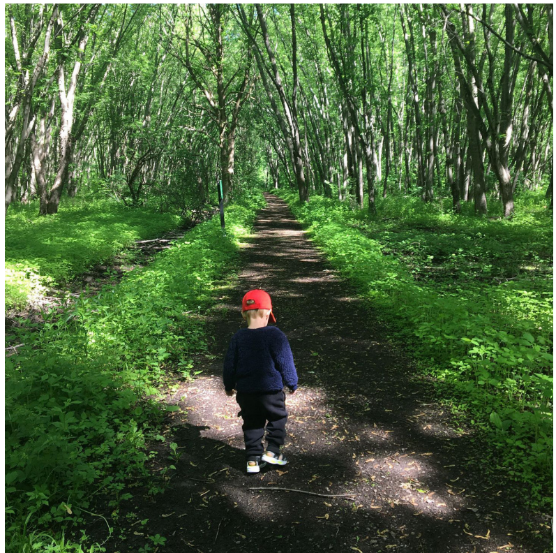
Two Creeks Forest Conservation Area, Municipality of South Dundas

In 2022, SNC acquired 225 acres of land on 5 properties through partial purchase and donation in the municipalities of: North Stormont, North Grenville, North Dundas and the City of Ottawa.