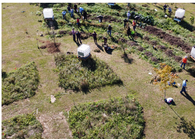
The Healing Place Harvest Event - October 2022 Township of Edwardsburgh/Cardinal

Two-eyed seeing bridges western science with Traditional Indigenous Knowledge to encourage new perspectives and to help gain a greater depth of understanding of the natural environment. SNC continues to incorporate a two-eyed seeing approach while working in partnership with First Nations to help deliver important conservation land and water stewardship projects.