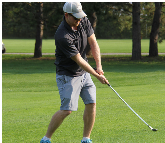
Friends of SNC Golf Tournament