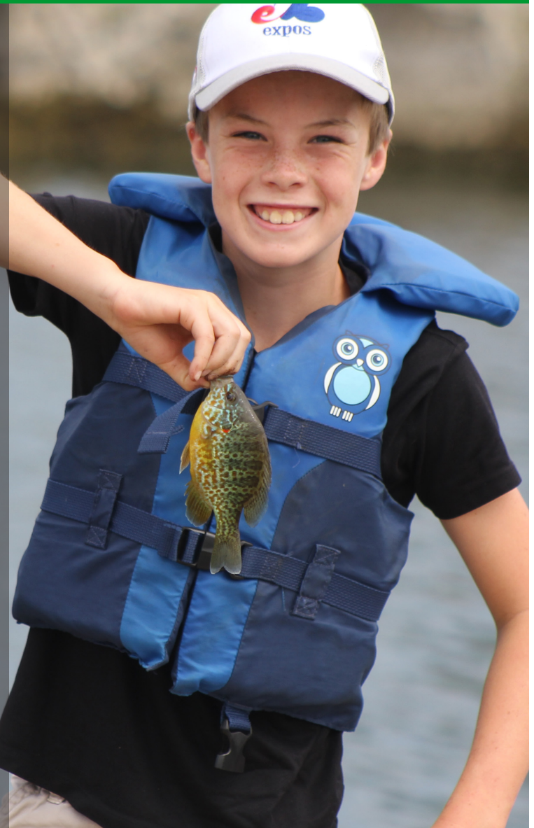
Photo: Youth Fish Camp, Cardinal Regional Park, Township of Edwardsburgh Cardinal

Everyone is hooked on these fee-for-service programs and SNC continues to encourage safe and responsible hunting and fishing opportunities.