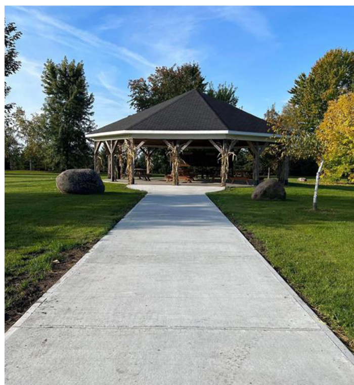
New memorial walkway at the McIntosh Park Conservation Area, Township of North Stormont