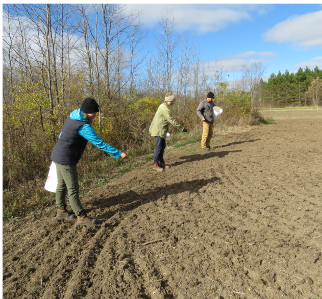
Staff sowing wildflower seeds at Mill Run Conservation Area Township of Augusta