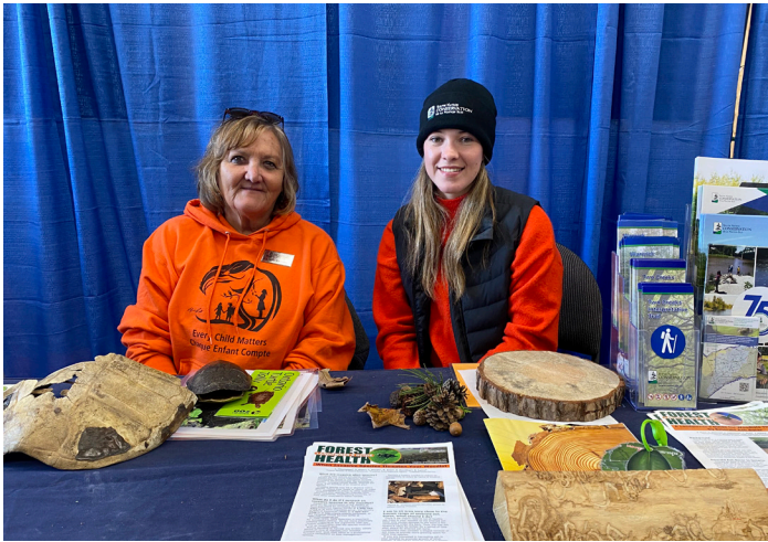
Metcalfe Fair, City of Ottawa