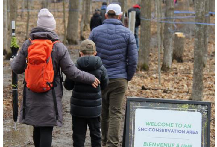
Healthy hike at Maple Weekend at the Oschmann Forest, Township of North Dundas