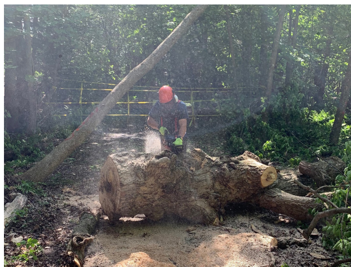
Cleaning up conservation areas following the derecho storm