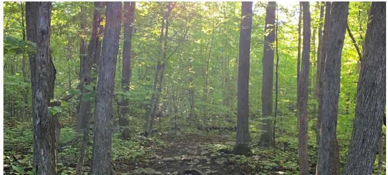
Reveler Conservation Area, Township of North Stormont