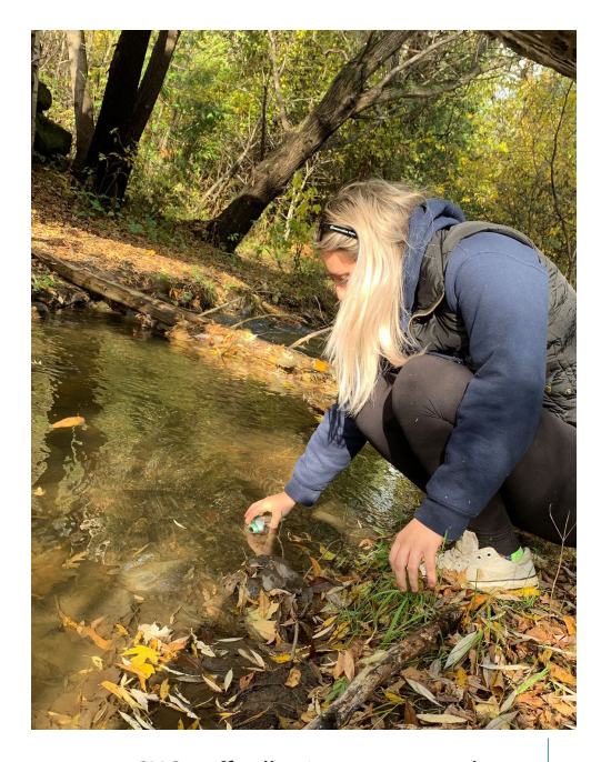
SNC staff collecting water samples at Andy Shield Park in Greely

Approved $197,593 in cost-share grants to residents for 94 projects to control the invasive emerald ash borer (EAB) while maintaining urban tree cover. SNC remains committed to controlling EAB within its forest properties by removing infected Ash trees.