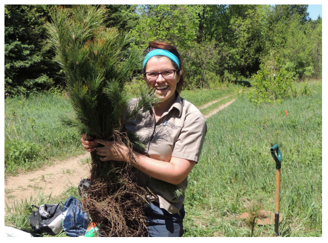
SNC staff planting trees as part of our Forest Conservation Initiative