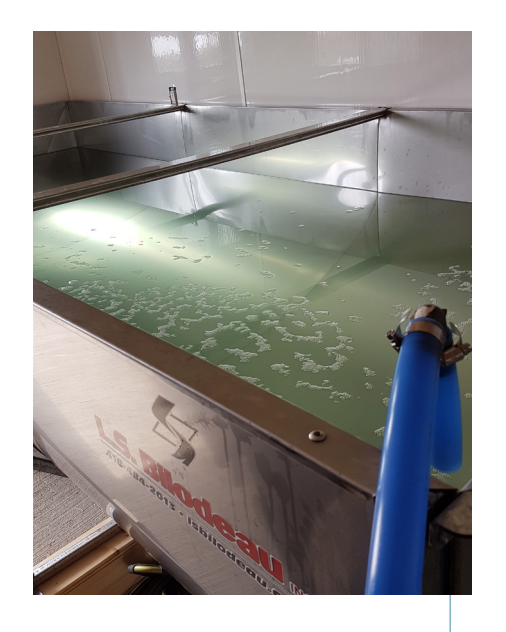
Pumphouse at Oschmann Forest Conservation Area, North Dundas

The guidance, wisdom, and holistic perspectives shared through partnerships with First Nations ensure the protection of culturally-significant species.