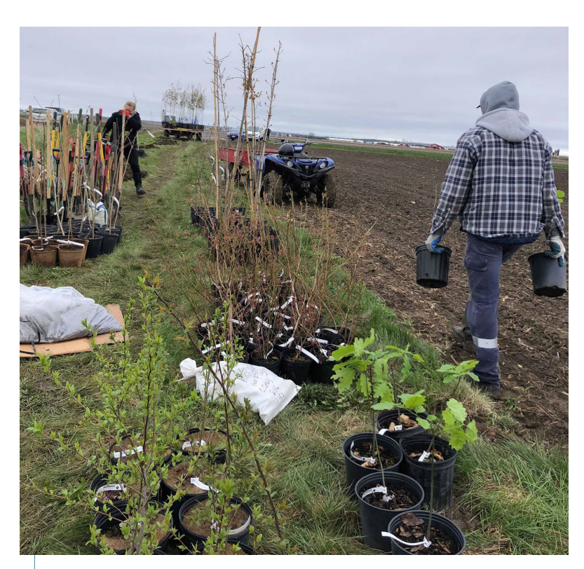
Students and SNC staff planting an edible tree buffer in St. Isidore