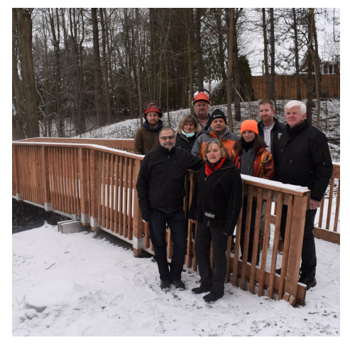
New bridge at J. Henry Tweed Conservation Area

2019 was a year of many CA upgrades! Improvement highlights included: a new bridge at J. Henry Tweed along with new trees being planted, a new dock installed in Cardinal and maple sap pipelines installed at Oschmann Forest.