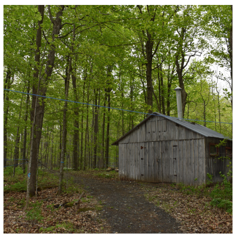
Maple Sap pipelines at Oschmann Forest Conservation Area