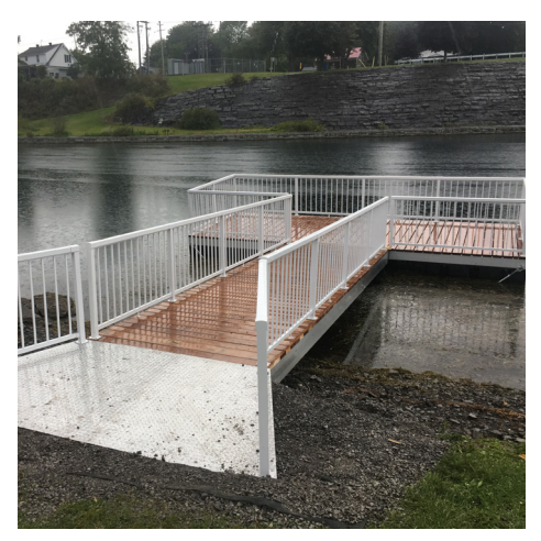
New dock installed in Cardinal on the St. Lawrence River