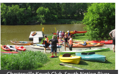
Chesterville Kayak Club, South Nation River

The Geoportal can be accessed on SNC's homepage at www.nation.on.ca.