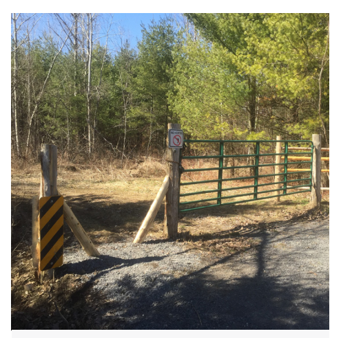
Warwick Forest Conservation Area, in Berwick

2016 was a year of many CA upgrades! Some of the improvements include: 2 new bridges at Two Creeks Forest CA, new horse fencing at Warwick Forest CA, new accessible dock at High Falls CA, 10 partnership docks maintained, and interpretive signs installed along the Findlay Creek Boardwalk in Ottawa.