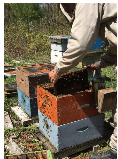
SNC staff experienced bee keeping first-hand at Ambrosia Apiaries, in Berwick.

Partnerships with First Nations ensure the protection of culturally significant species through the guidance, wisdom and holistic perspective of First Nations.