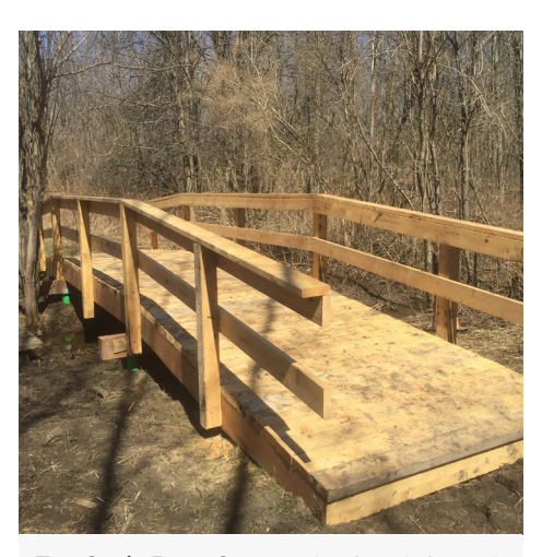
Two Creeks Forest Conservation Area, in Iroquois