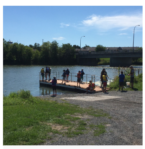
High Falls Conservation Area, in Casselman