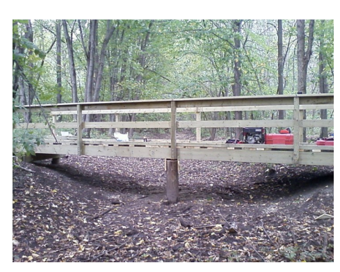
The photo above shows a new bridge installed at Two Creeks Conservation Area near Iroquois. The many upgrades made to this Conservation Area in 2011 will allow residents to take full advantage of the natural beauty of this Property.

are evident. Improvements undertaken in 2011 include: a parking lot expansion with addition of 120 tonnes of gravel; 4.5 kms of marked trail with addition of 150 tonnes of gravel; and two new foot bridges. SNC offers special thanks to South Dundas for their contributions. SNC maintains 7 Conservation Areas and a number of trails and river access docks for the use and benefit of watershed residents. These areas are perfect spaces for family friendly activities. At Two Creeks, hunting and motorized vehicles are not permitted, but hiking and cross-country skiing are welcome.