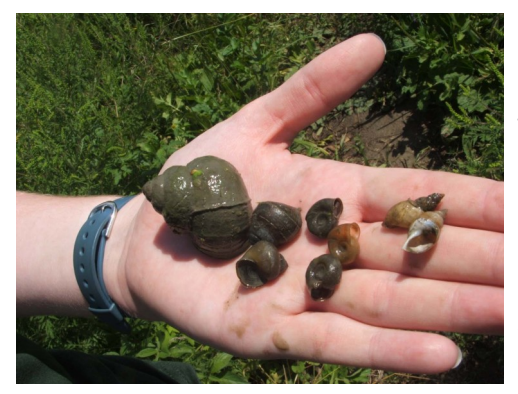
Live creatures, dumped by owners who are no longer prepared to care for them, can carry diseases to native species while competing for food and habitat.

In 2011, SNC fisheries staff discovered Chinese mystery snails in a Winchester drain, and a red-eared slider turtle in the Payne River near Finch. Also called rice snails, the more commonly known mystery snails grow very large and can be present in high densities, clogging water pipes and inhibiting flow. They compete with native snails for food and space. The snails were found in an area stretching from the Gypsy Road culvert south of Winchester to the culvert on County Road 3 north of the village; the highest snail density is within the village itself. The most likely explanation is that