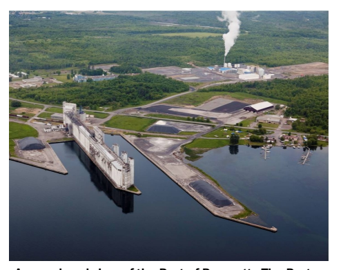
An overhead view of the Port of Prescott. The Port of Prescott is the only deep water port between Montreal and Toronto.

across from it. Edwardsburgh-Cardinal was keen to rely on the expertise of SNC for environmental project management for the expansion of the Port. SNC's involvement on the Project has resulted in significant cost savings for the Municipality.