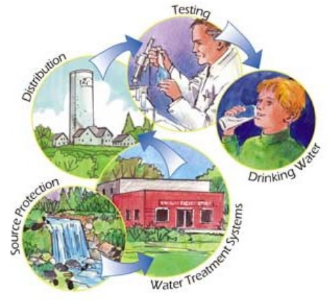
Source Protection considers protecting municipal drinking water at its source in the natural environment

jects were also completed with provincial funding with local property owners. The projects will help protect water sources in Protection Zones. The key to source protection work is its local focus and local solutions. South Nation Conservation and Raisin Region Conservation Authority have worked together with the provincial government, First Nations, municipal politicians, planners, water treatment plant operators, businesses, community groups, and agriculture to identify local solutions that make sense. Many watershed Municipalities have expressed interest in working with SNC in the delivery and implementation of their local Source Protection Plan.