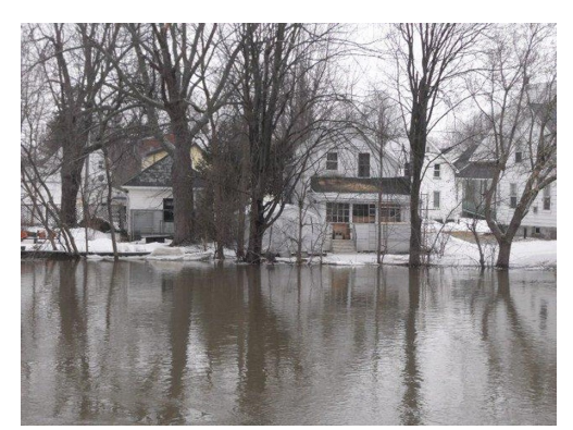
This photo was taken in the Village of Chesterville in the Municipality of North Dundas, showing high water levels on the South Nation River during 2011.

The ability of our watersheds to adapt to changing climate conditions, unpredictable weather, and associated flood threats directly impacts the safety, security, and economic well-being of residents. Protecting homes and people from the dangers of flooding and erosion is a key priority upon which Conservation Authorities are based. SNC works with municipalities and property owners to help people and places prepare for high and low water levels. Eleven Flood Safety Bulletins were issued in 2011 to warn residents of Spring run-off and heavy rainfall events. While no major flooding was observed, SNC staff monitored conditions closely throughout the year using a network of monitoring stations and snow surveys. After a normal spring melt, watersheds dried out con-