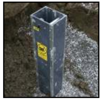
Figure 3: Tile drain control structure installed on a tile header for the WEBs – controlled drainage BMP.

AAFC and SNC had 36 drainage control structures (figure 3) installed in 18 fields in 2006. A significant monitoring effort continues (figure 4) to capture any changes in water quality from the controlled and uncontrolled tile drains in the study area, in addition to regular monitoring of water quality in municipal drains and local rivers.