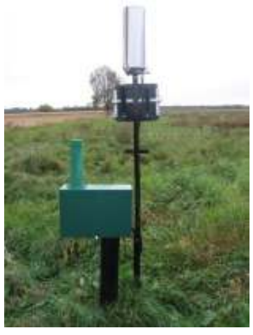
Provincial Groundwater Monitoring Program well set-up.

In 2001 and 2002, the MOE hydrogeologists and SNC staff identified sensitive groundwater areas within the SNR watershed that would be incorporated into the Provincial Groundwater Monitoring Network (PGMN). SNC currently maintains 17 wells for the network.