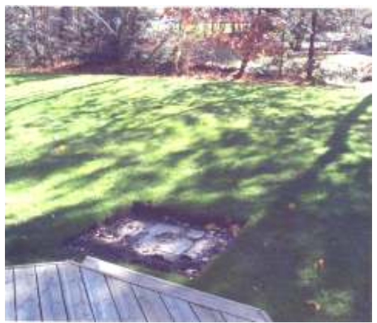
Example of a "before" septic system project.

The combined number of projects completed for the 3 CAs was 80 for a total of $116,856 in grants and an estimated total project value of $758,800.