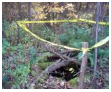
Example of an abandoned well decommissioned with the EOWRC grant funding

SNC delivered grants to landowners within the EOWRMS study area to properly decommission abandoned wells. The grant rate was 100% of the total costs to a maximum of $1,000/well. The grants were delivered through the Clean Water Program in the SNR watershed and by SNC staff in the remainder of the EOWRMS area. The EOWRC funding was also utilized by the Ottawa Rural Clean Water Program to supplement grants in the City of Ottawa portion of the EOWRMS area.