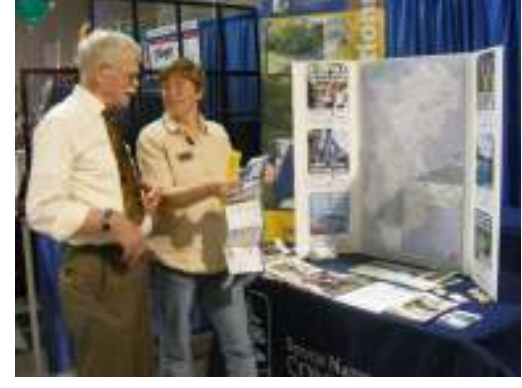
SNC staff talking with landowner at SNC booth at the South Stormont Spring Show