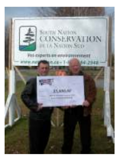
2009 St. Albert Cheese cheque ($5,000) presentation to the Clean Water Committee

St. Albert Cheese has provided annual funding to the Clean Water Program since 2004. The 2009 contributed of $5,000 brings the total contribution amount to $36,000 for the past six years.