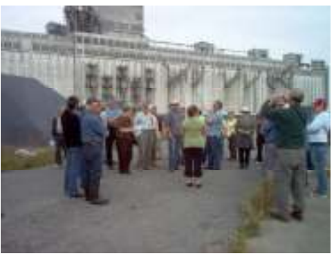
Fall Watershed Tour - Sommerville Farm visit

SNC hosted the Fall Watershed Tour on September 23<sup>rd</sup>, 2009; the area of focus was the upper watershed (United Counties of Leeds and Grenville).