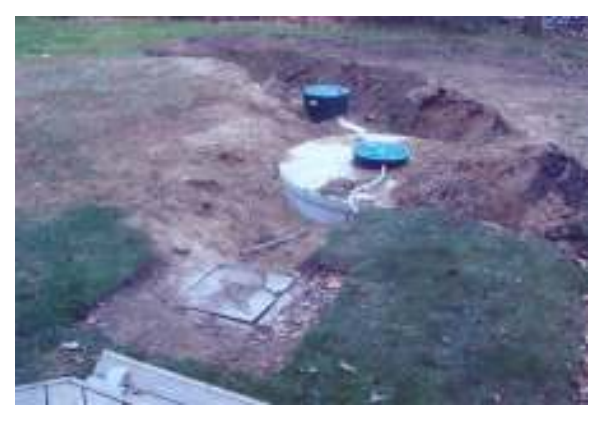
"After" septic system replacement, prior to final site grading.