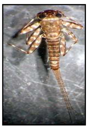
Ephemeroptera (Mayfly), is an example of a benthic invertebrate that can be used as a biological indicator of water quality.

SNC has initiated a new sampling regime using the OBBN to try and collect data in areas previously lacking. The regime is based on dividing the watershed into 5 sections and each year a section is sampled at 10 different sites. Over the course of 5 years the entire watershed will be covered, allowing for a complete watershed-wide water quality report to be produced, in conjunction with PWQMN and WC data.