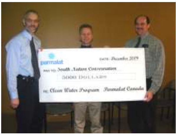
2009 Parmalat cheque ($5,000) presentation to the Clean Water Program

Parmalat has a long history of contributing to SNC, providing $270,000 to the Clean Water Program between 1998-2008. These past donations have helped to fund over 80 landowner cost-share grants to implement best management practices.