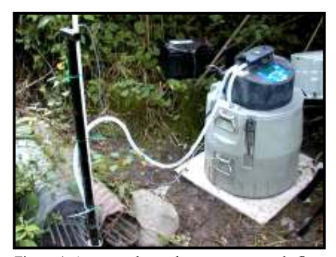
Figure 4: Automated sampler set-up to sample flow from the tiles for the WEBs – controlled drainage BMP.