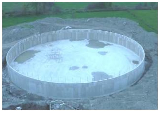
Manure Storage "after" photo