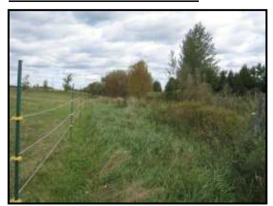
Cattle fencing and alternate watering project site for WEBs project.

The second project component, restricted versus unrestricted access of cattle to a stream, was implemented in 2006.