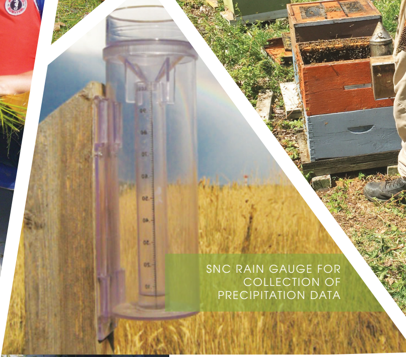
SNC RAIN GAUGE FOR COLLECTION OF PRECIPITATION DATA