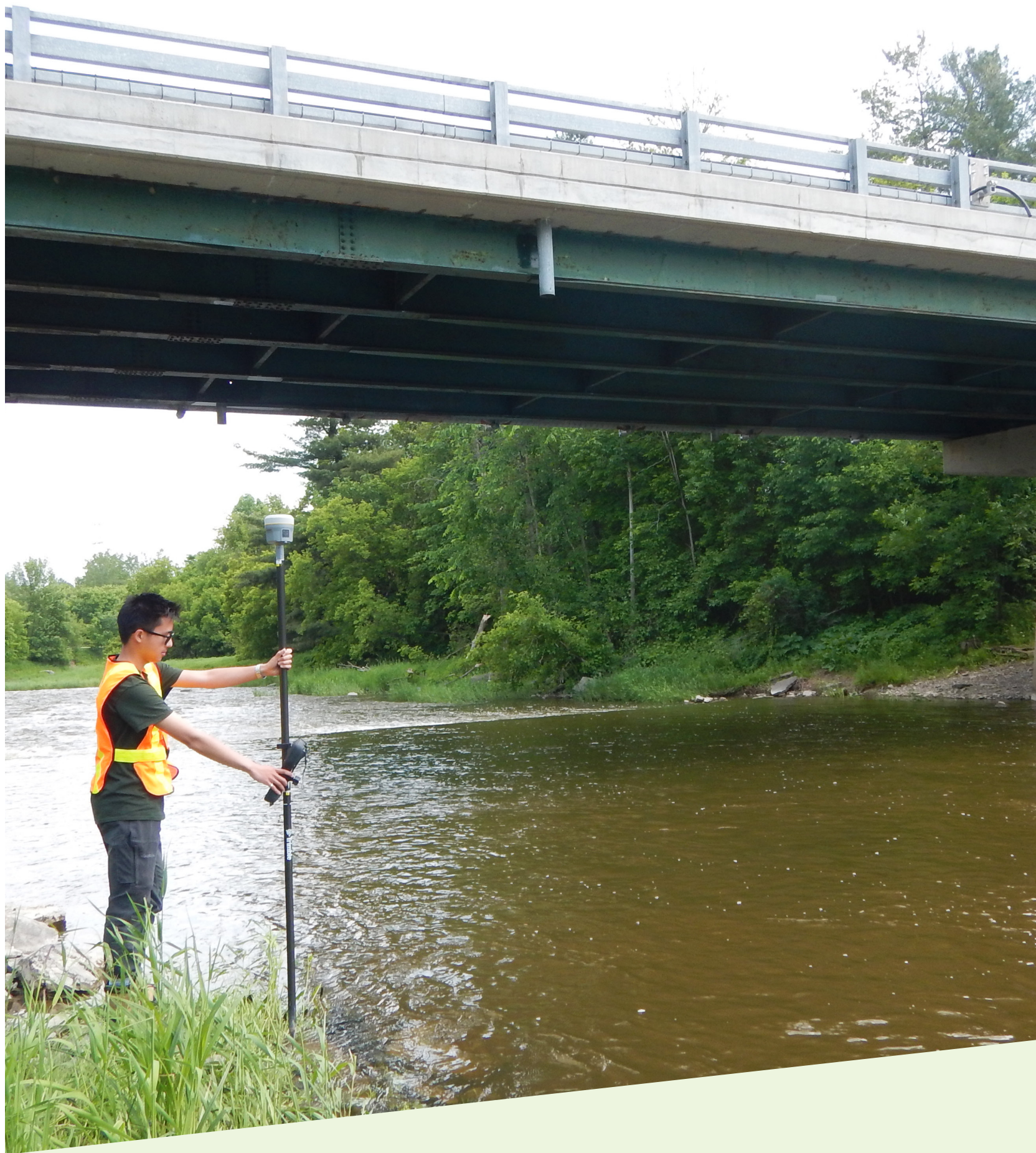
SURVEYS FOR FLOODPLAIN MAPPING