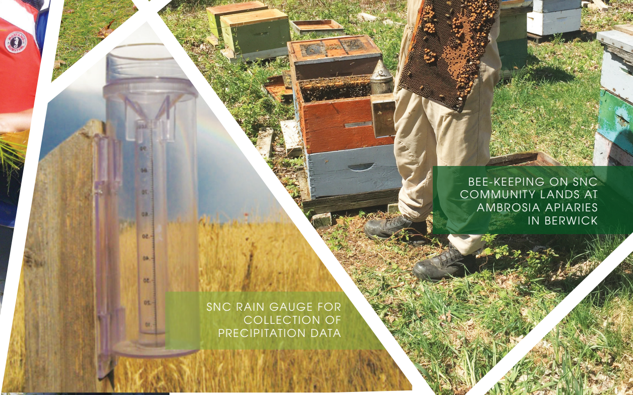
BEE-KEEPING ON SNC COMMUNITY LANDS AT AMBROSIA APIARIES IN BERWICK