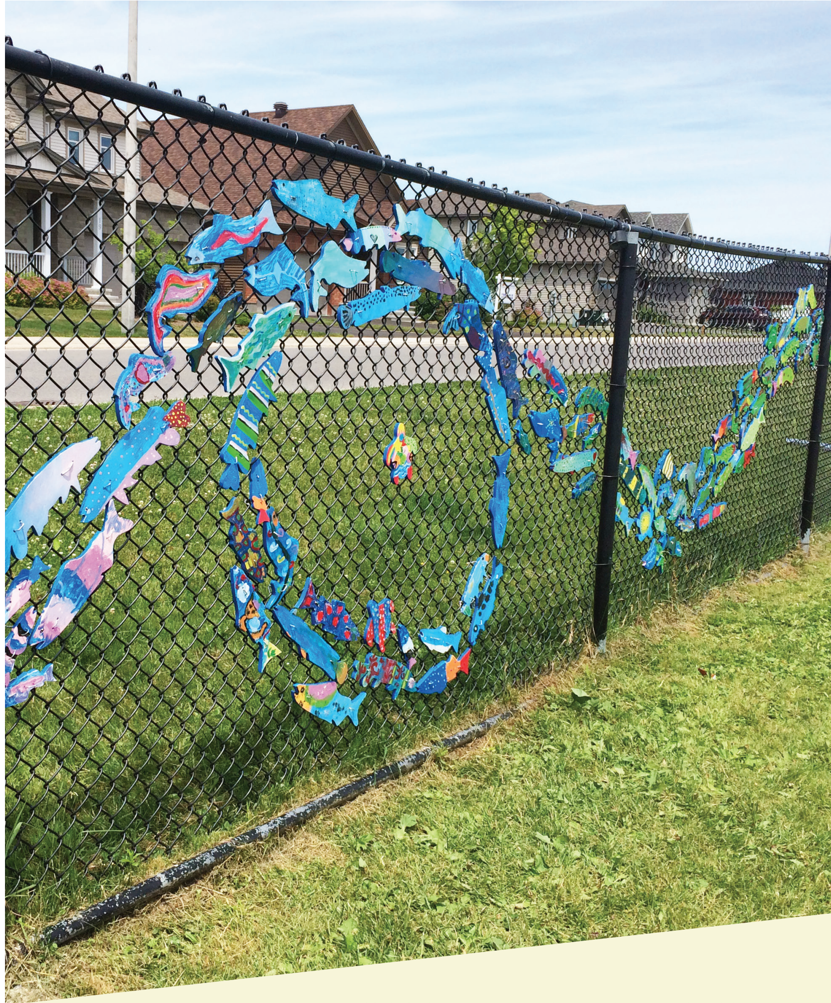
IN 2018, SNC DELIVERED THE STREAM OF DREAMS PROGRAM AT MOTHER TERESA CATHOLIC SCHOOL