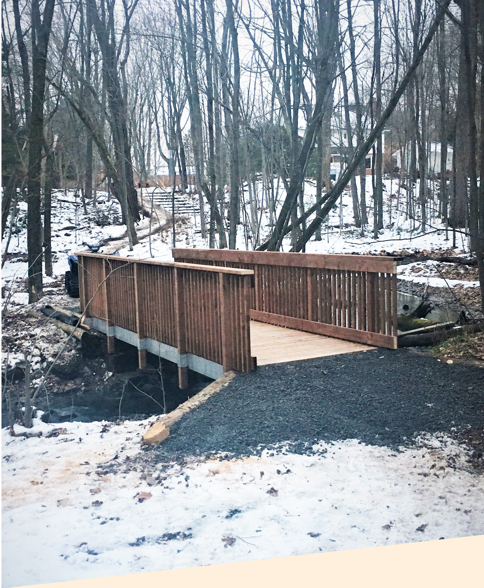
IN 2018, SNC INSTALLED A NEW FOOT-BRIDGE AT J. HENRY TWEED CONSERVATION AREA