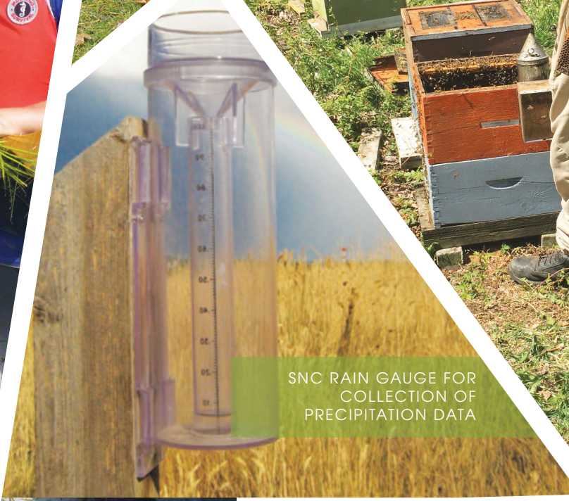
SNC RAIN GAUGE FOR COLLECTION OF PRECIPITATION DATA