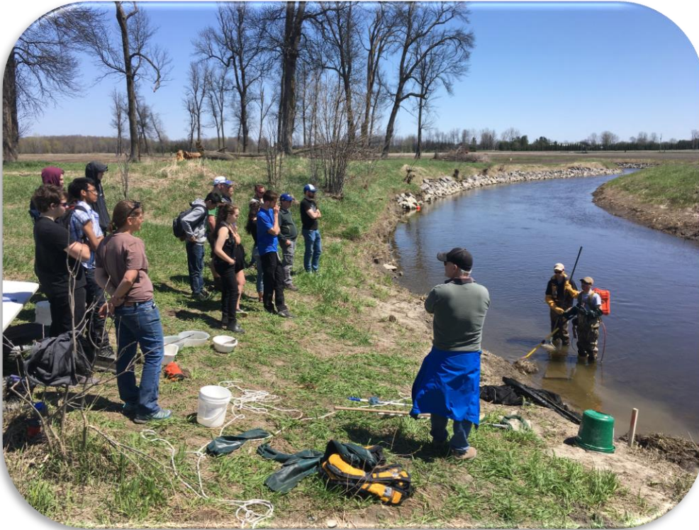
Electrofishing demonstration South Castor River