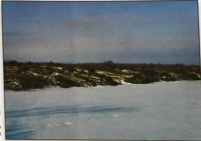
Even some farmers are concerned that the bushland being cleared may not be suitable for intensive agriculture

"They left the rest in bush because the ground wasn't good and probably too stony. Should we be clearing all of that?"