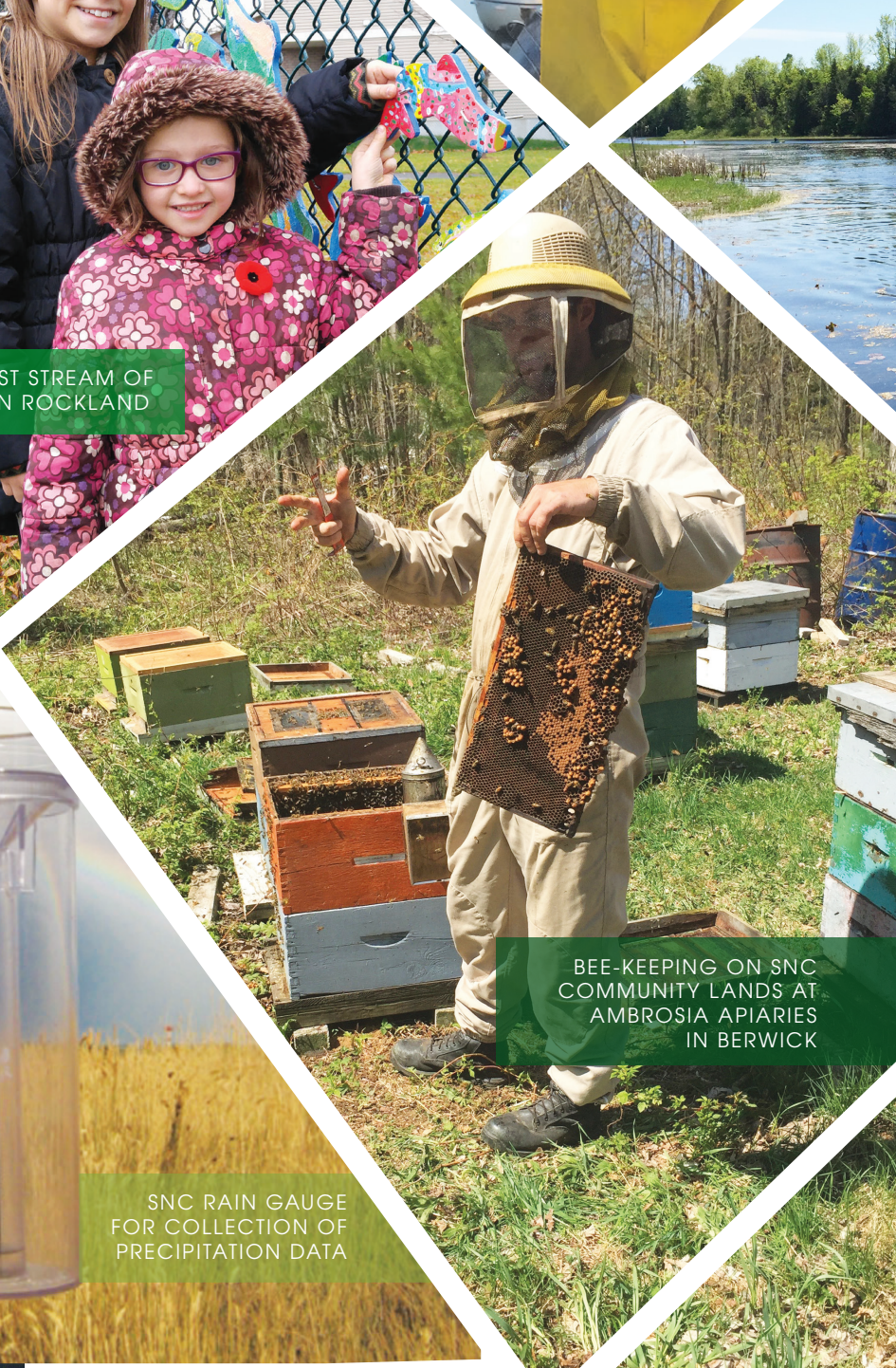
BEE-KEEPING ON SNC COMMUNITY LANDS AT AMBROSIA APIARIES IN BERWICK