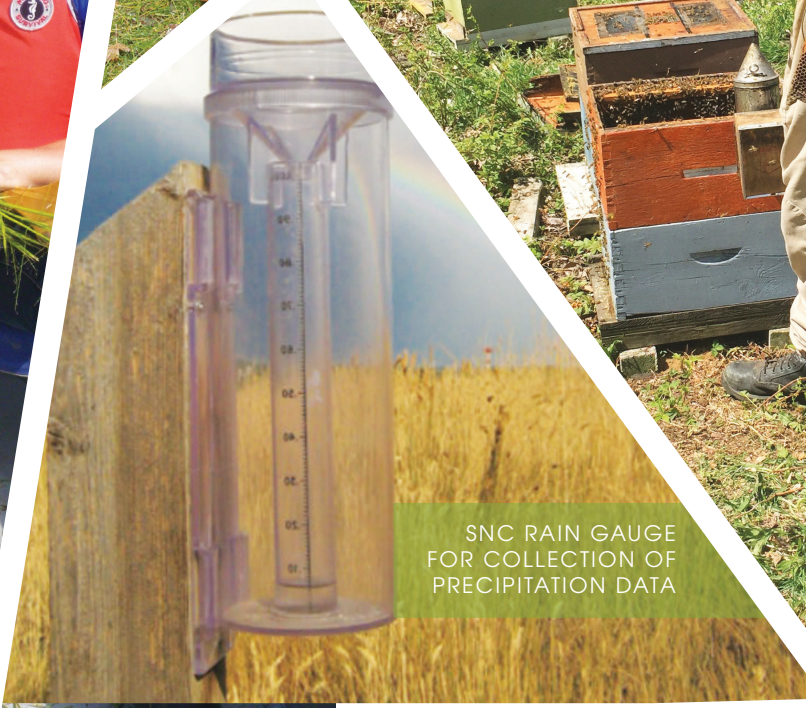
SNC RAIN GAUGE FOR COLLECTION OF PRECIPITATION DATA