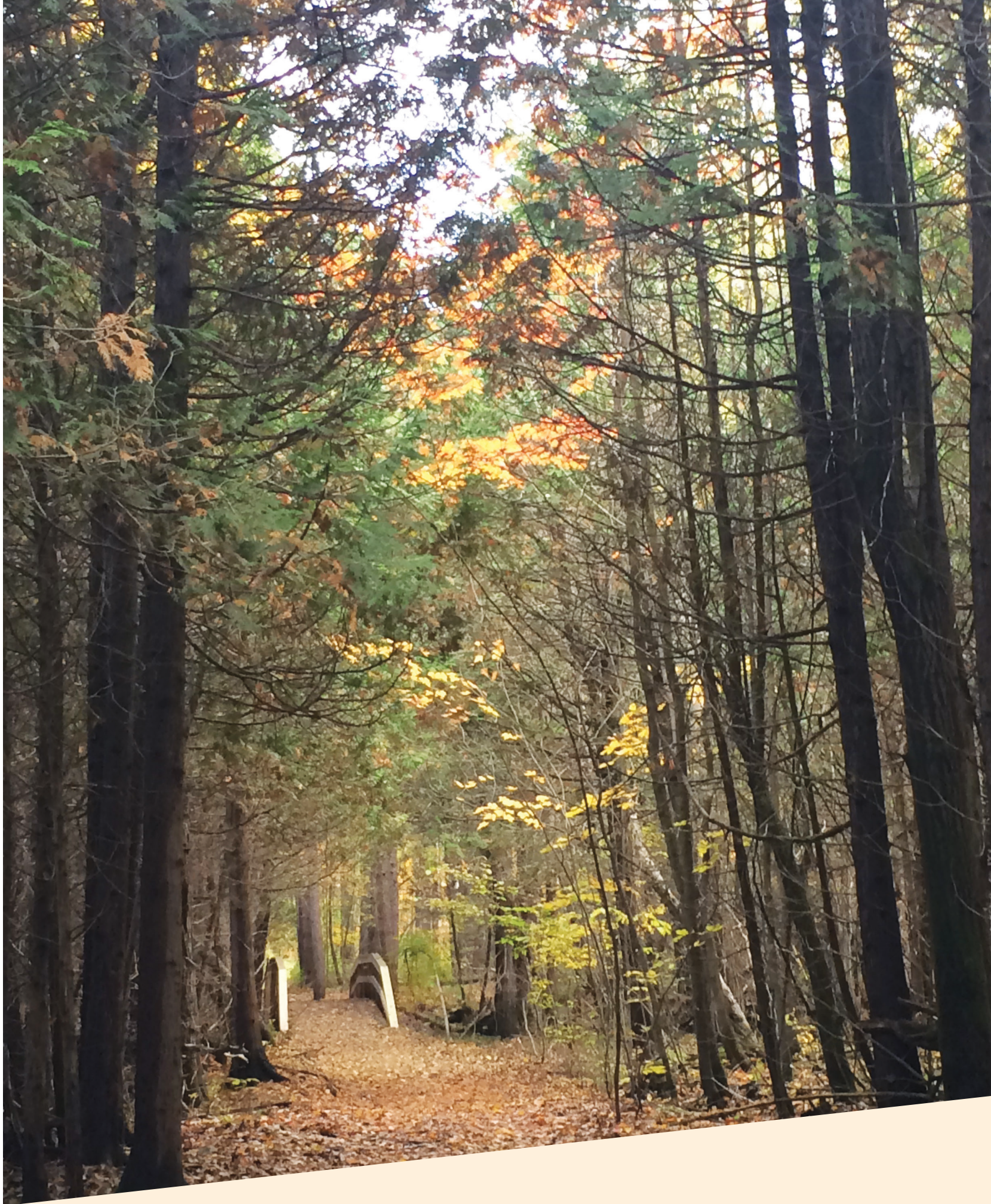
WARWICK FOREST IN BERWICK