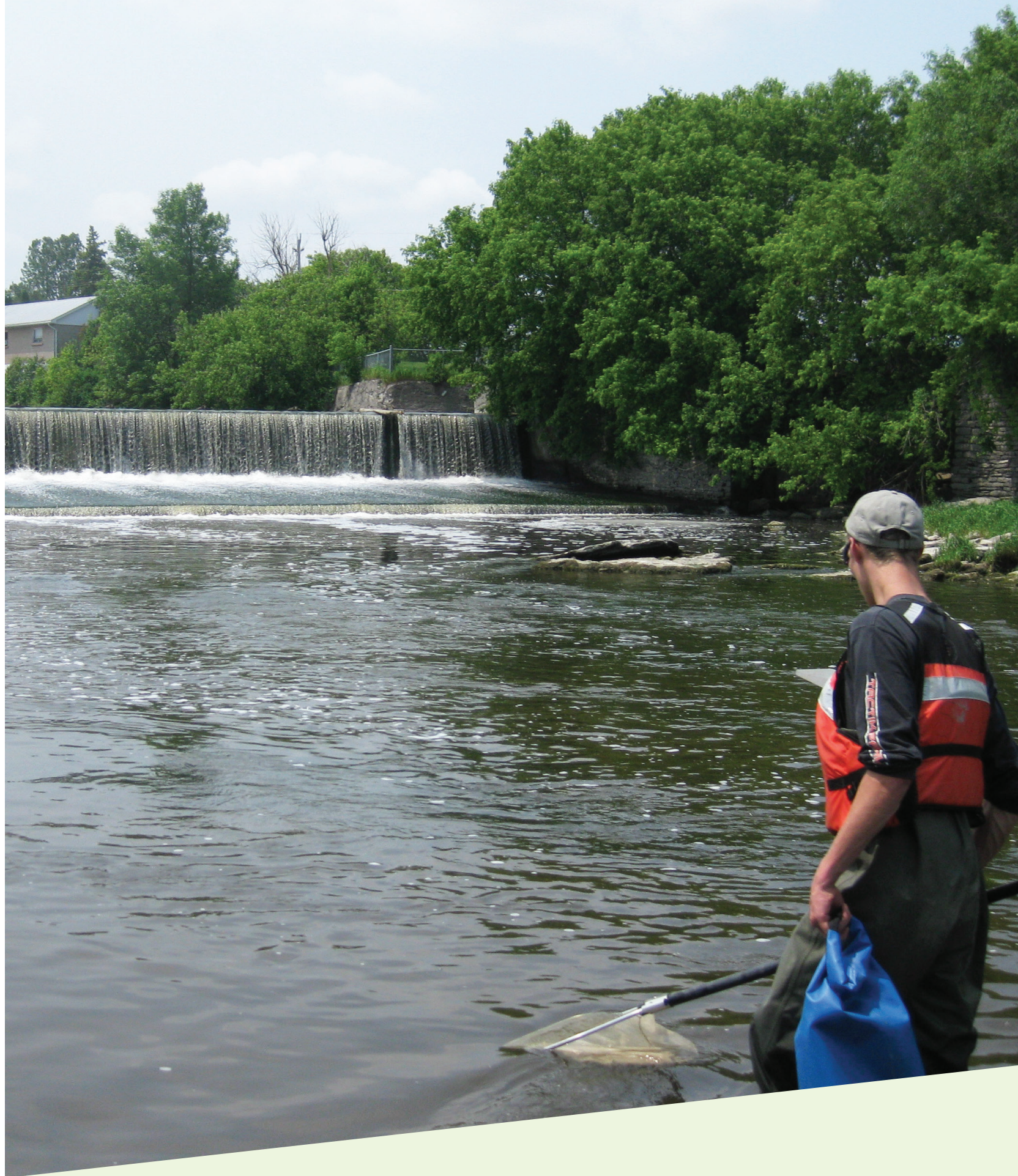
THE CRYSLER DAM