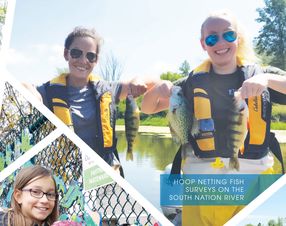
HOOP NETTING FISH SURVEYS ON THE SOUTH NATION RIVER