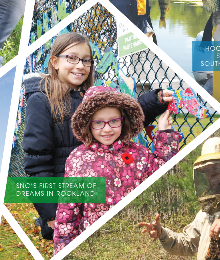
SNC'S FIRST STREAM OF DREAMS IN ROCKLAND