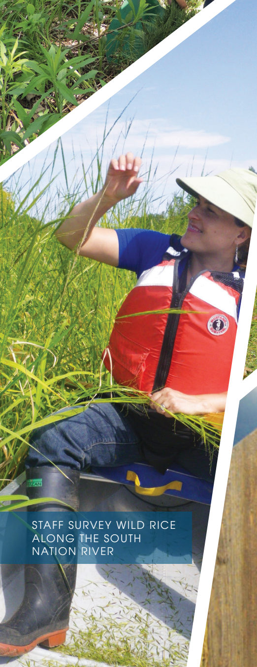
STAFF SURVEY WILD RICE ALONG THE SOUTH NATION RIVER