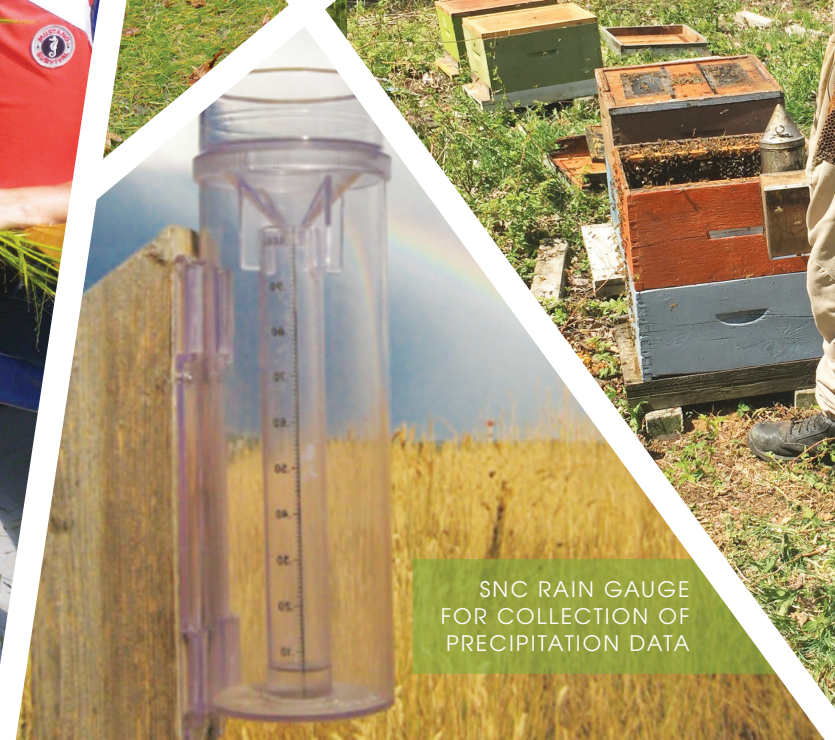
SNC RAIN GAUGE FOR COLLECTION OF PRECIPITATION DATA