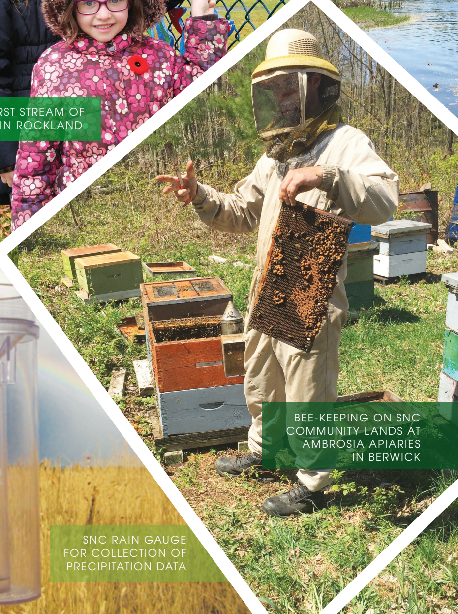
BEE-KEEPING ON SNC COMMUNITY LANDS AT AMBROSIA APIARIES IN BERWICK