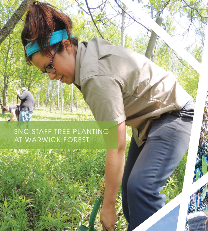
SNC STAFF TREE PLANTING AT WARWICK FOREST