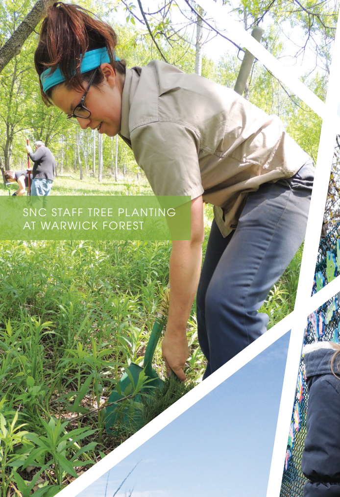
SNC STAFF TREE PLANTING AT WARWICK FOREST