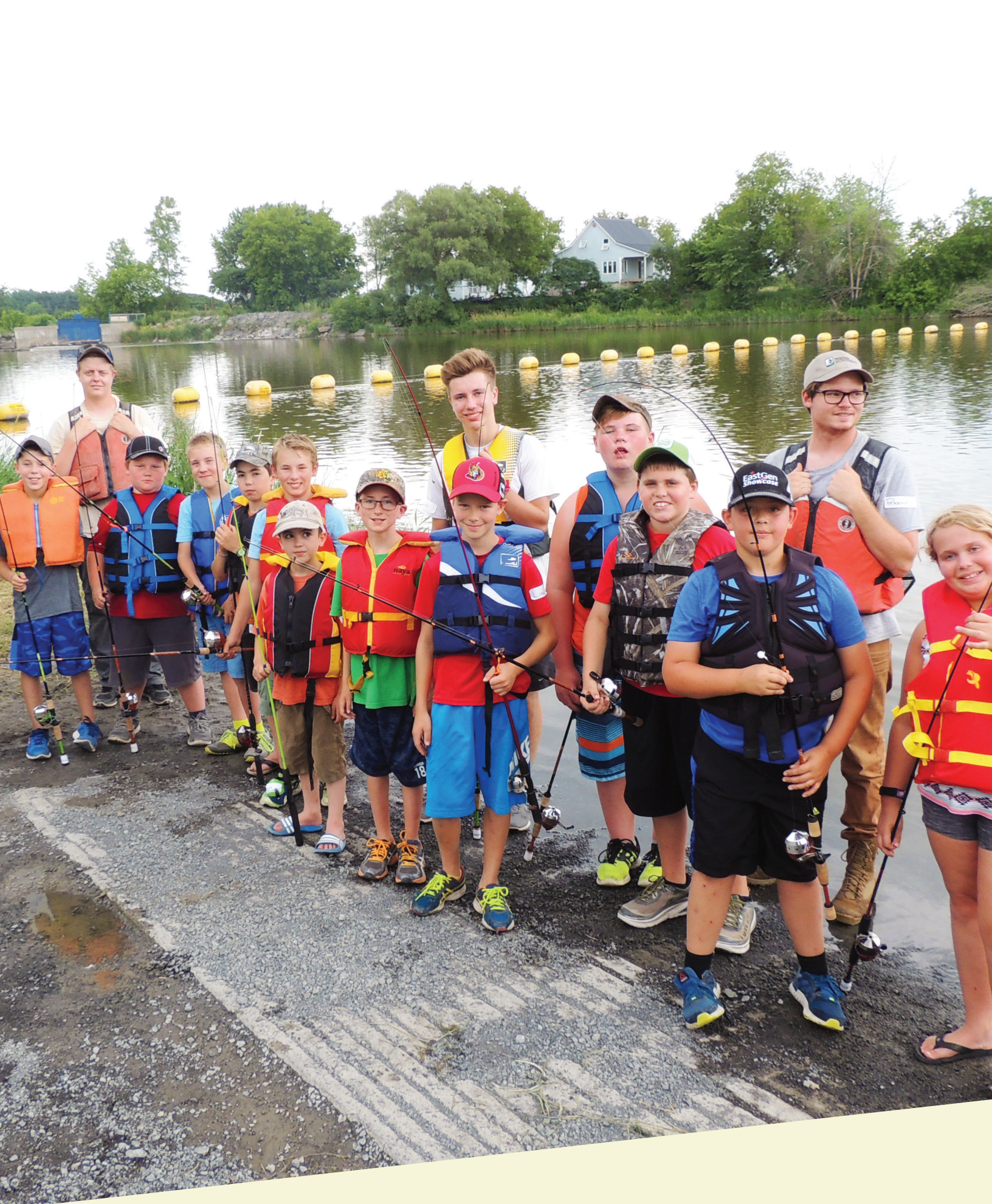
IN 2018, SNC HOSTED DOZENS OF LOCAL YOUTH AT ITS ANNUAL FISH CAMPS