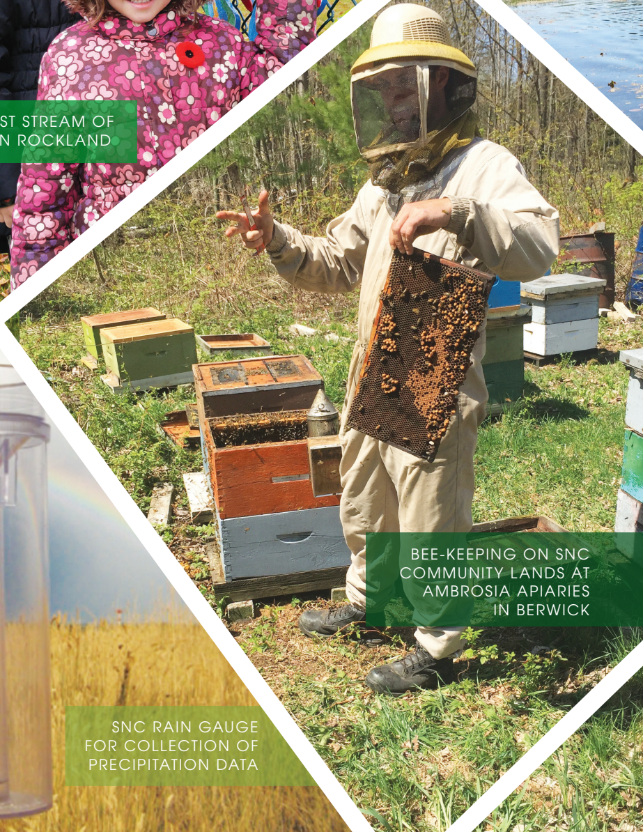
BEE-KEEPING ON SNC COMMUNITY LANDS AT AMBROSIA APIARIES IN BERWICK