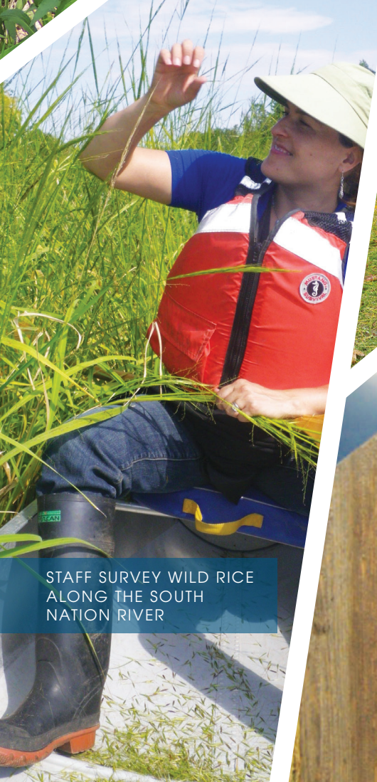
STAFF SURVEY WILD RICE ALONG THE SOUTH NATION RIVER