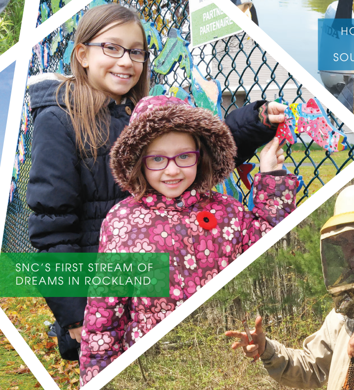
SNC'S FIRST STREAM OF DREAMS IN ROCKLAND