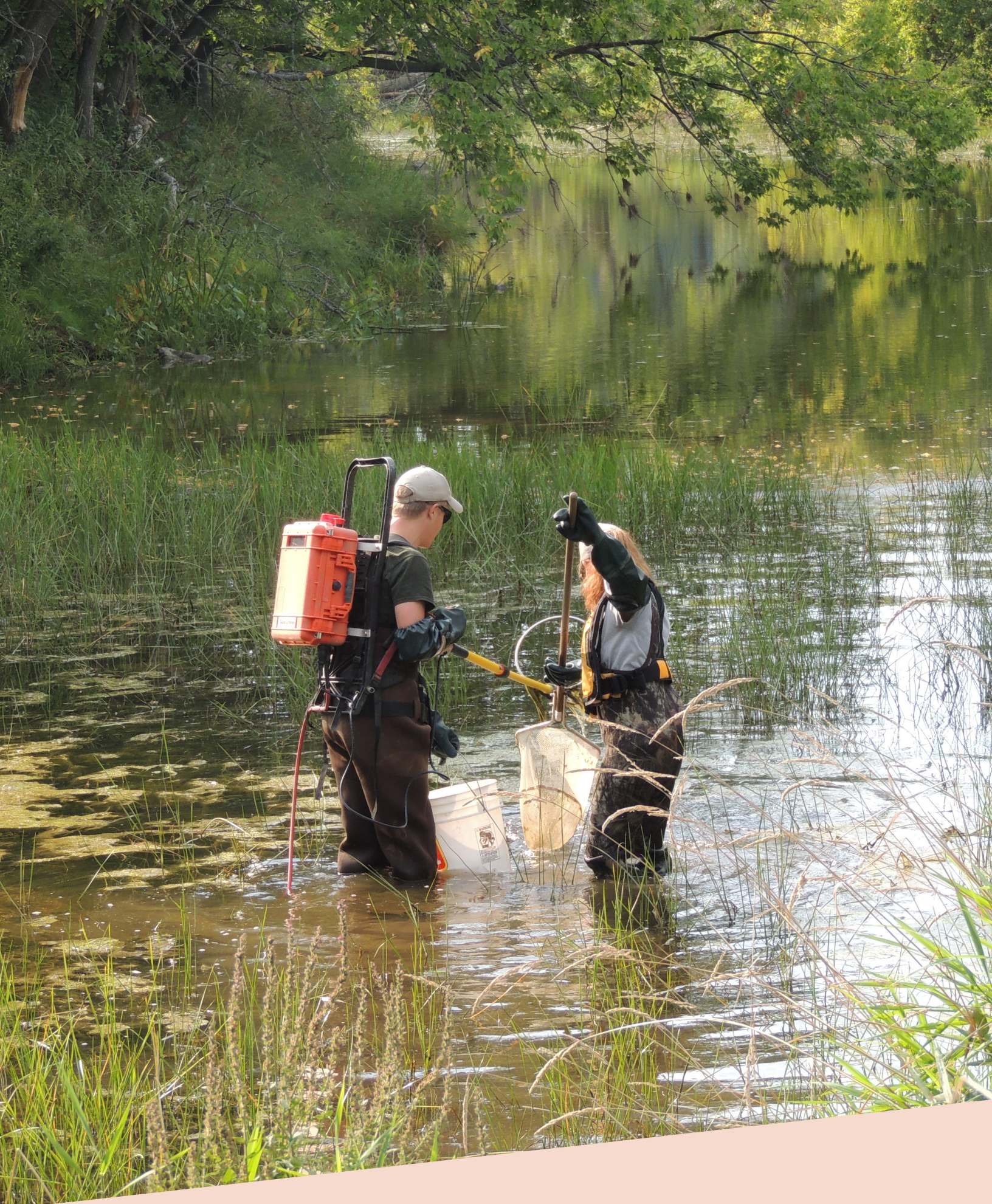
ELECTROFISHING ON THE SOUTH NATION RIVER