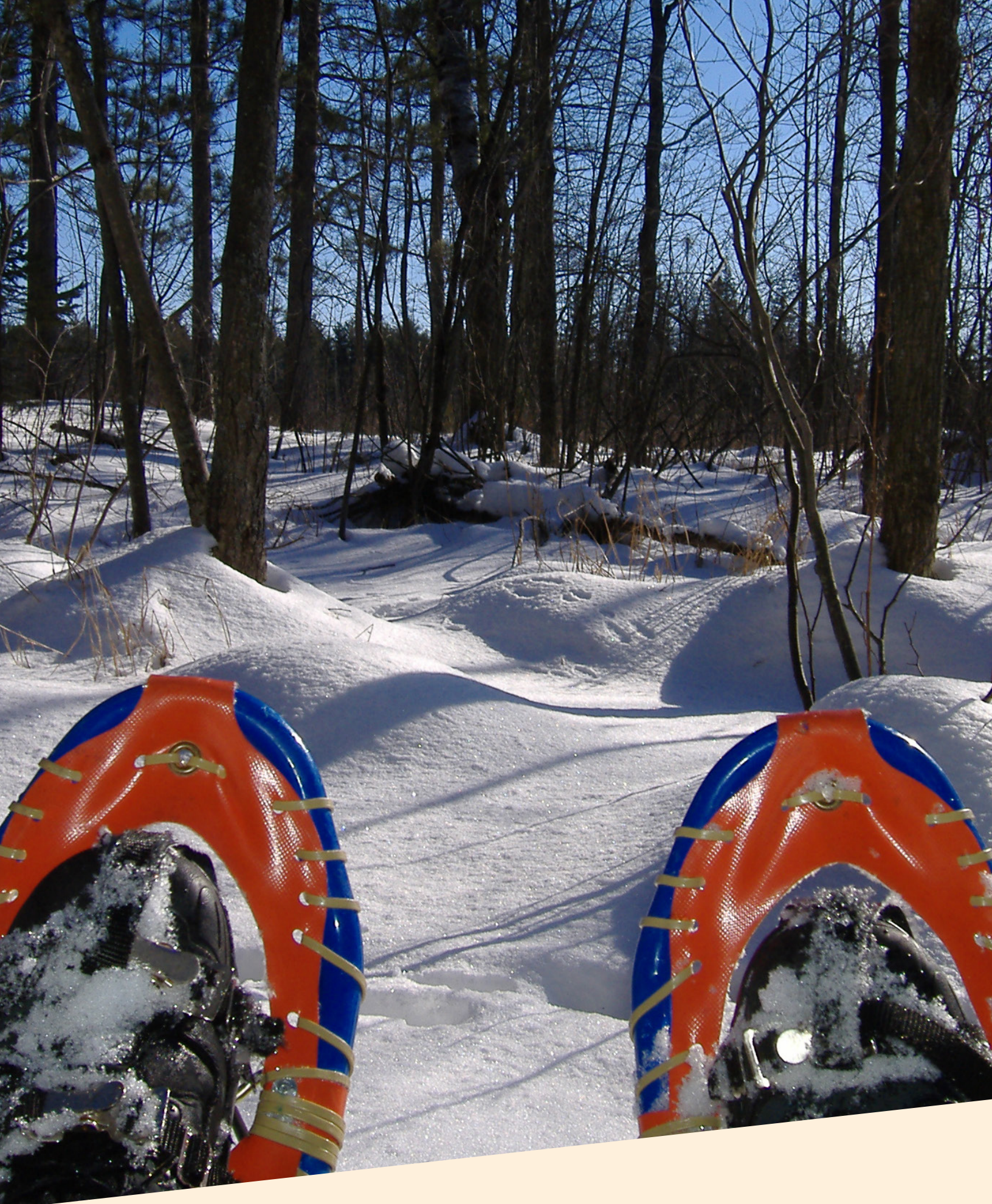
SNOWSHOEING IS A POPULAR PASTIME AT MANY OF SNC'S CONSERVATION AREAS