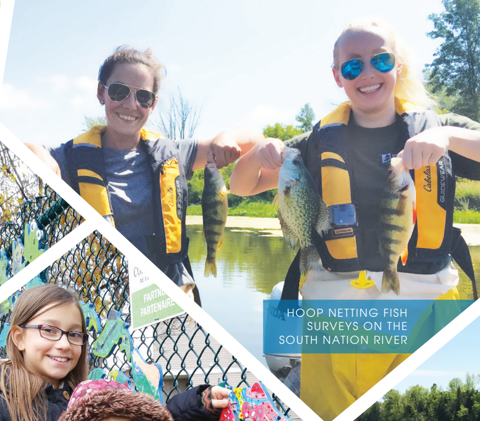
HOOP NETTING FISH SURVEYS ON THE SOUTH NATION RIVER