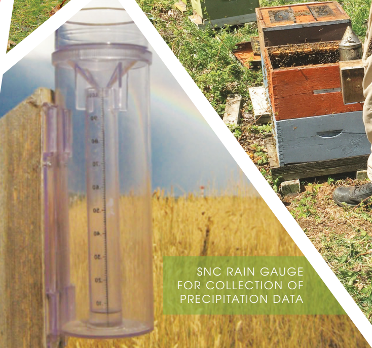
SNC RAIN GAUGE FOR COLLECTION OF PRECIPITATION DATA