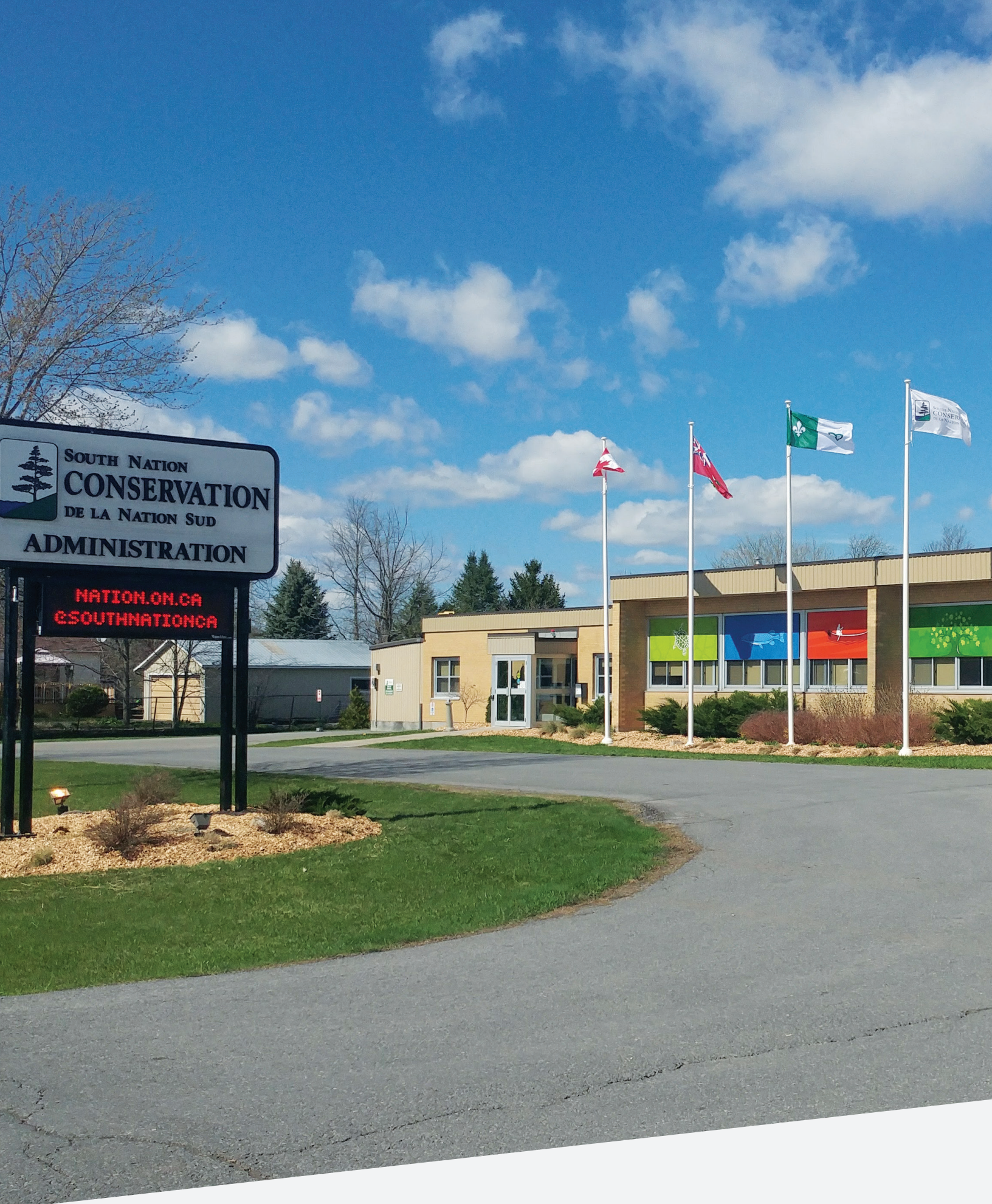
SOUTH NATION CONSERVATION ADMINISTRATION BUILDING, FINCH