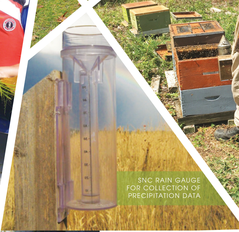
SNC RAIN GAUGE FOR COLLECTION OF PRECIPITATION DATA