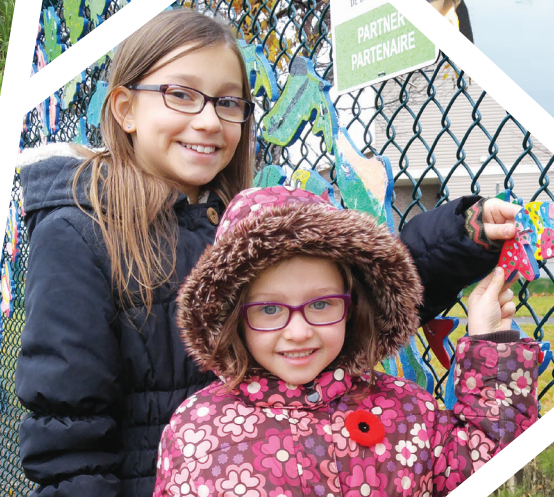
SNC'S FIRST STREAM OF DREAMS IN ROCKLAND