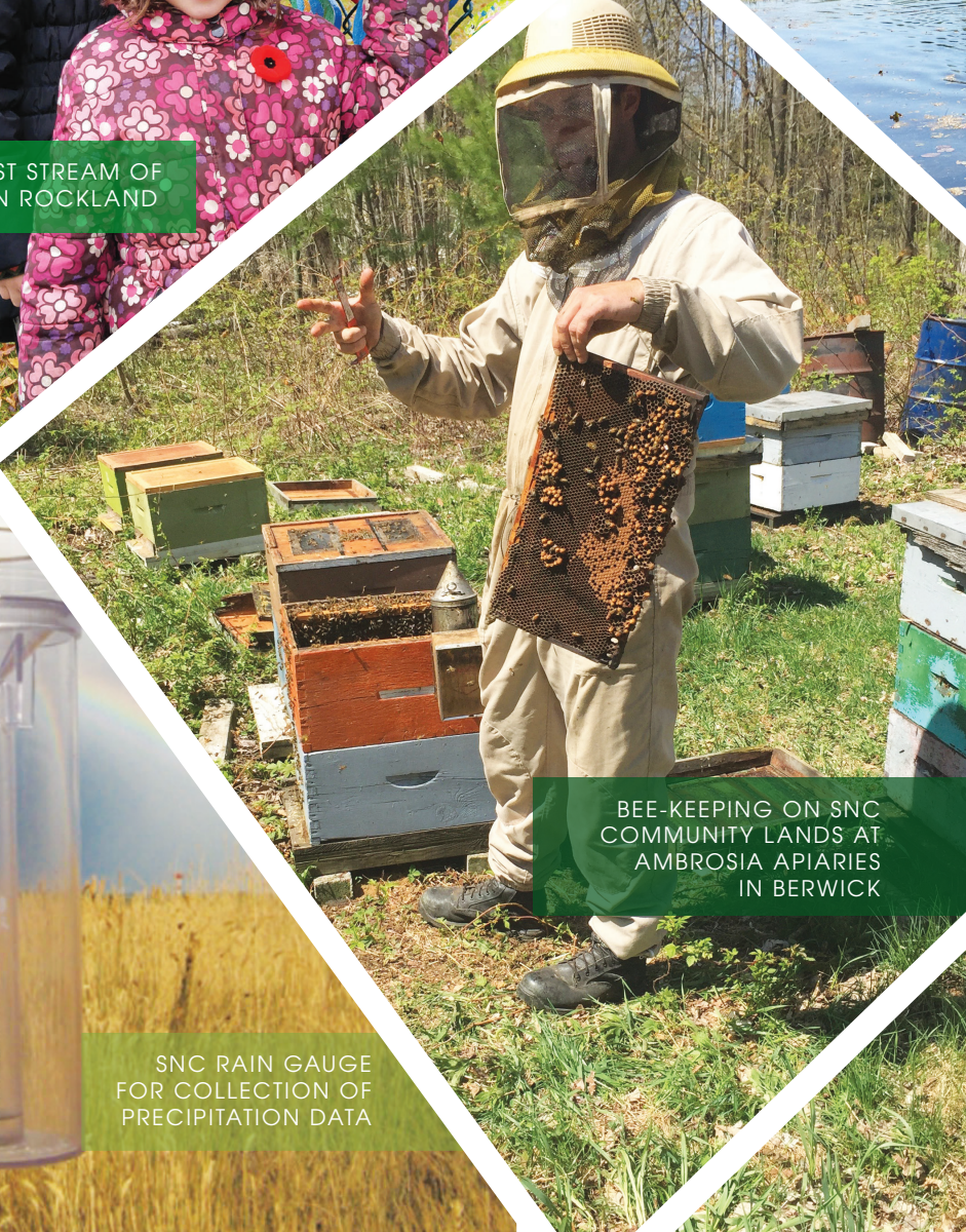
BEE-KEEPING ON SNC COMMUNITY LANDS AT AMBROSIA APIARIES IN BERWICK