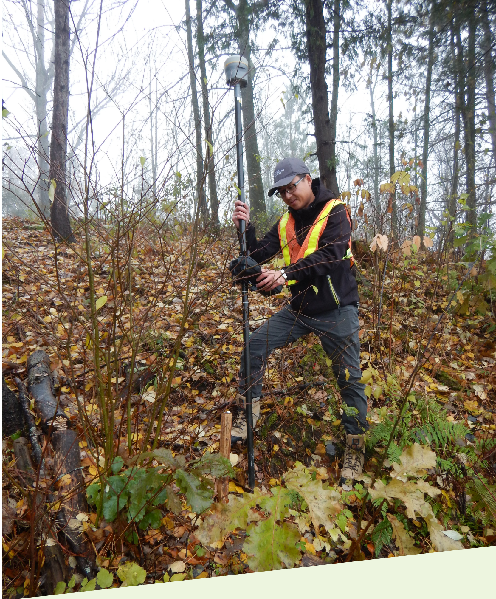
SURVEYS FOR FLOODPLAIN MAPPING