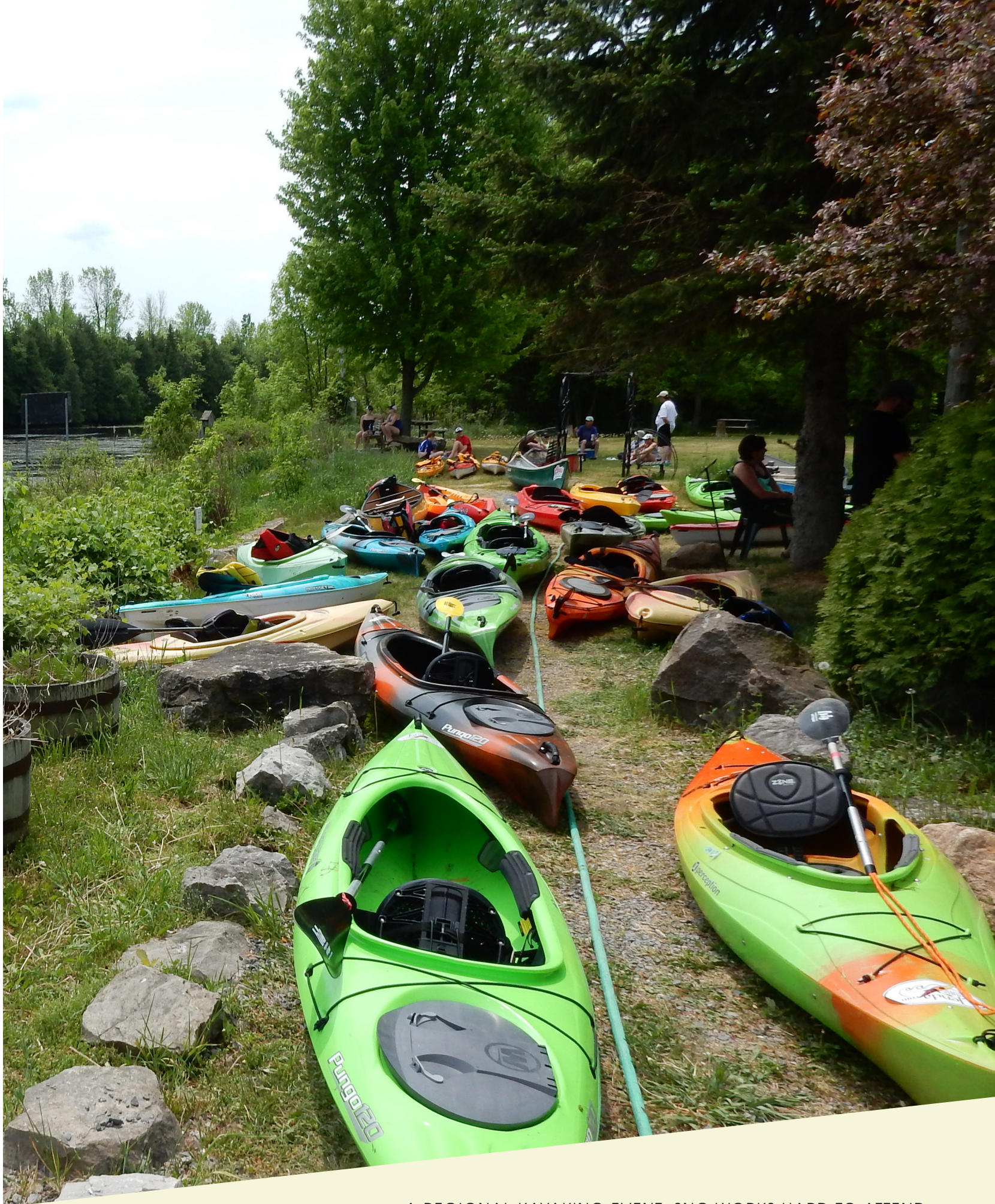
A REGIONAL KAYAKING EVENT; SNC WORKS HARD TO ATTEND AND SUPPORT LOCAL COMMUNITY EVENTS FOCUSED ON OUR LOCAL ENVIRONMENT.