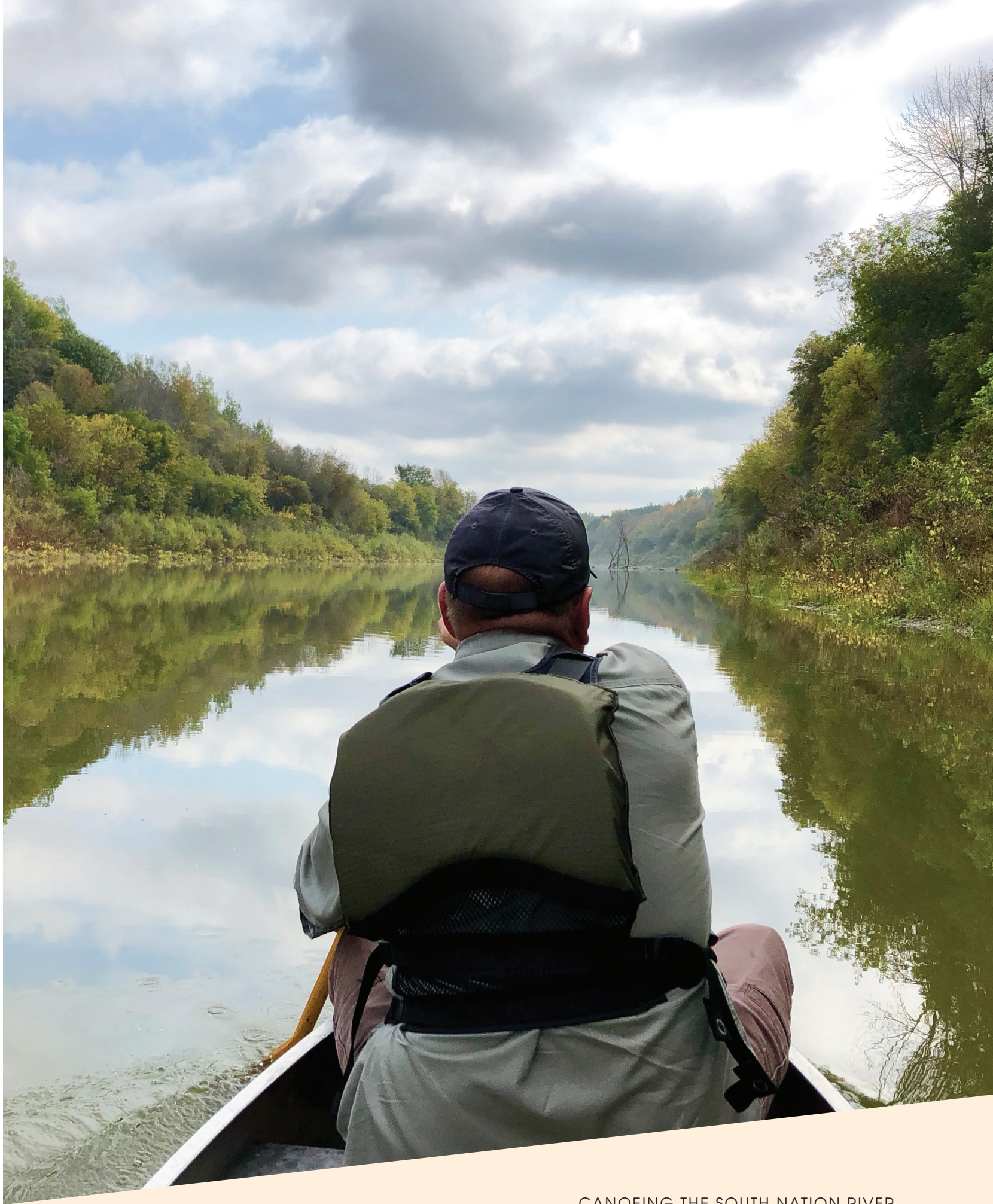
CANOEING THE SOUTH NATION RIVER