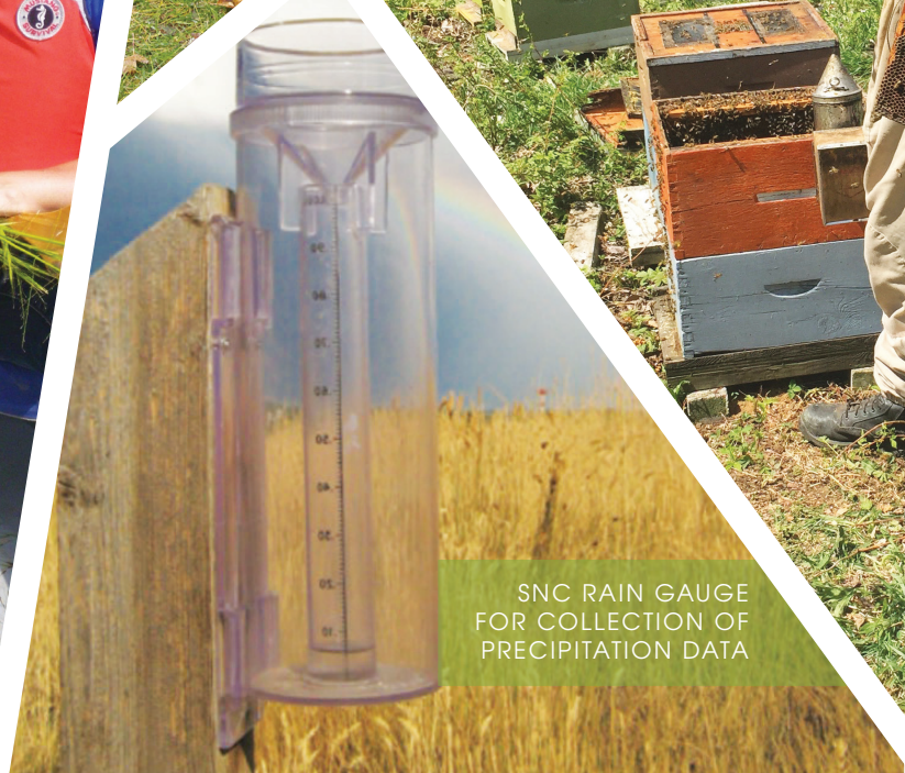
SNC RAIN GAUGE FOR COLLECTION OF PRECIPITATION DATA