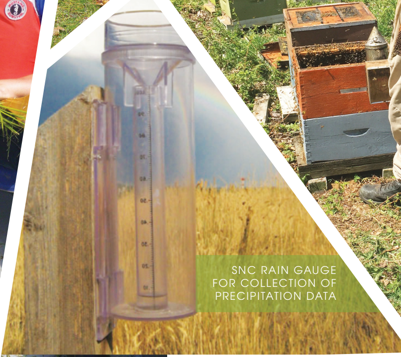
SNC RAIN GAUGE FOR COLLECTION OF PRECIPITATION DATA