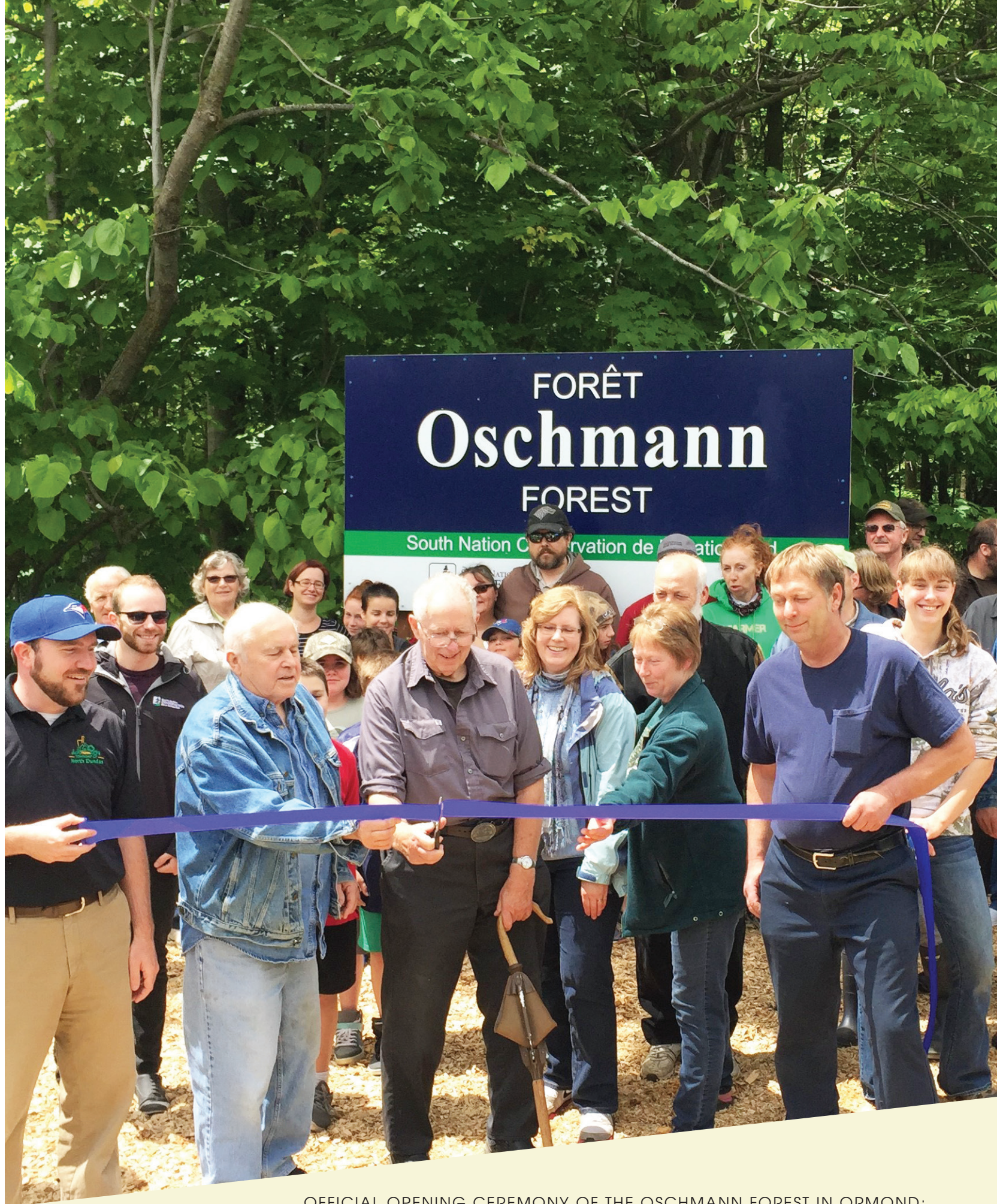
OFFICIAL OPENING CEREMONY OF THE OSCHMANN FOREST IN ORMOND; THE NEW HOME OF SNC'S MAPLE SYRUP EDUCATION PROGRAM