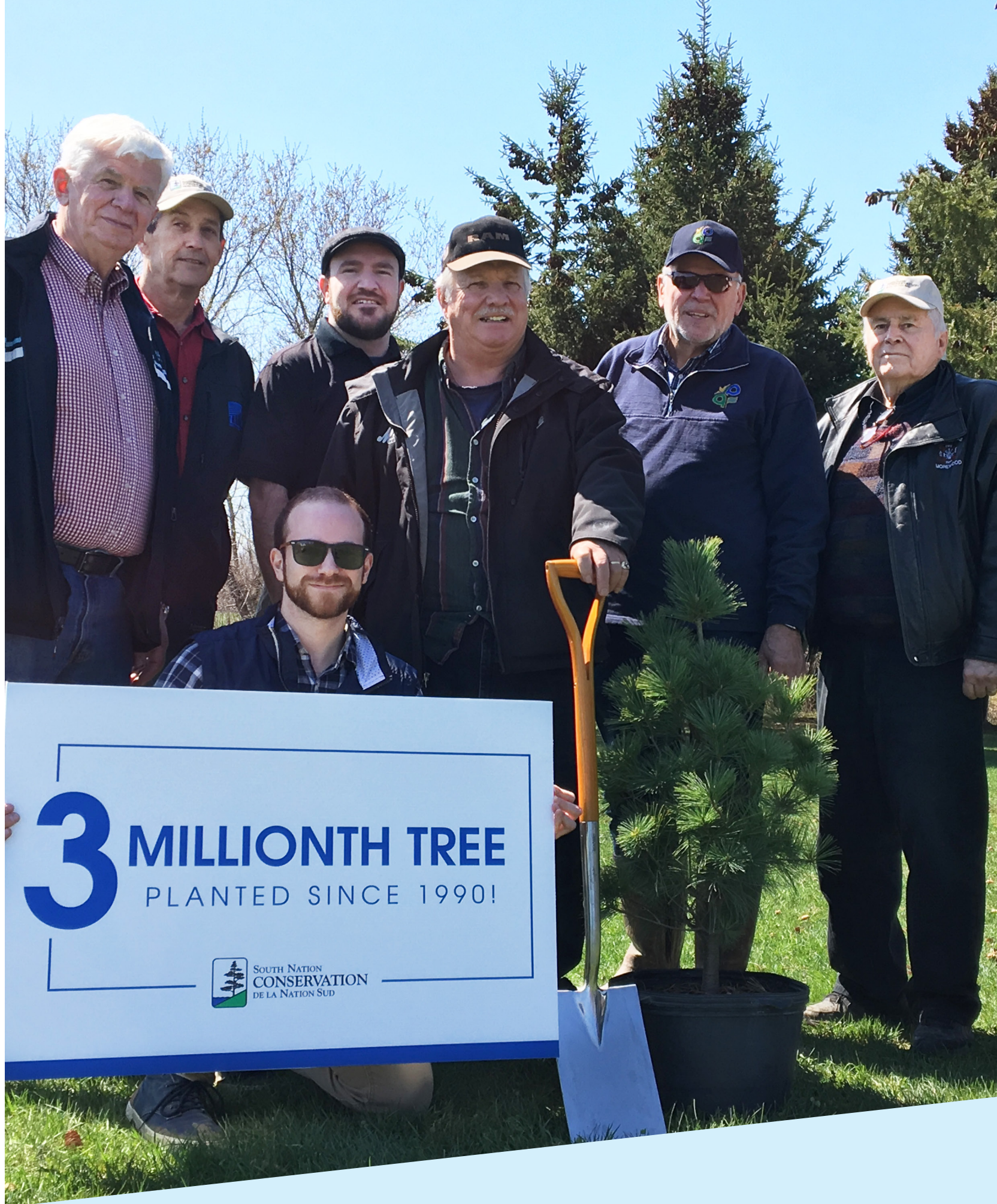
IN 2018, SNC PLANTED ITS 3 MILLIONTH TREE AT CAMP SHELDRICK IN WINCHESTER