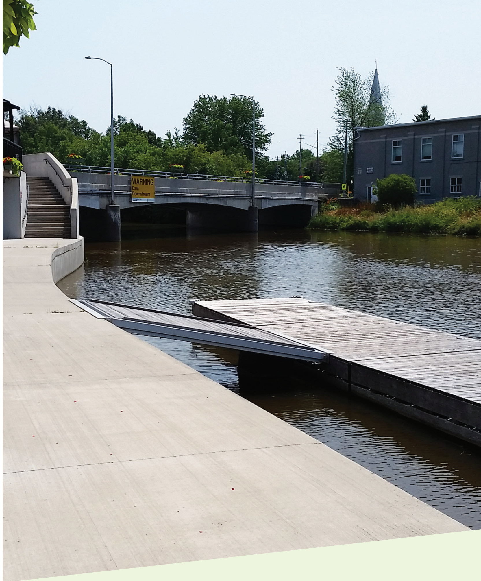
DOCKS IN CHESTERVILLE