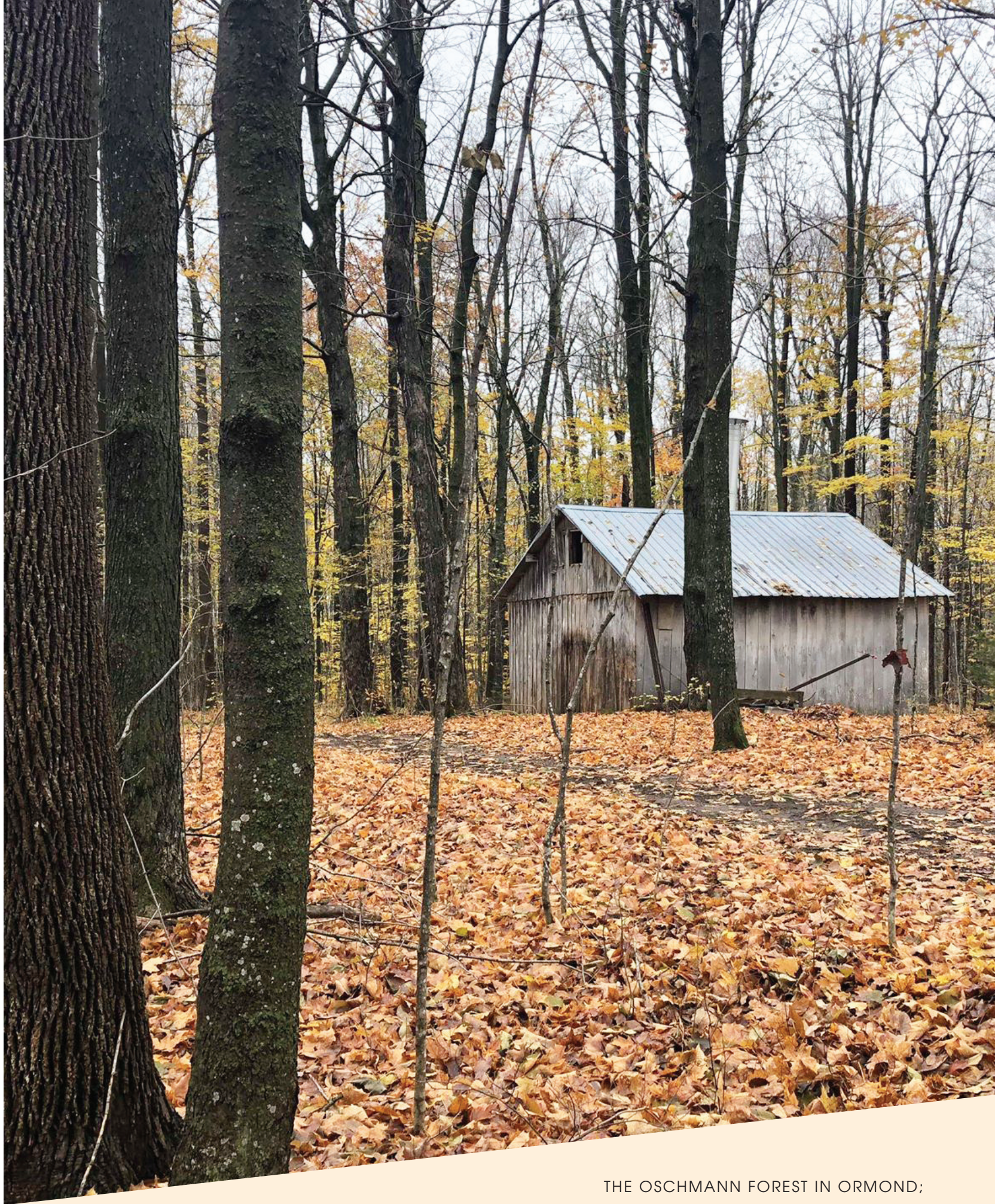
THE OSCHMANN FOREST IN ORMOND; RECENTLY ACQUIRED BY SNC THROUGH DONATION