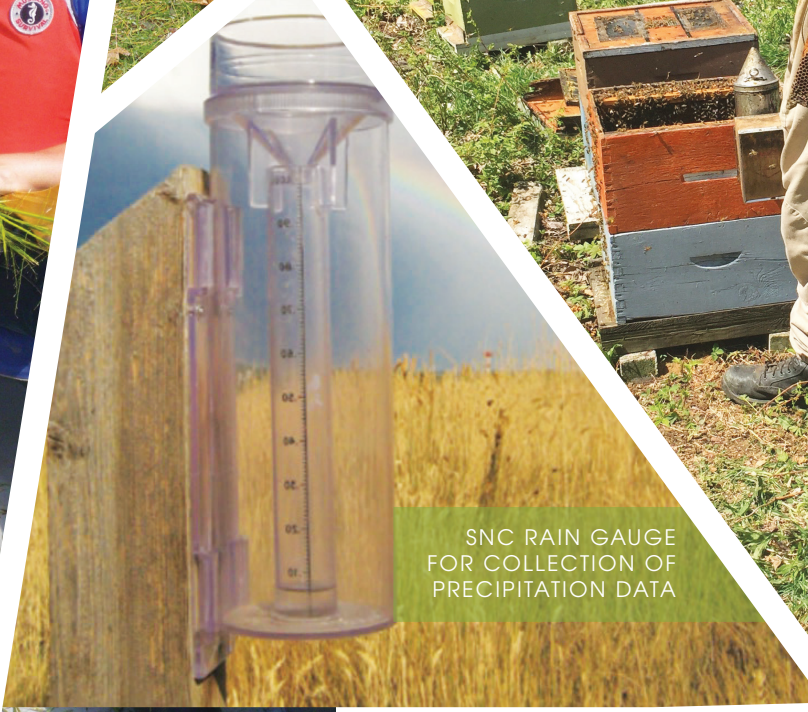
SNC RAIN GAUGE FOR COLLECTION OF PRECIPITATION DATA