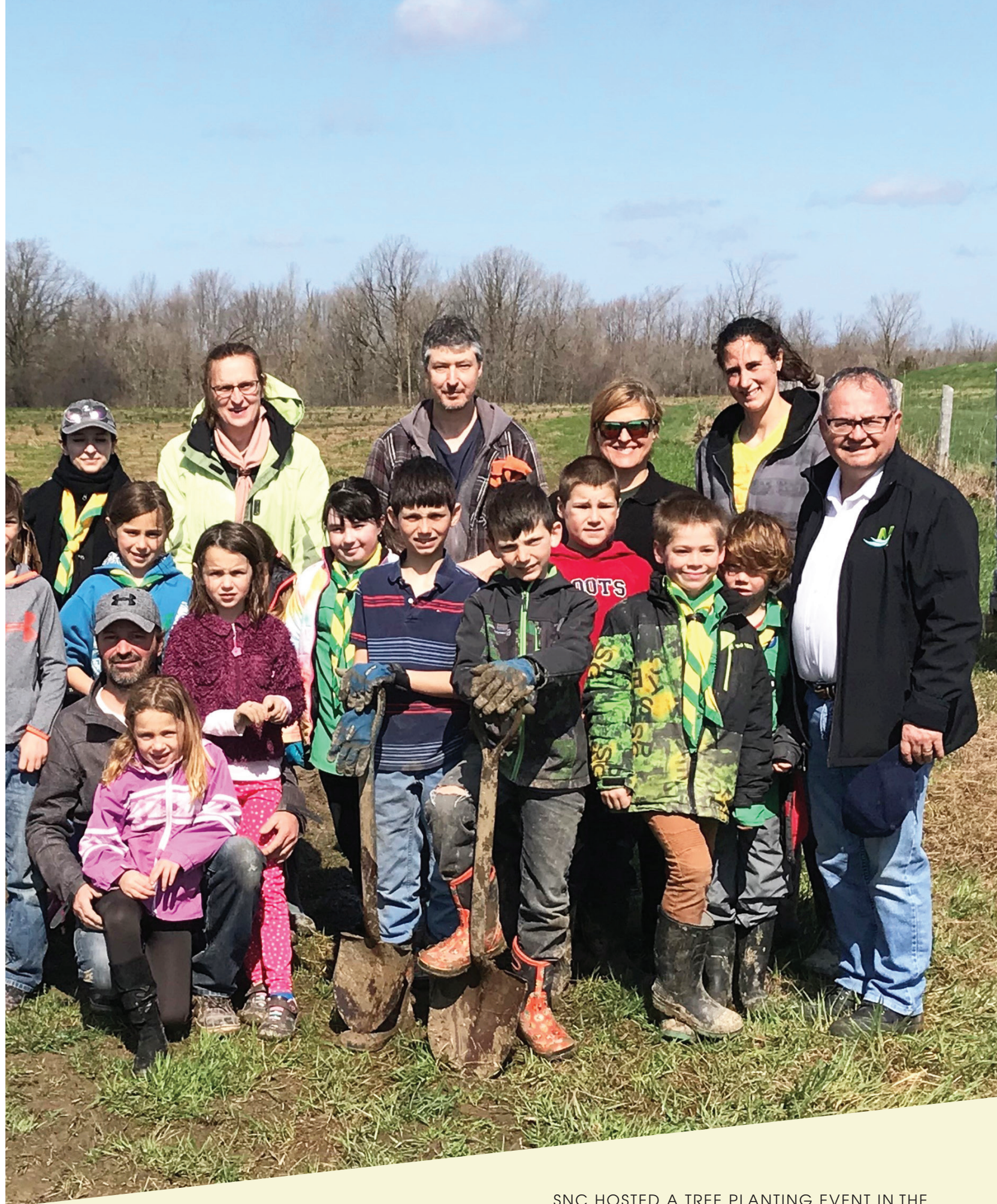
SNC HOSTED A TREE PLANTING EVENT IN THE NATION MUNICIPALITY WITH THE HELP OF LOCAL SCOUT VOLUNTEERS