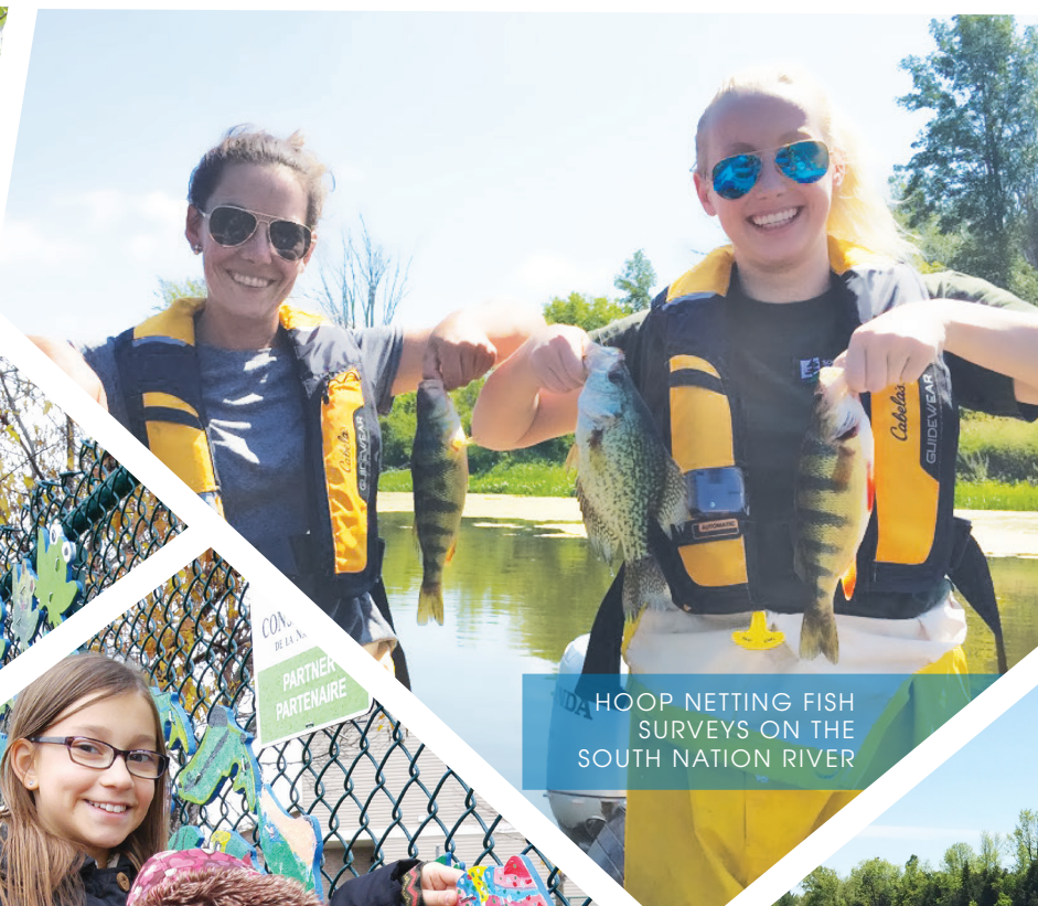
HOOP NETTING FISH SURVEYS ON THE SOUTH NATION RIVER