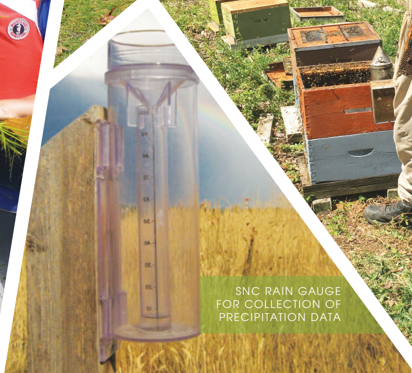
SNC RAIN GAUGE FOR COLLECTION OF PRECIPITATION DATA