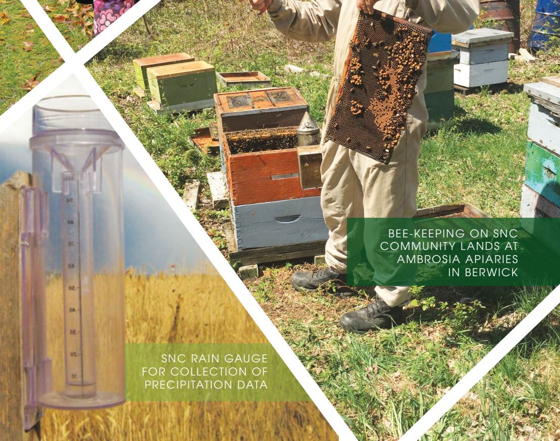
BEE-KEEPING ON SNC COMMUNITY LANDS AT AMBROSIA APIARIES IN BERWICK