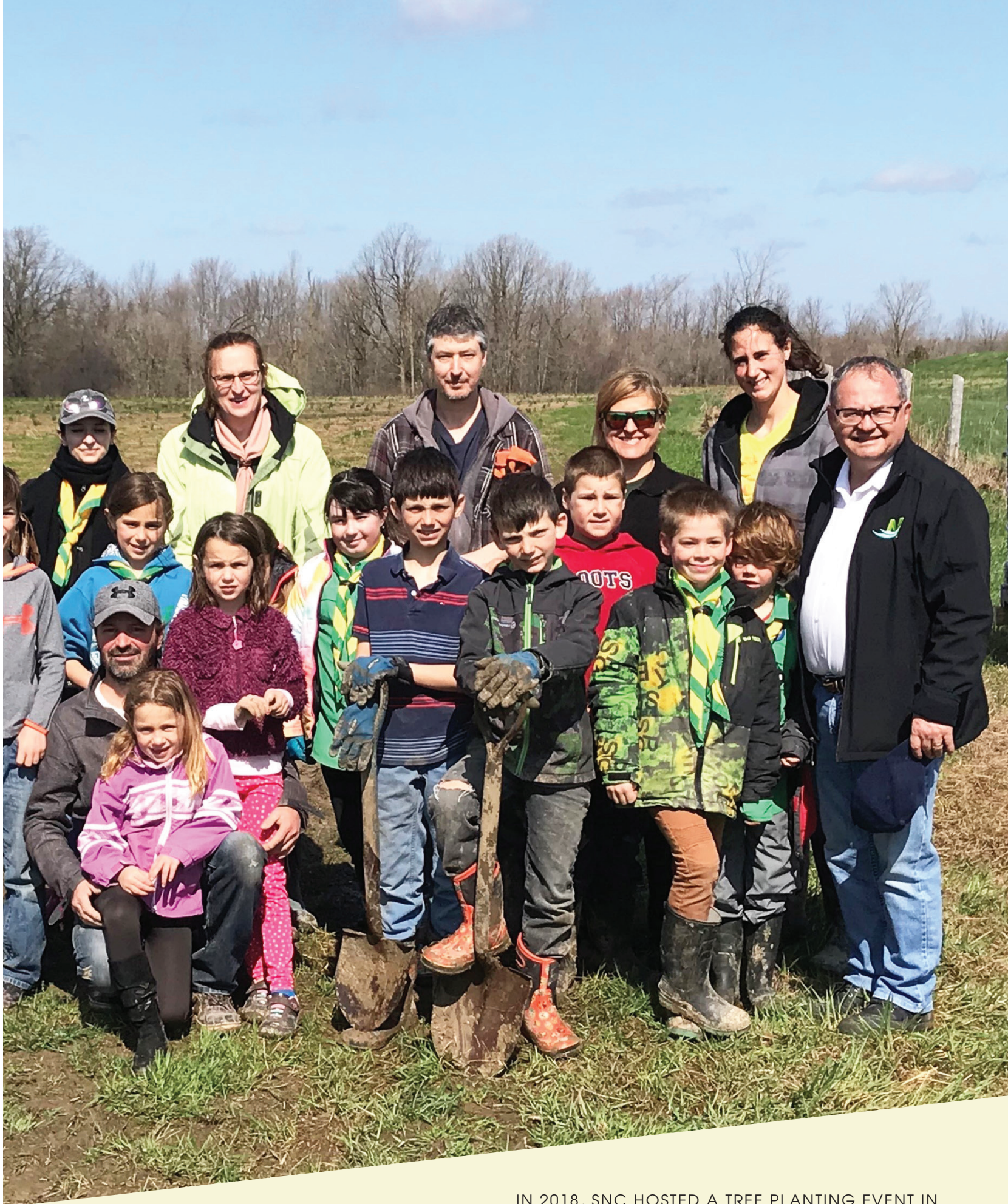
IN 2018, SNC HOSTED A TREE PLANTING EVENT IN THE NATION MUNICIPALITY WITH THE HELP OF LOCAL SCOUT VOLUNTEERS