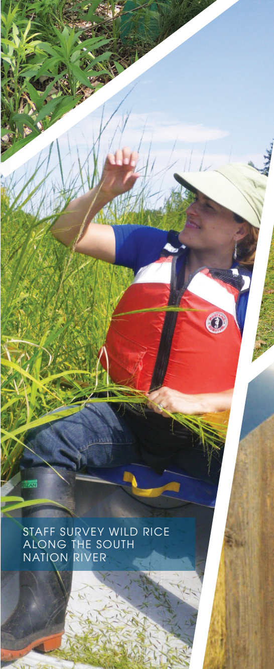
STAFF SURVEY WILD RICE ALONG THE SOUTH NATION RIVER