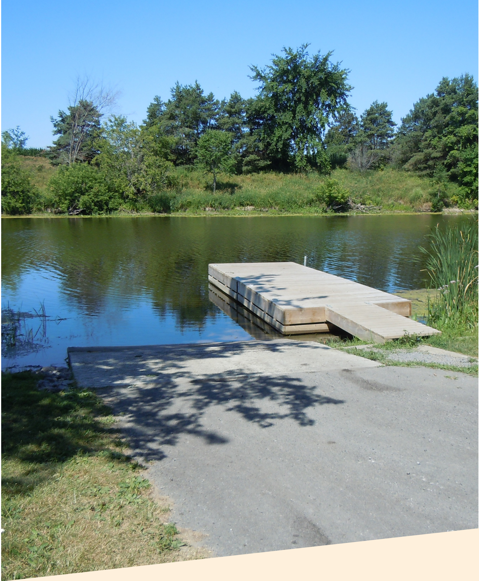
ST. ALBERT CONSERVATION AREA