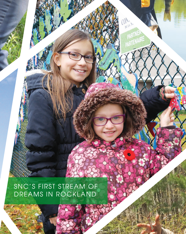
SNC'S FIRST STREAM OF DREAMS IN ROCKLAND