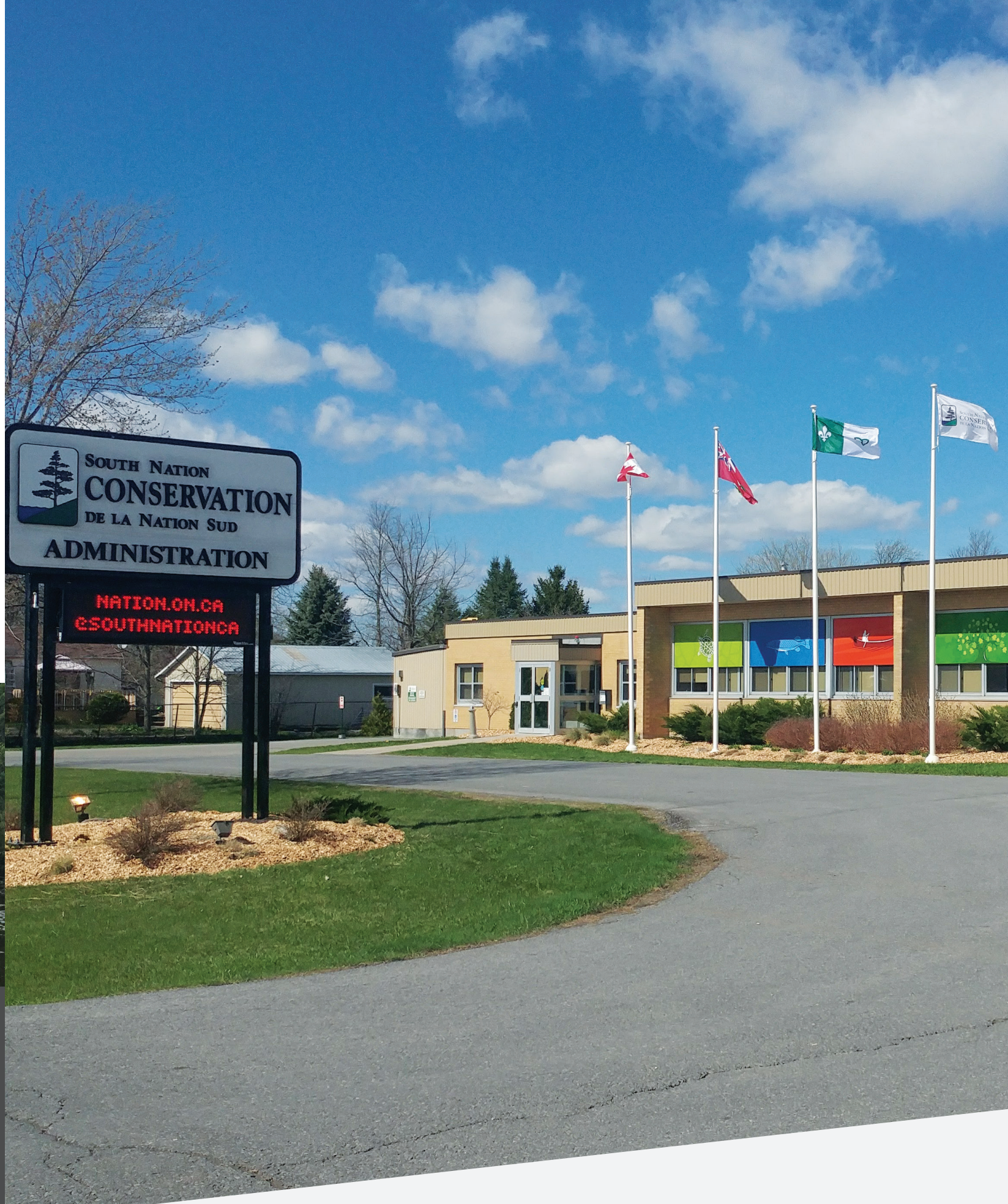
SOUTH NATION CONSERVATION ADMINISTRATION BUILDING, FINCH