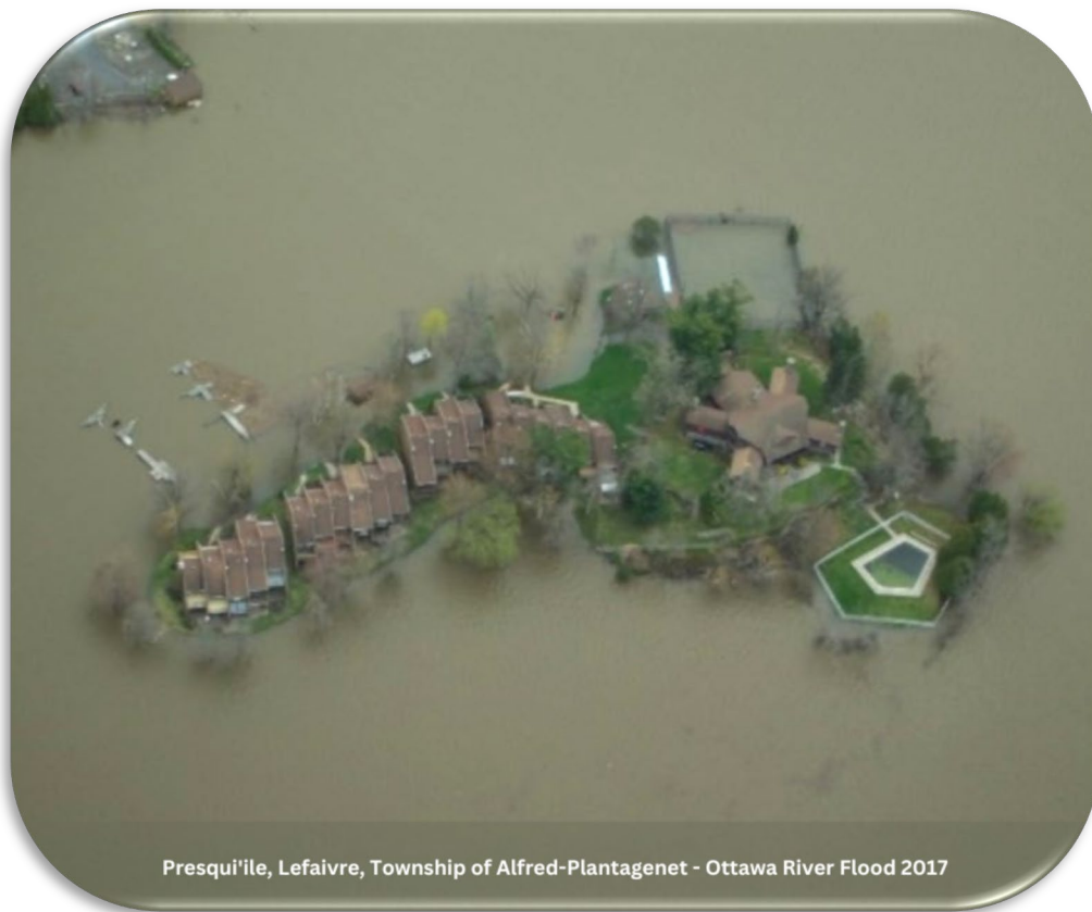
Presqui'île, Lefavre, Township of Alfred-Plantagenet - Ottawa River Flood 2017