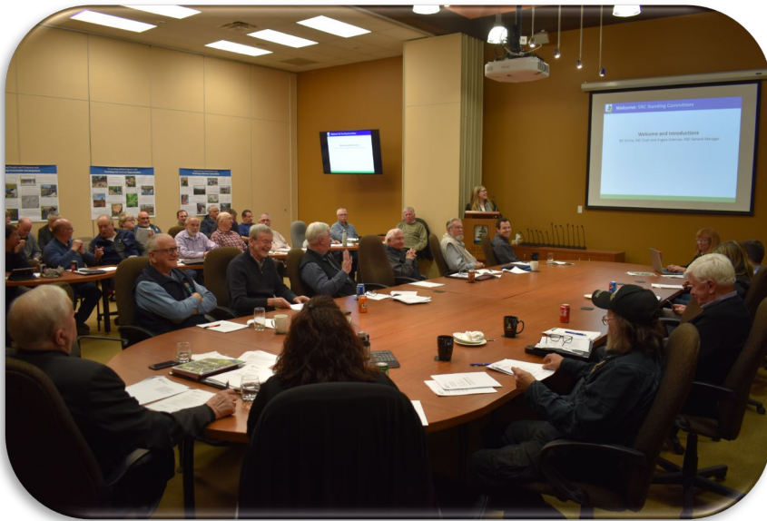
2020 Joint Committee Meeting