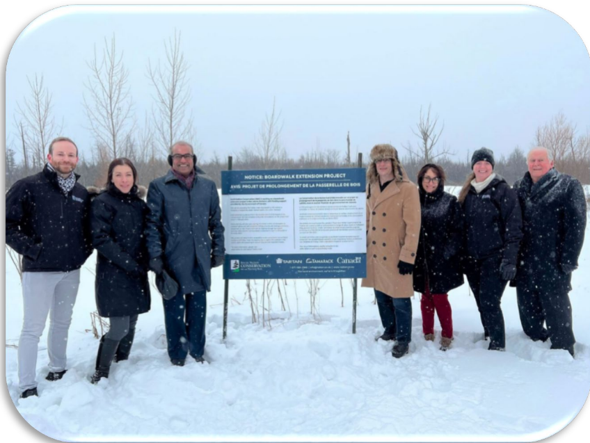
Findlay Creek Media Announcement, January 25th, 2023