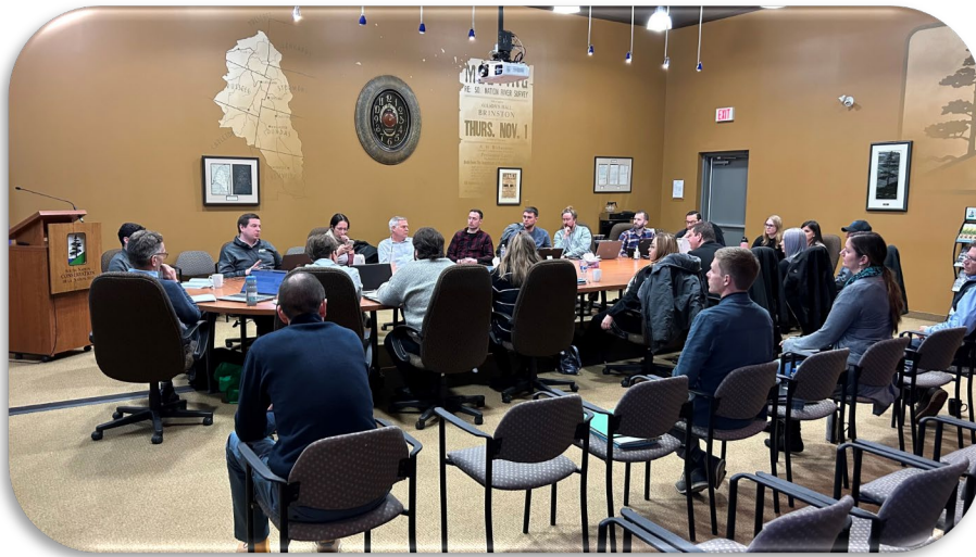
Staff from SDG including planners and Chief Building Officials