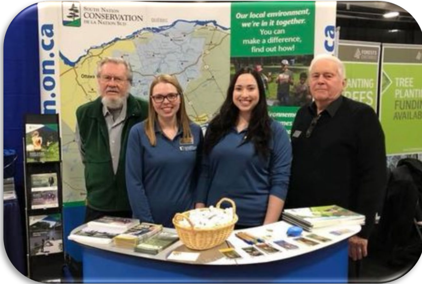
Ottawa Valley Farm Show, 2018