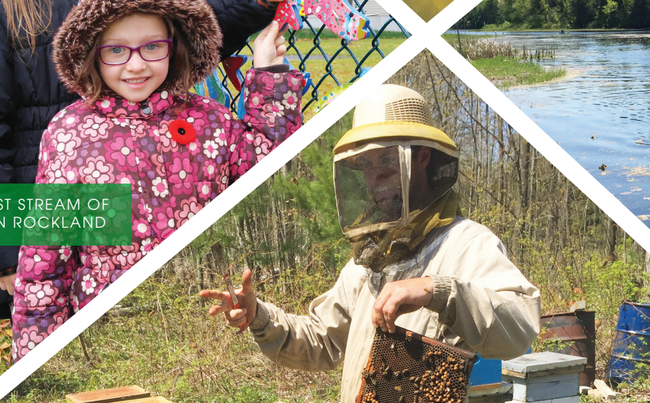
BEE-KEEPING ON SNC COMMUNITY LANDS AT AMBROSIA APIARIES IN BERWICK