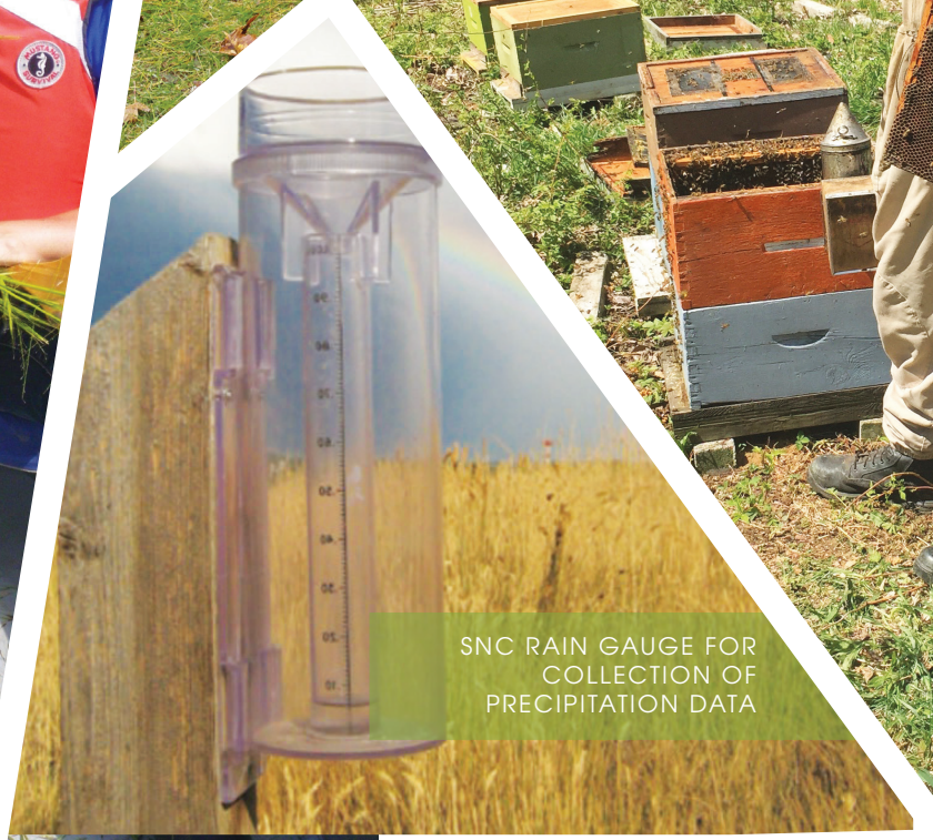
SNC RAIN GAUGE FOR COLLECTION OF PRECIPITATION DATA