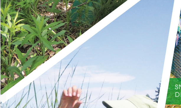
STAFF SURVEY WILD RICE ALONG THE SOUTH NATION RIVER