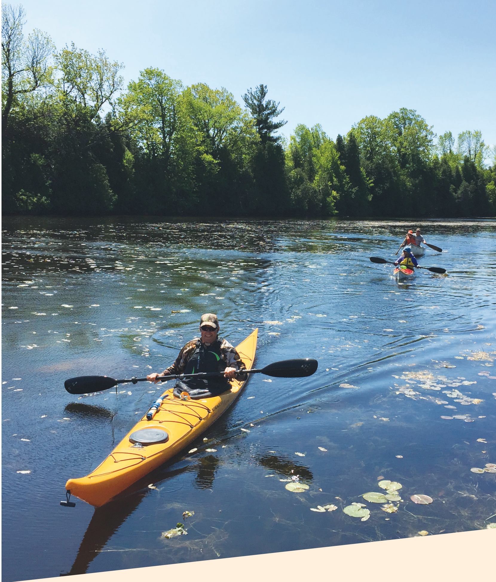
KAYAKERS ENJOY THE SOUTH NATION RIVER AT THE SPENCERVILLE MILL