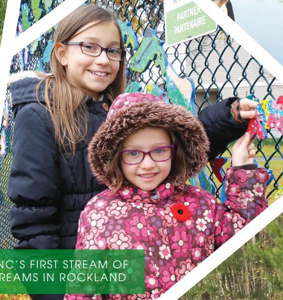
SNC'S FIRST STREAM OF DREAMS IN ROCKLAND