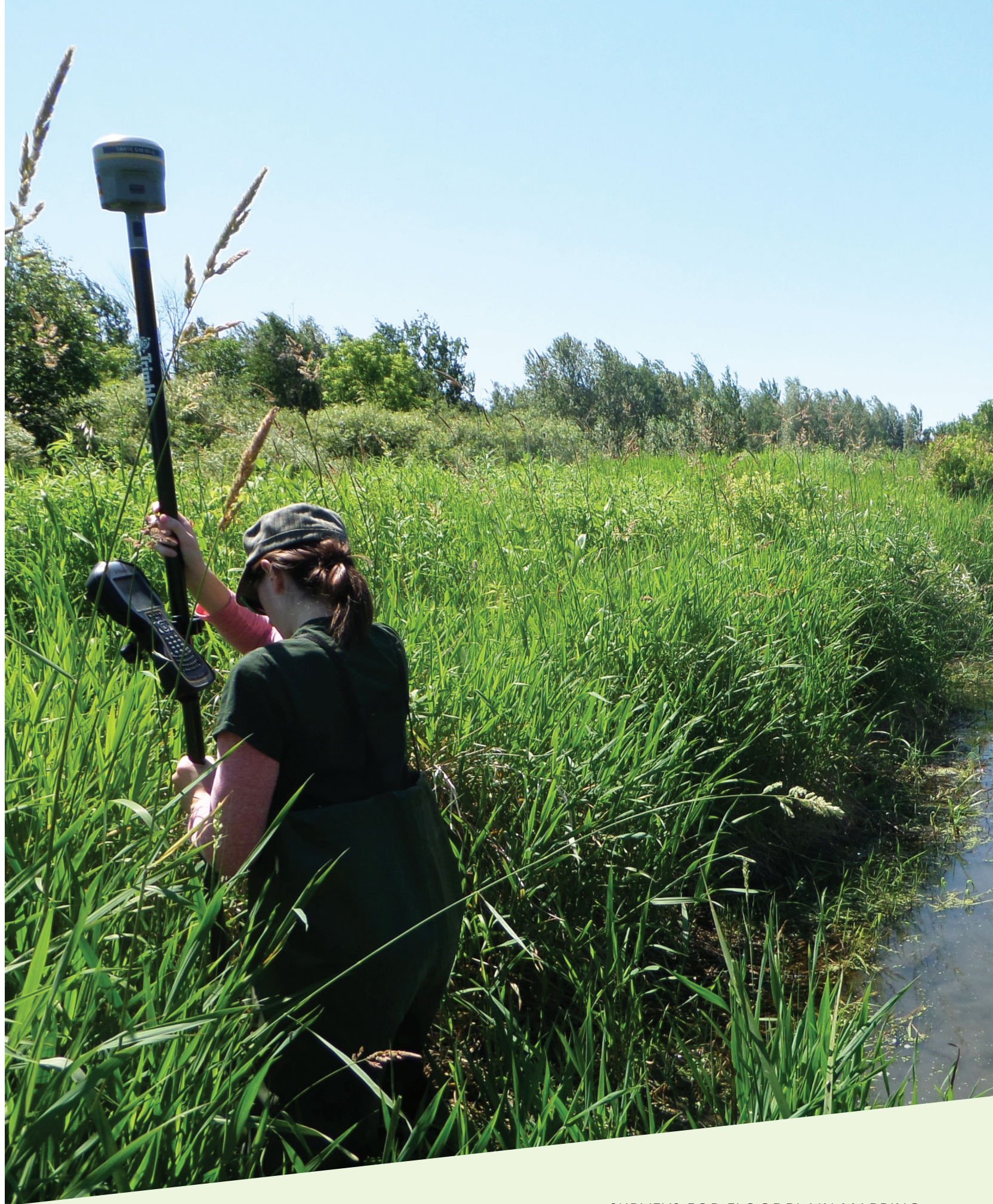
SURVEYS FOR FLOODPLAIN MAPPING