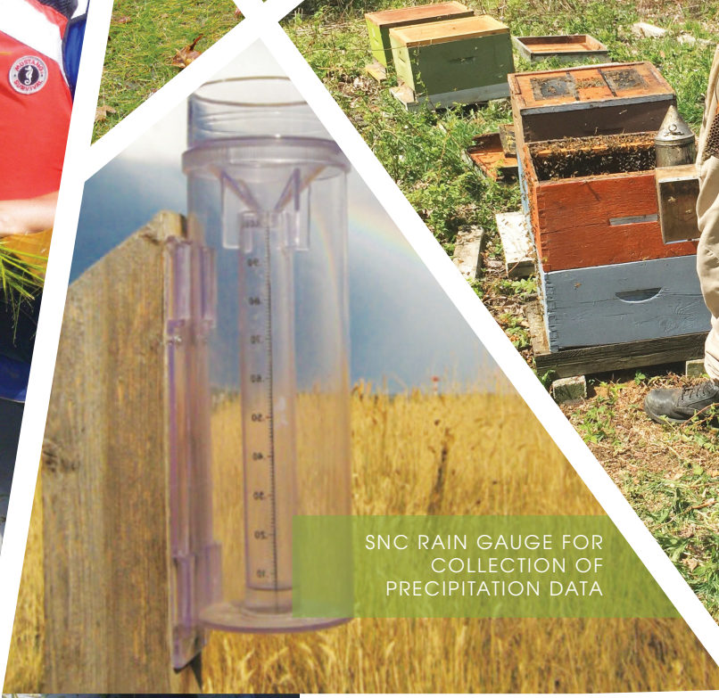
SNC RAIN GAUGE FOR COLLECTION OF PRECIPITATION DATA