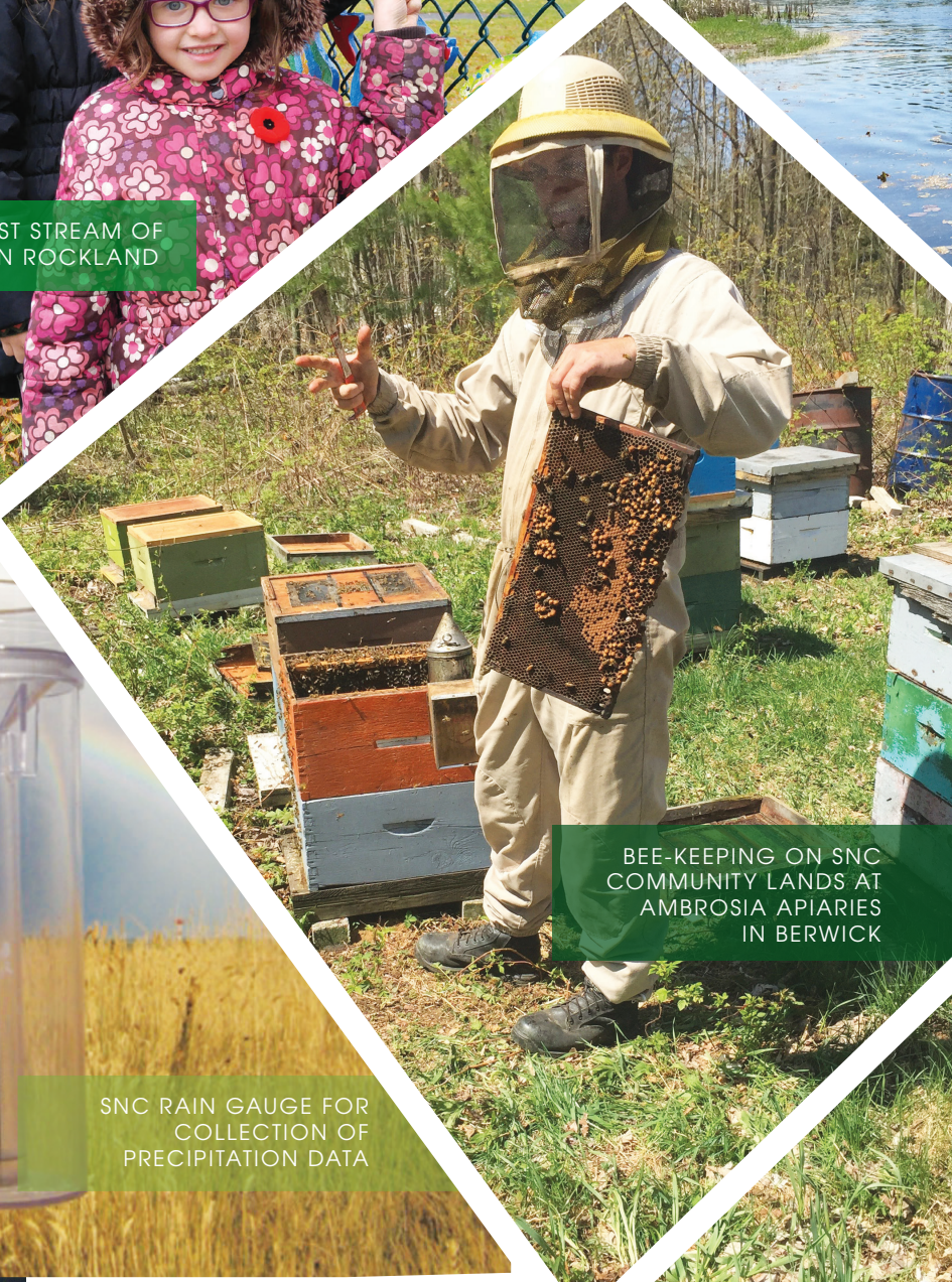
BEE-KEEPING ON SNC COMMUNITY LANDS AT AMBROSIA APIARIES IN BERWICK