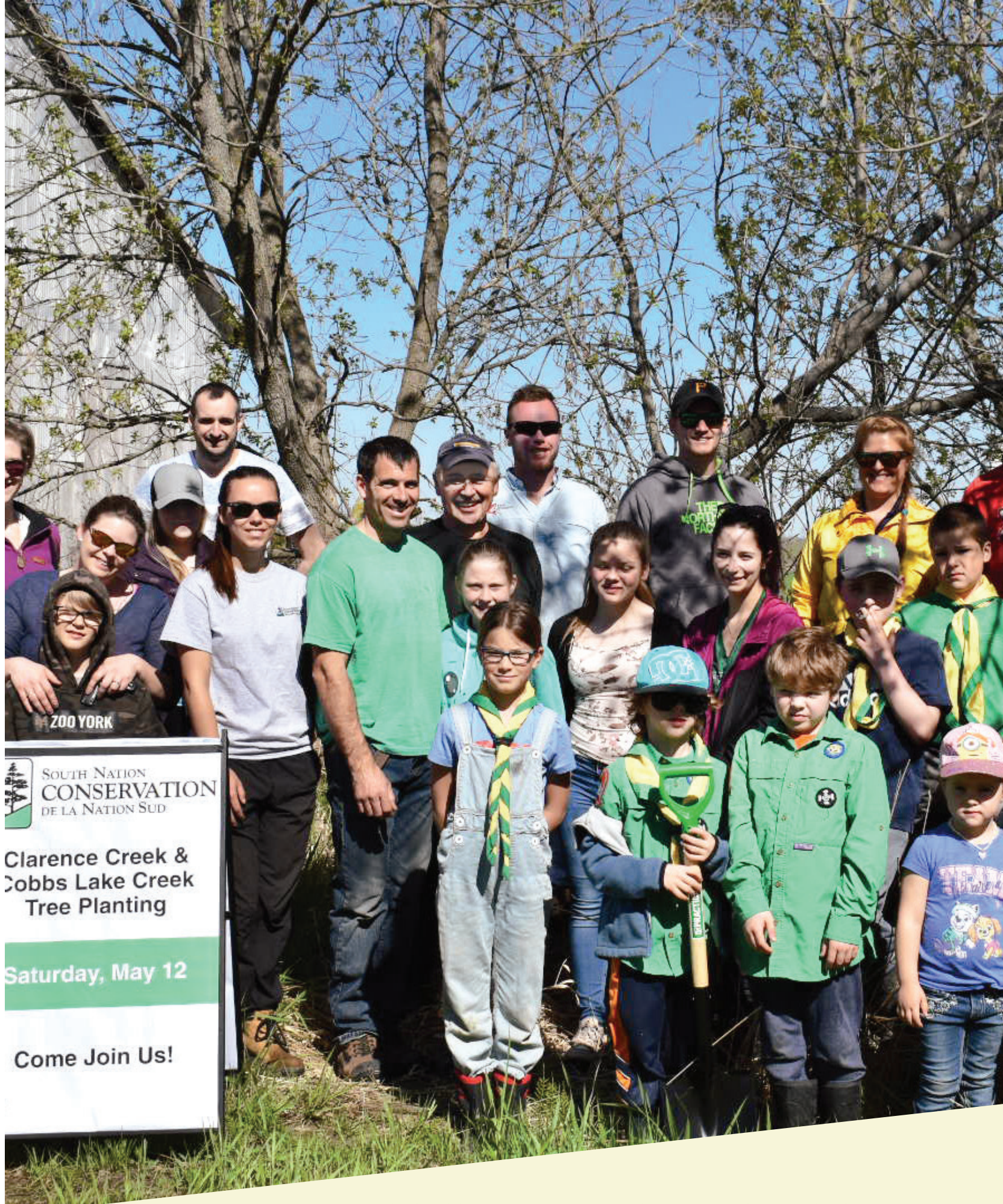
SNC HOSTED A TREE PLANTING EVENT AT CLARENCE CREEK AND COBB'S LAKE WITH THE HELP OF LOCAL SCOUT VOLUNTEERS