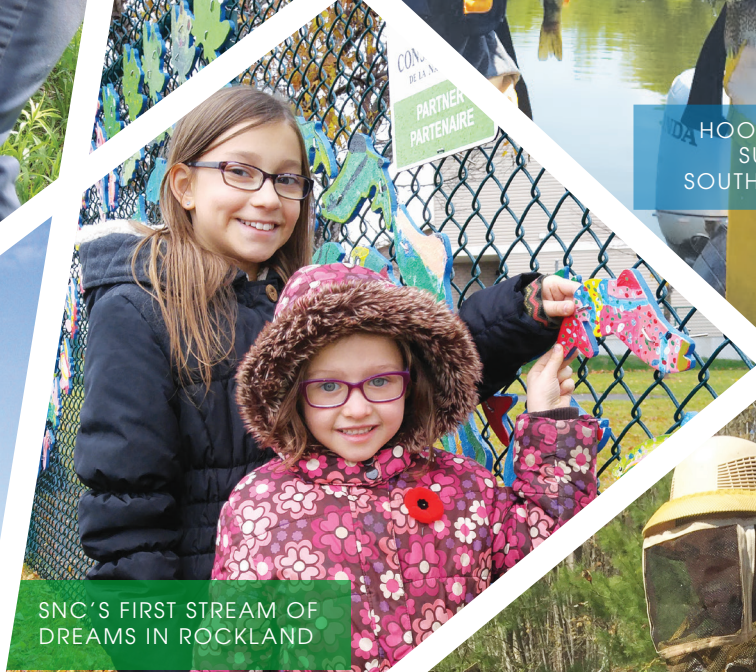
SNC'S FIRST STREAM OF DREAMS IN ROCKLAND