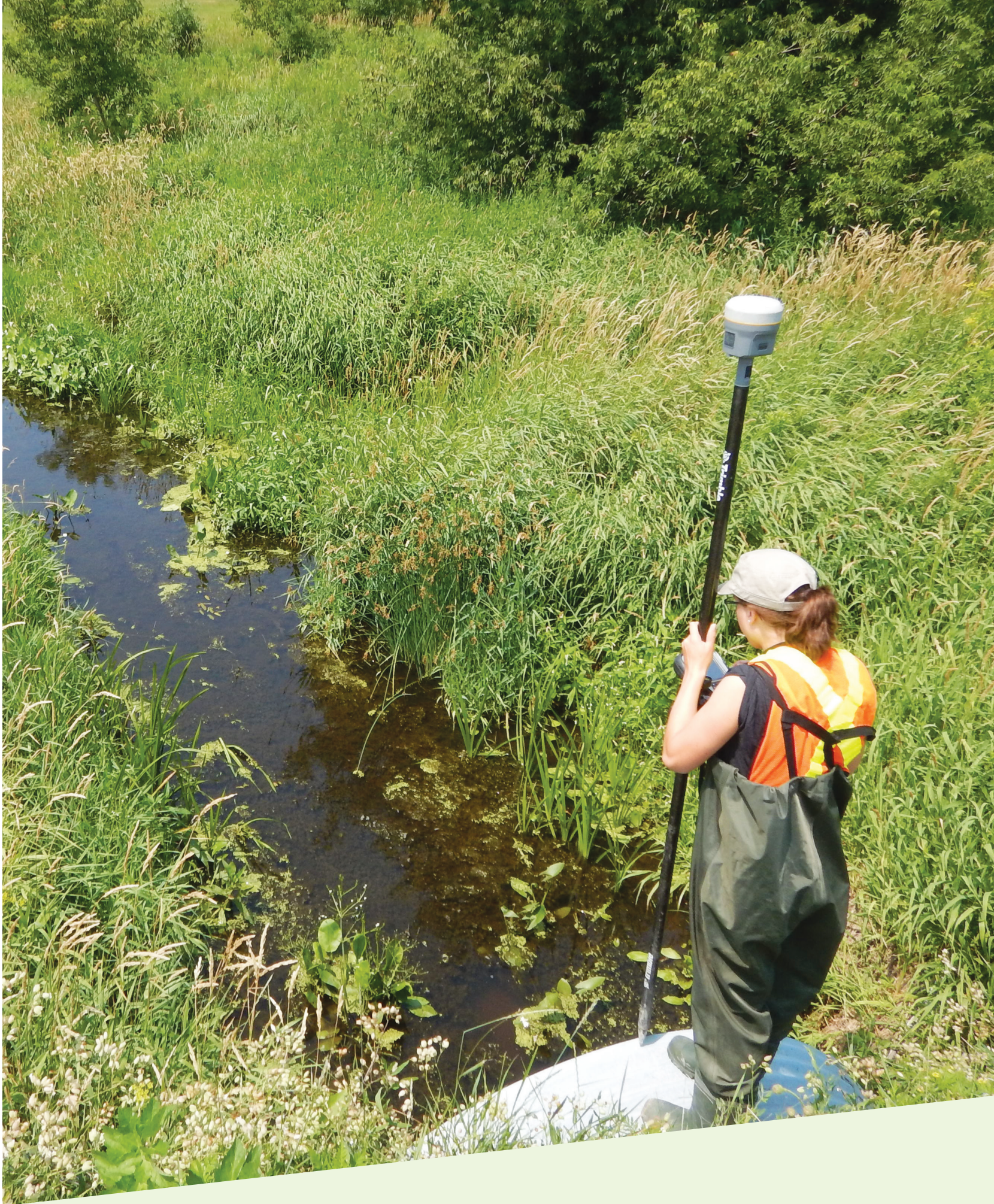
SURVEYS FOR FLOODPLAIN MAPPING