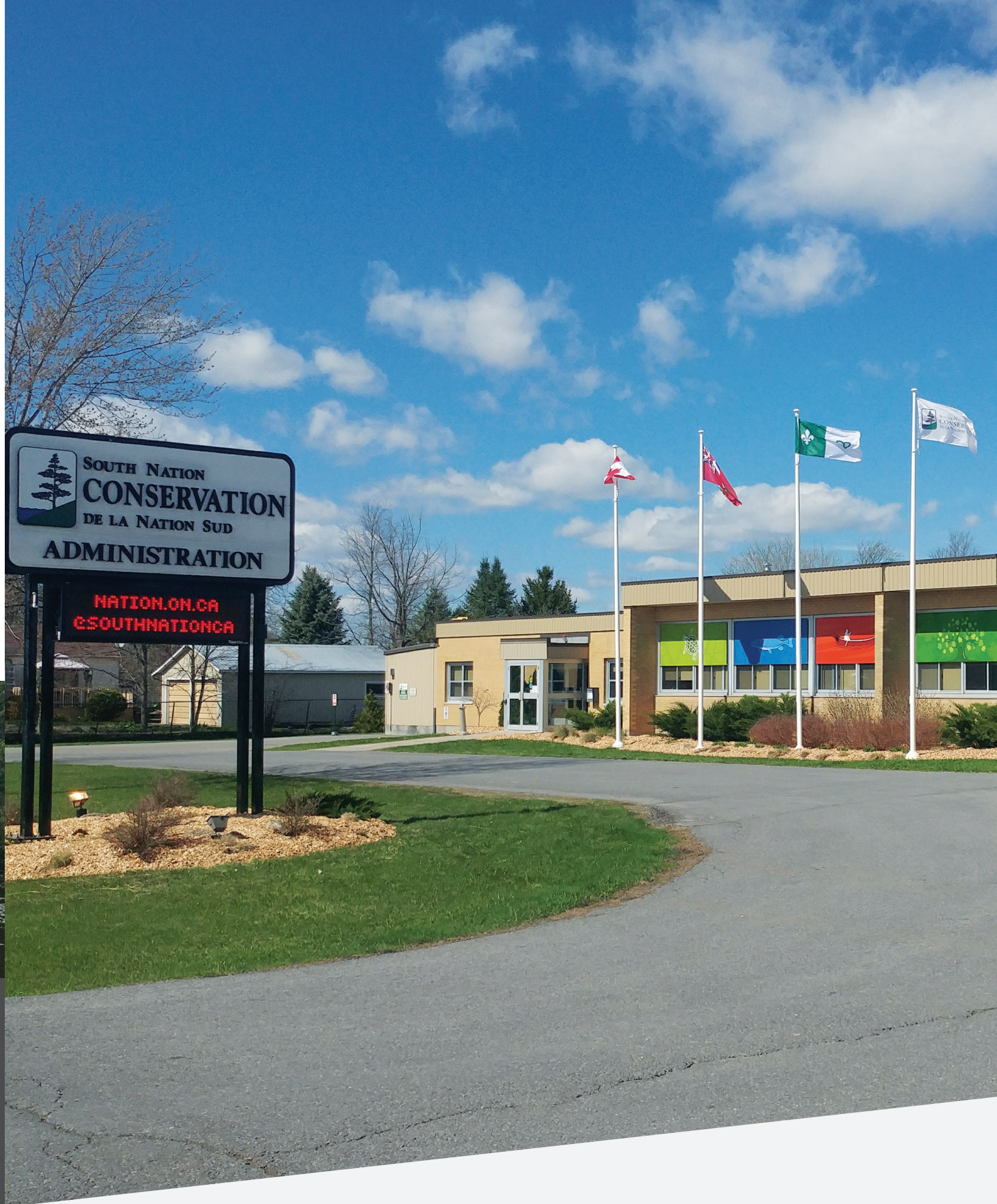
SOUTH NATION CONSERVATION ADMINISTRATION BUILDING, FINCH