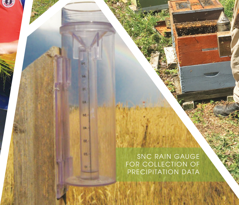
SNC RAIN GAUGE FOR COLLECTION OF PRECIPITATION DATA