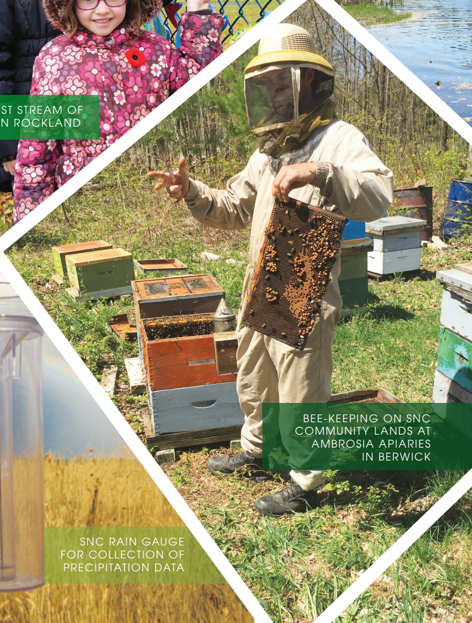
BEE-KEEPING ON SNC COMMUNITY LANDS AT AMBROSIA APIARIES IN BERWICK