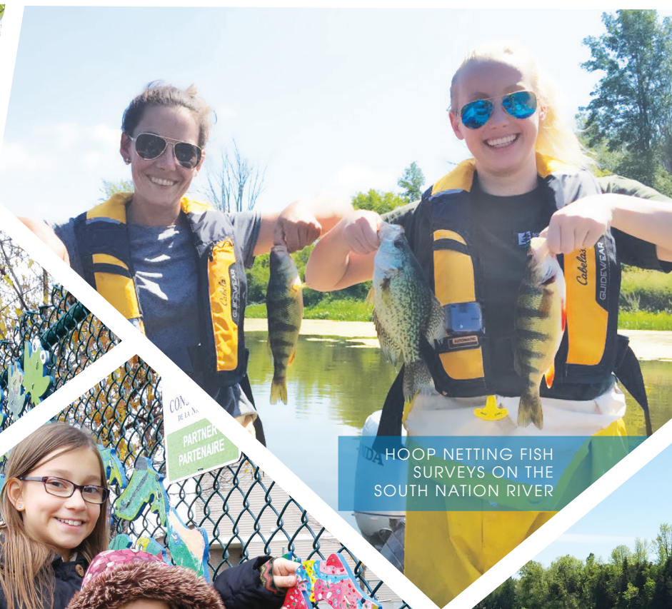
HOOP NETTING FISH SURVEYS ON THE SOUTH NATION RIVER