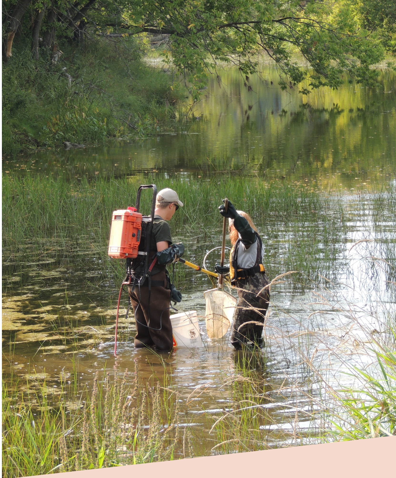
ELECTROFISHING ON THE SOUTH NATION RIVER