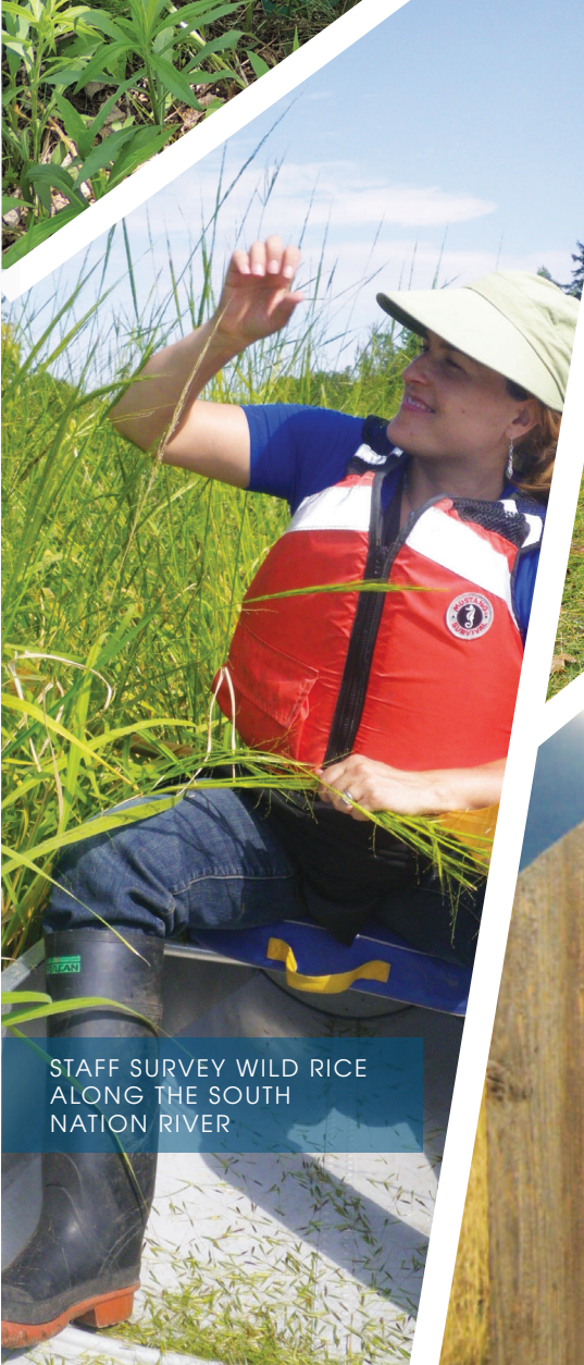
STAFF SURVEY WILD RICE ALONG THE SOUTH NATION RIVER