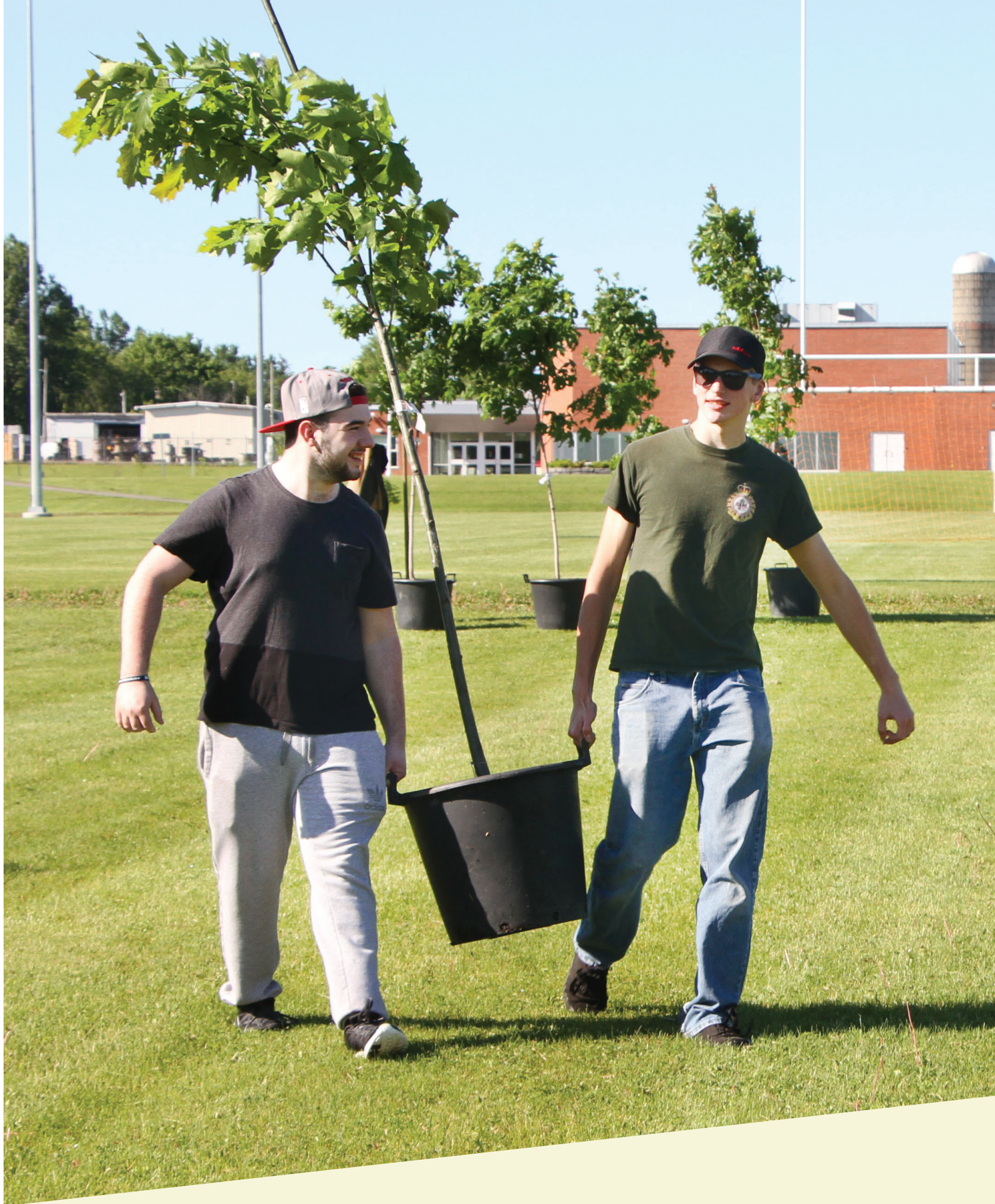
SNC HOSTED A TREE PLANTING EVENT AT THE VANKLEEK HILL COLLEGIATE INSTITUTE