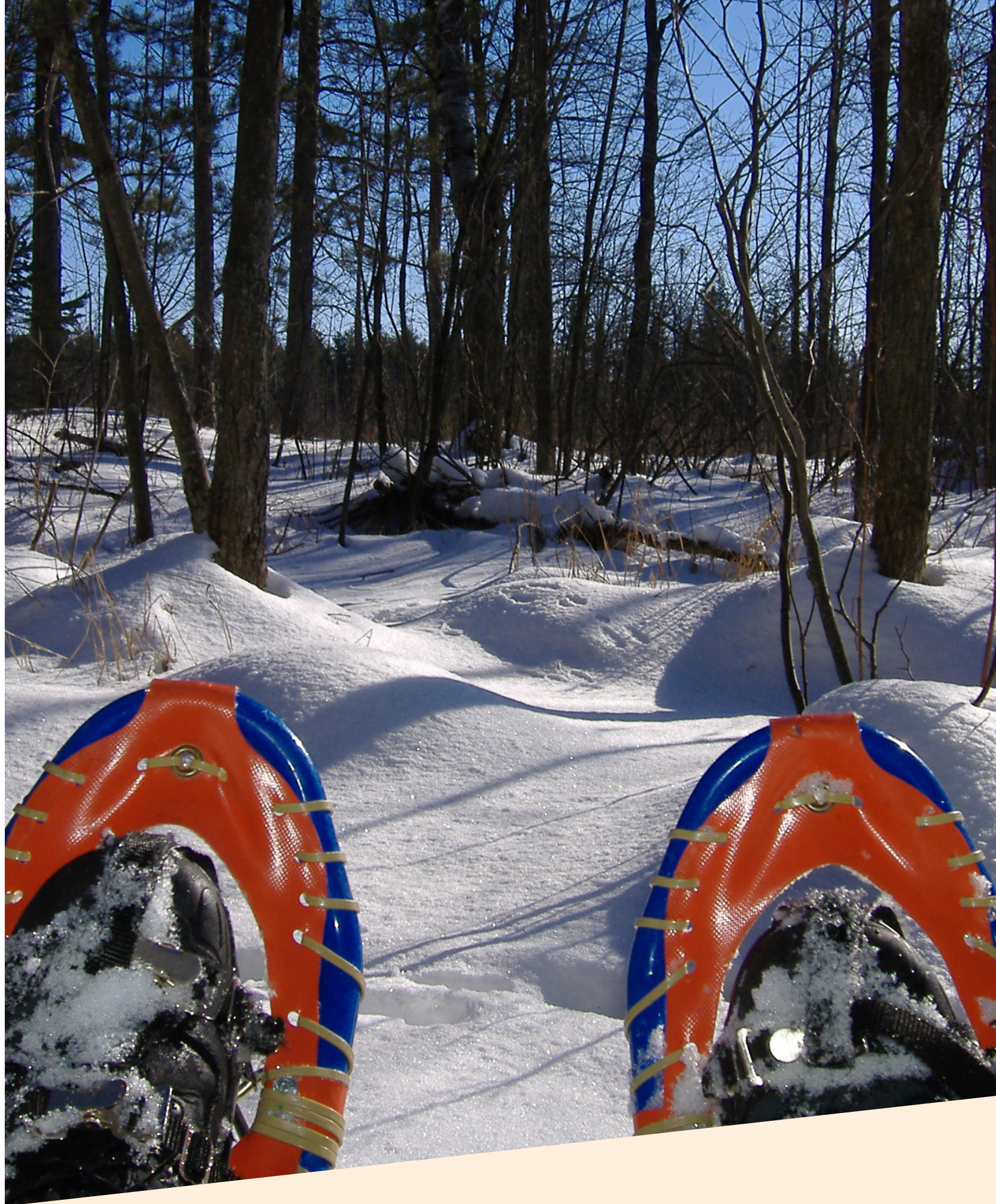
SNOWSHOEING IS A POPULAR PASTIME AT MANY OF SNC'S CONSERVATION AREAS