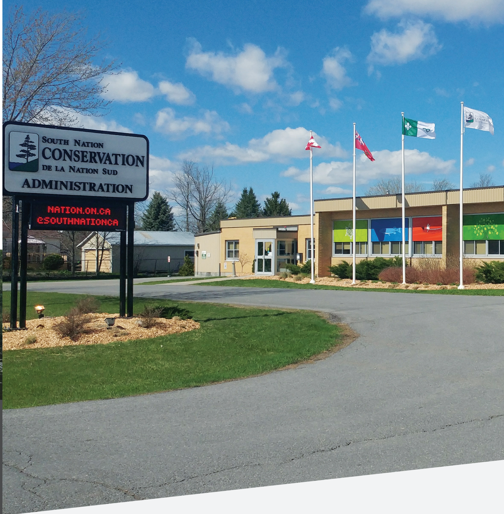
SOUTH NATION CONSERVATION ADMINISTRATION BUILDING, FINCH