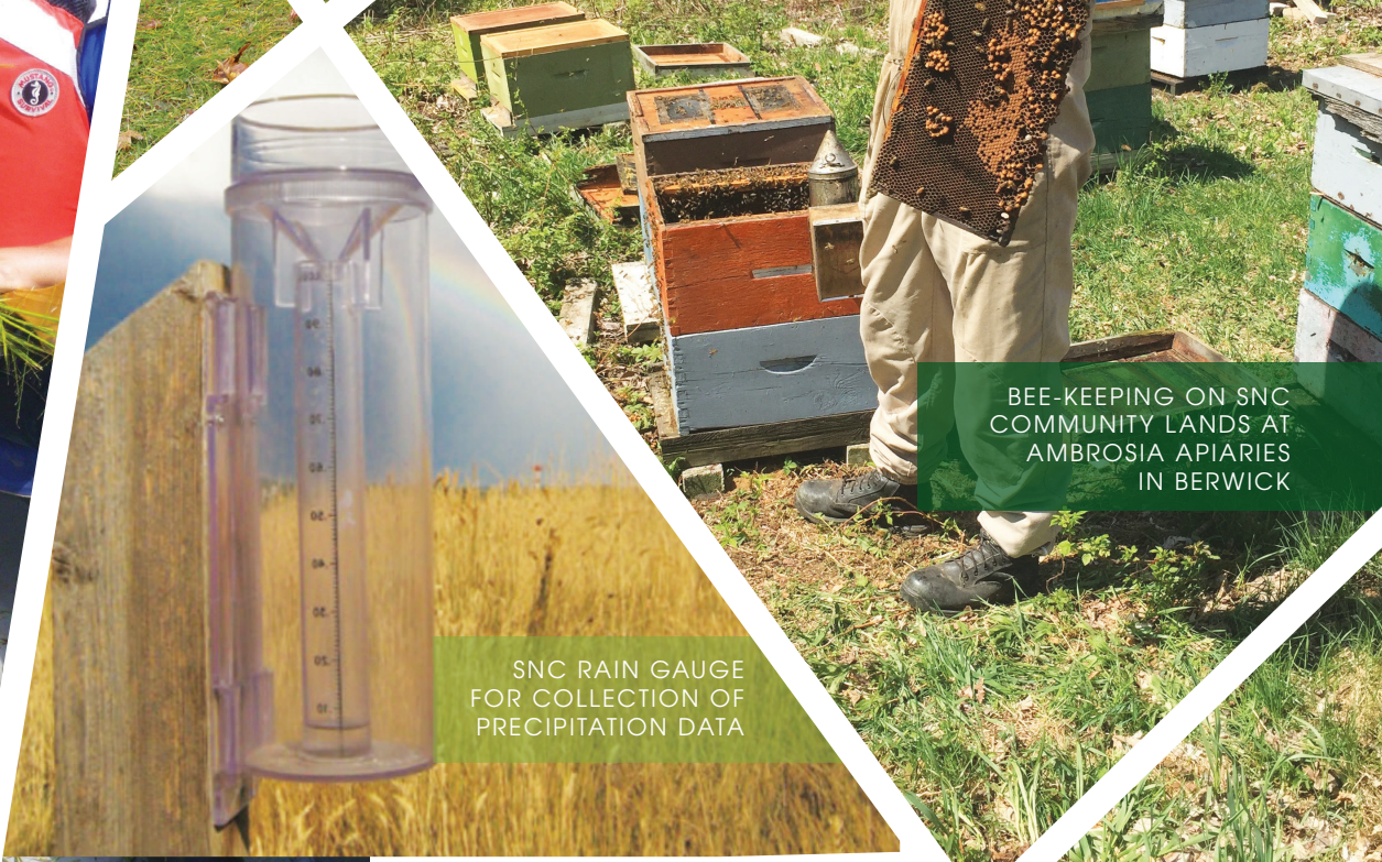
BEE-KEEPING ON SNC COMMUNITY LANDS AT AMBROSIA APIARIES IN BERWICK