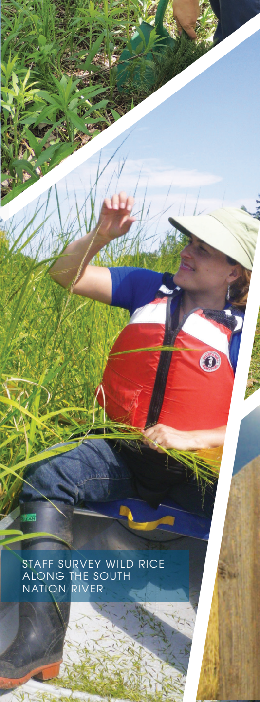
STAFF SURVEY WILD RICE ALONG THE SOUTH NATION RIVER