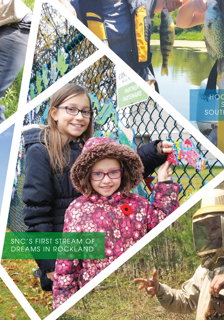
SNC'S FIRST STREAM OF DREAMS IN ROCKLAND