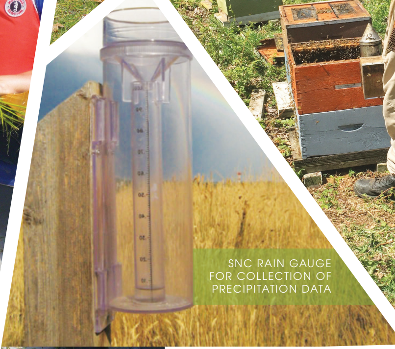
SNC RAIN GAUGE FOR COLLECTION OF PRECIPITATION DATA