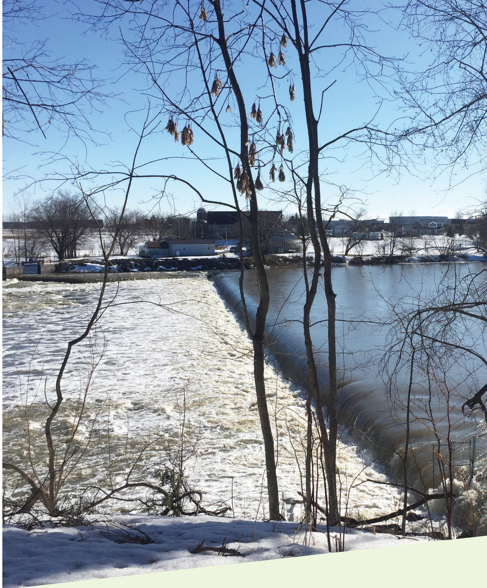
THE CASSELMAN WEIR