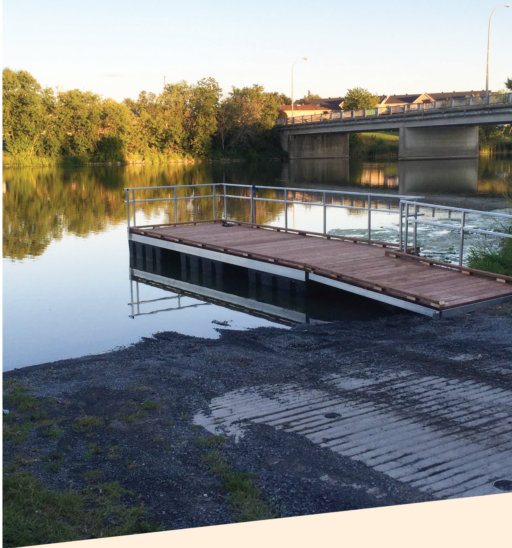
THE ACCESSIBLE DOCK AT HIGH FALLS CONSERVATION AREA