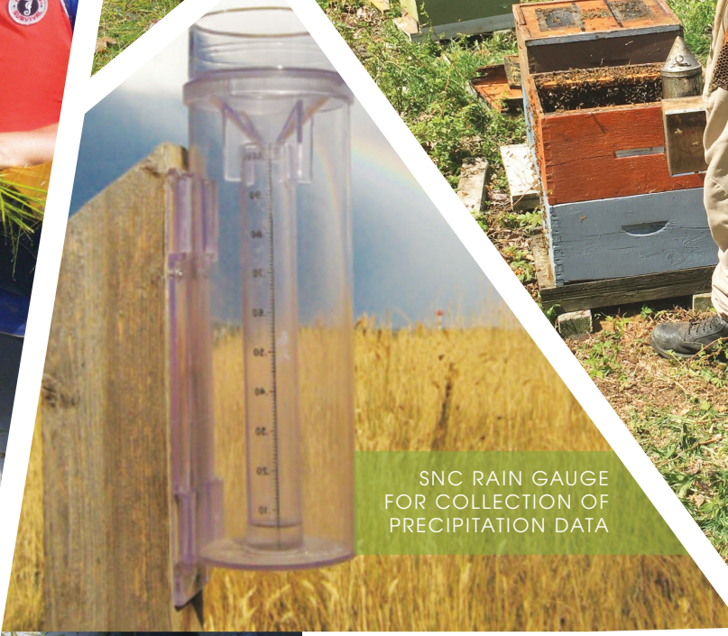
SNC RAIN GAUGE FOR COLLECTION OF PRECIPITATION DATA