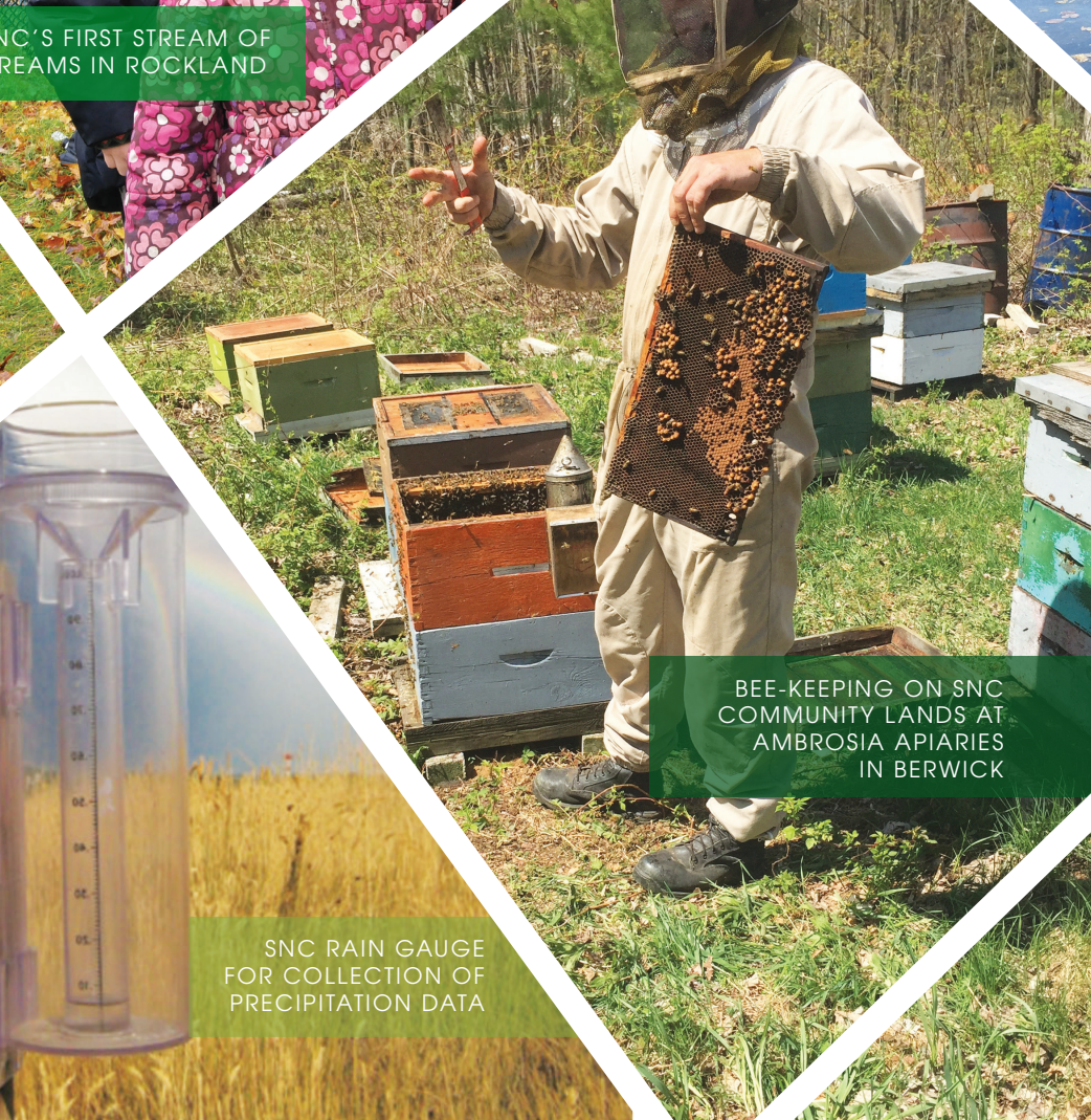
BEE-KEEPING ON SNC COMMUNITY LANDS AT AMBROSIA APIARIES IN BERWICK