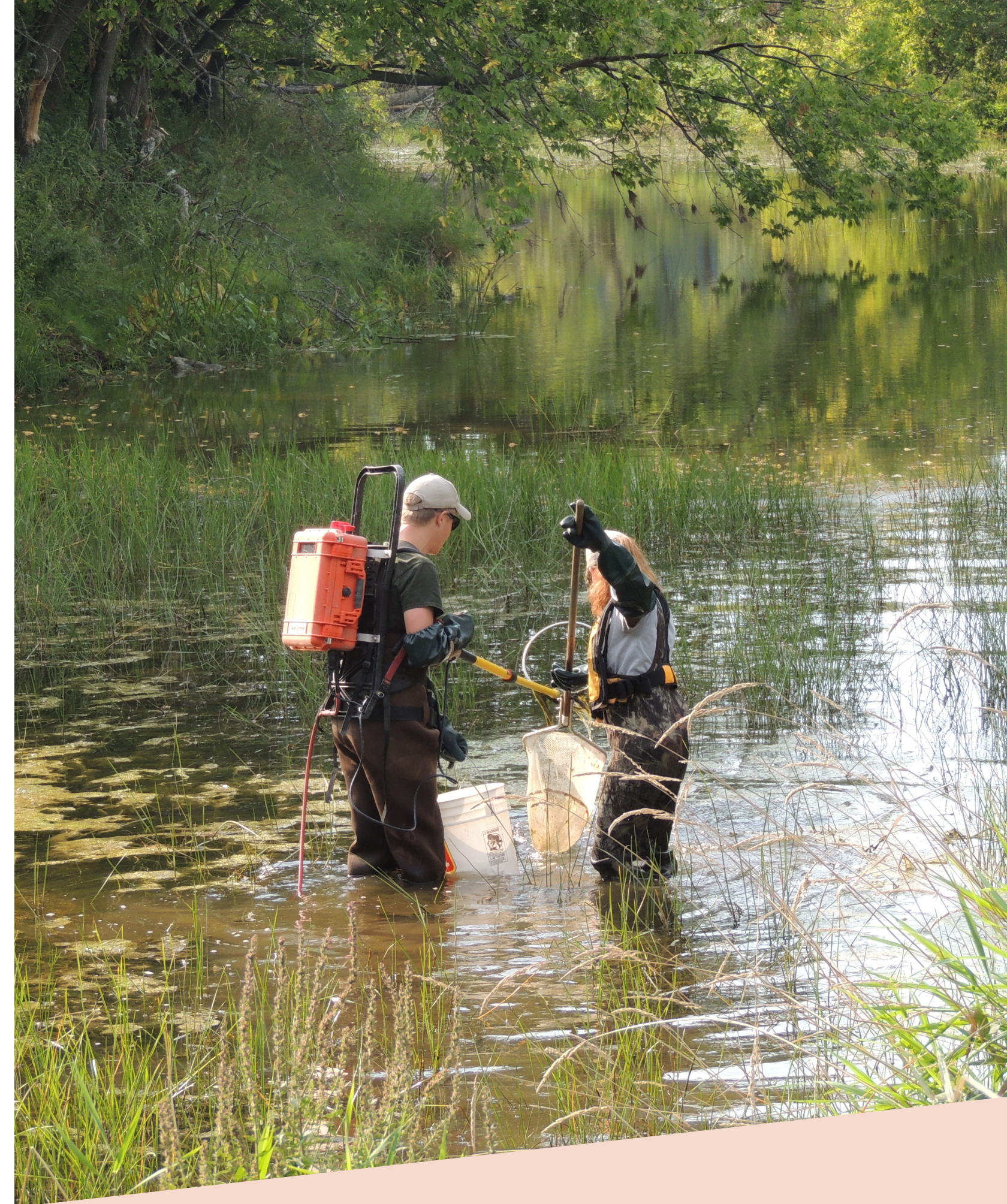
ELECTROFISHING ON THE SOUTH NATION RIVER