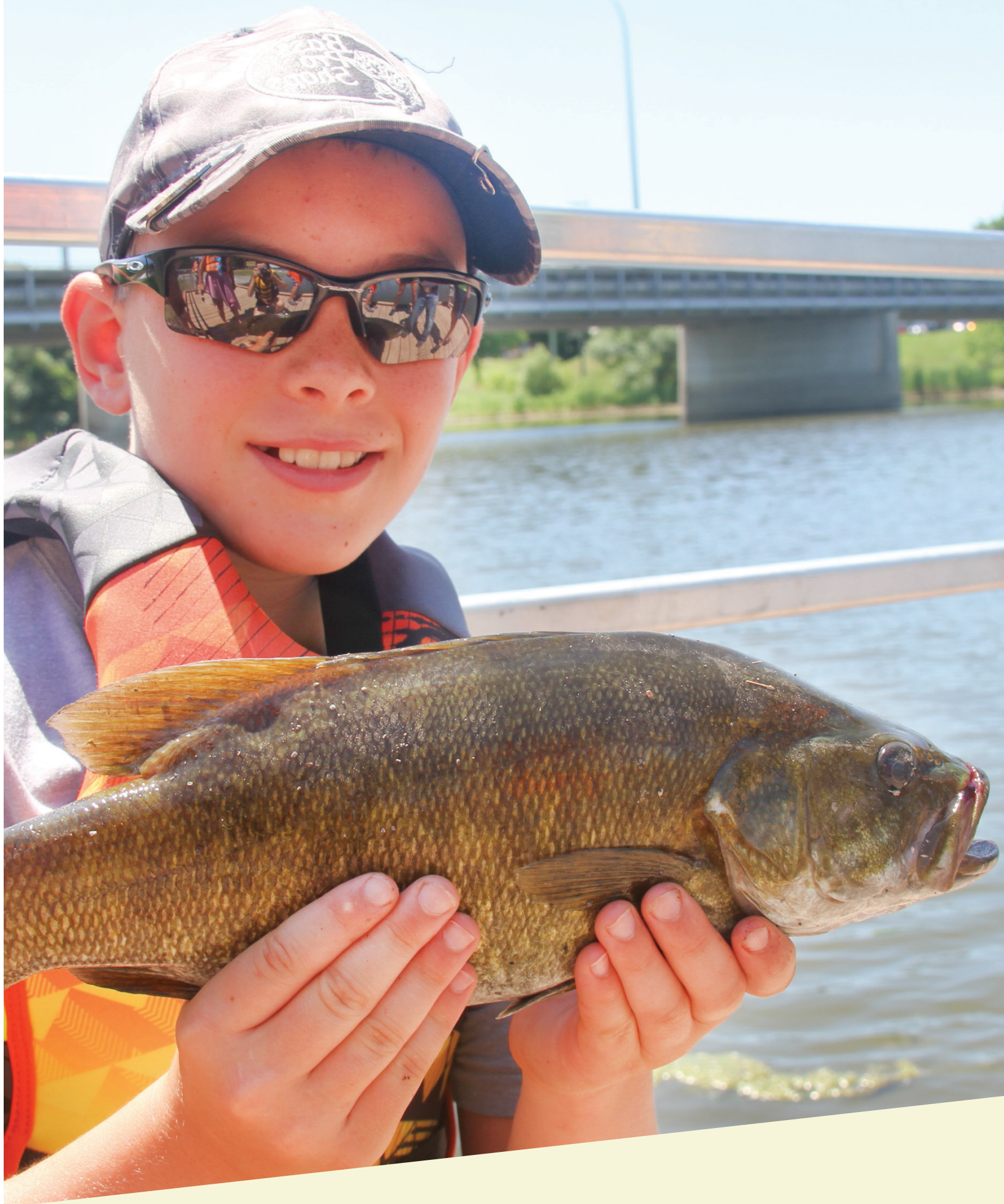
IN 2018, SNC HOSTED A YOUTH FISHING CAMP AT HIGH FALLS CONSERVATION AREA