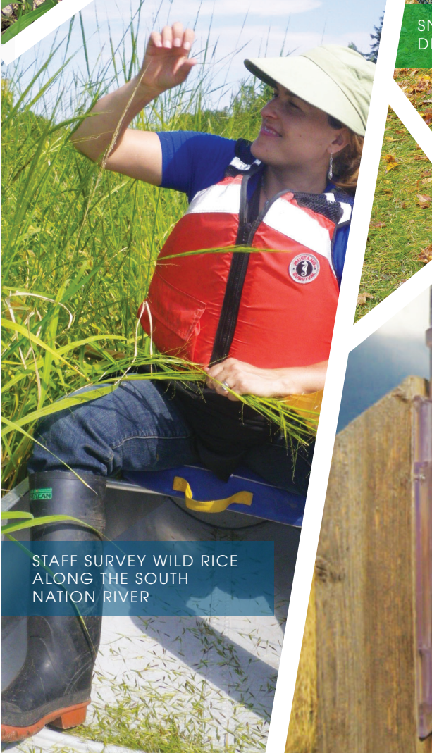
STAFF SURVEY WILD RICE ALONG THE SOUTH NATION RIVER