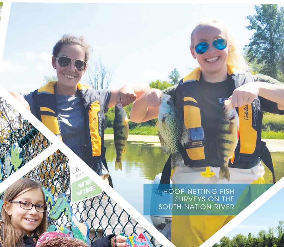
HOOP NETTING FISH SURVEYS ON THE SOUTH NATION RIVER