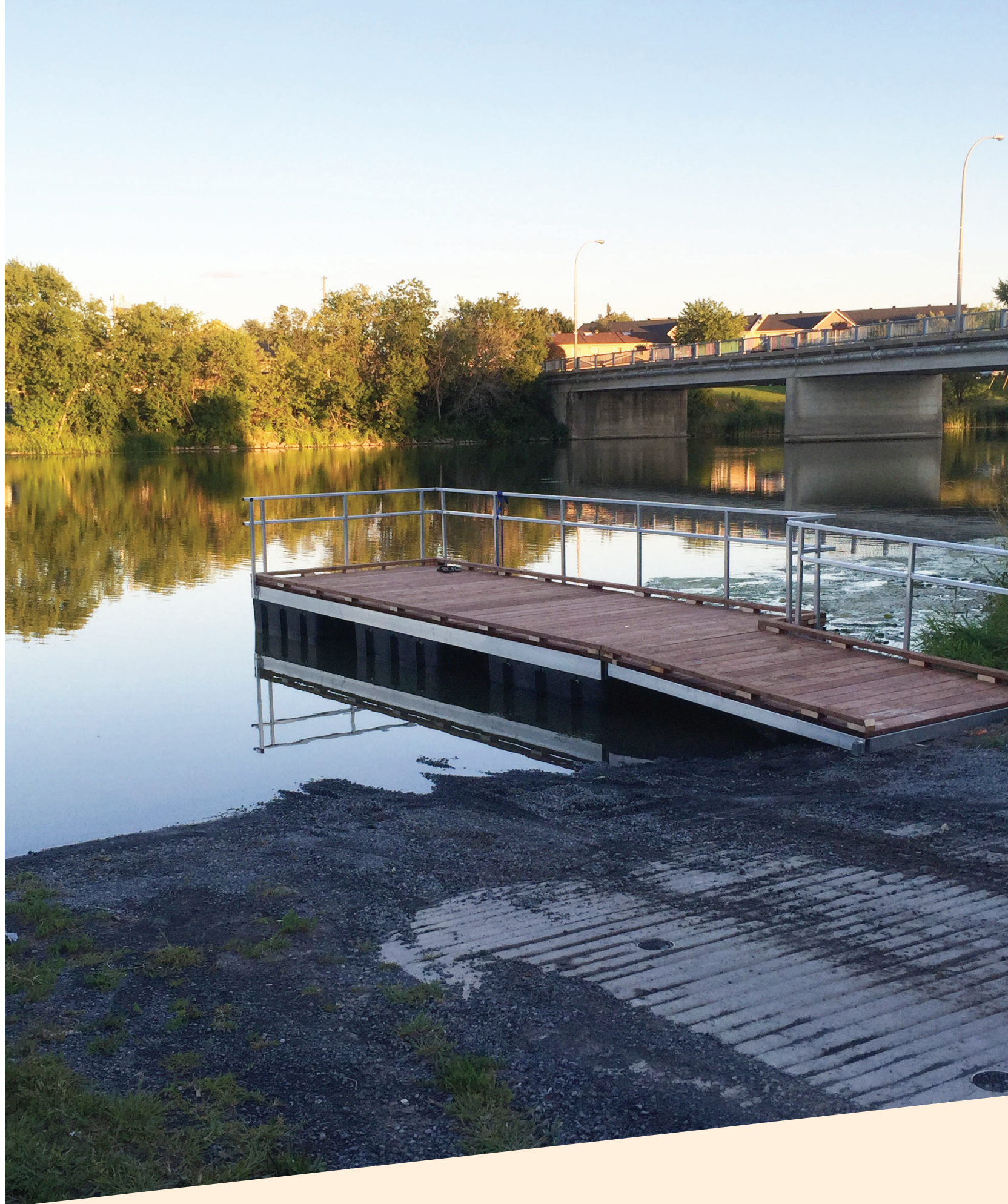
THE ACCESSIBLE DOCK AT HIGH FALLS CONSERVATION AREA