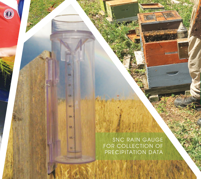
SNC RAIN GAUGE FOR COLLECTION OF PRECIPITATION DATA