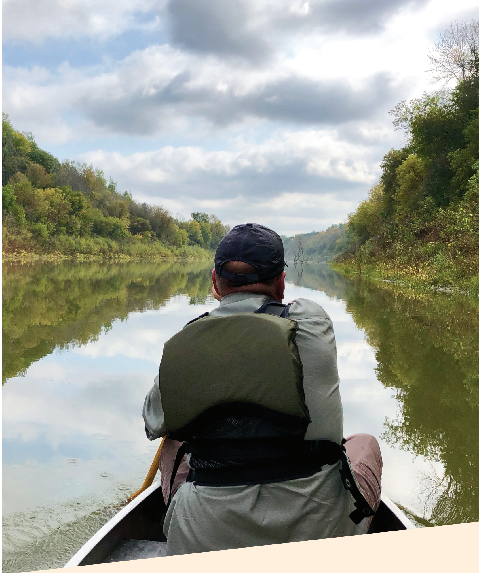
CANOEING THE SOUTH NATION RIVER