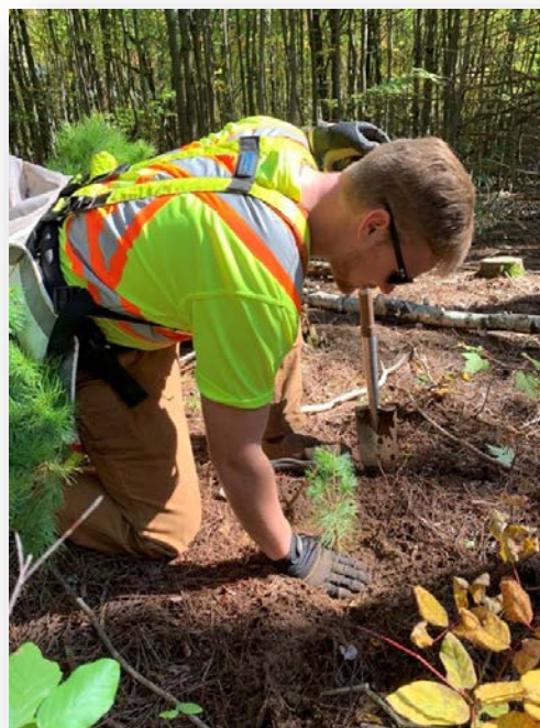
Figure 1 SNC Staff Planting Seedlings – SNC 7