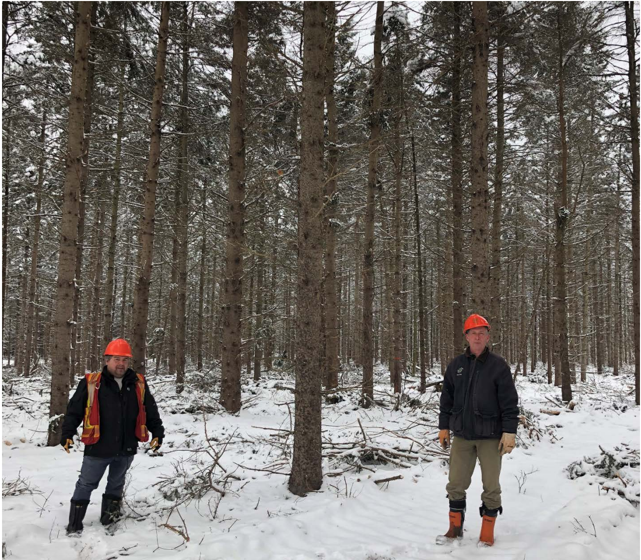
Figure 2: Post Harvest Inspection SNC 16/17 – White Spruce Plantation

Planned harvests were undertaken on two SNC Forest compartments under contract. Table 5 provides a summary of the completed harvest.