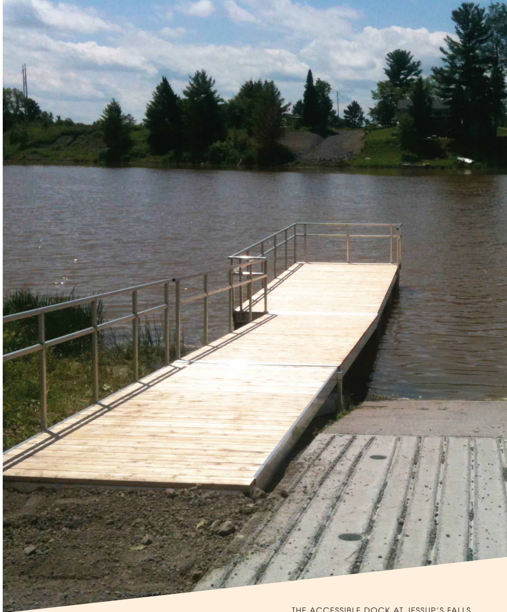
THE ACCESSIBLE DOCK AT JESSUP'S FALLS OVERLOOKS THE SOUTH NATION RIVER IN PLANTAGENET