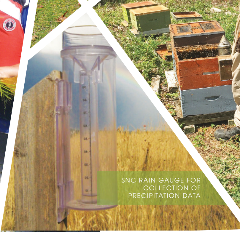
SNC RAIN GAUGE FOR COLLECTION OF PRECIPITATION DATA