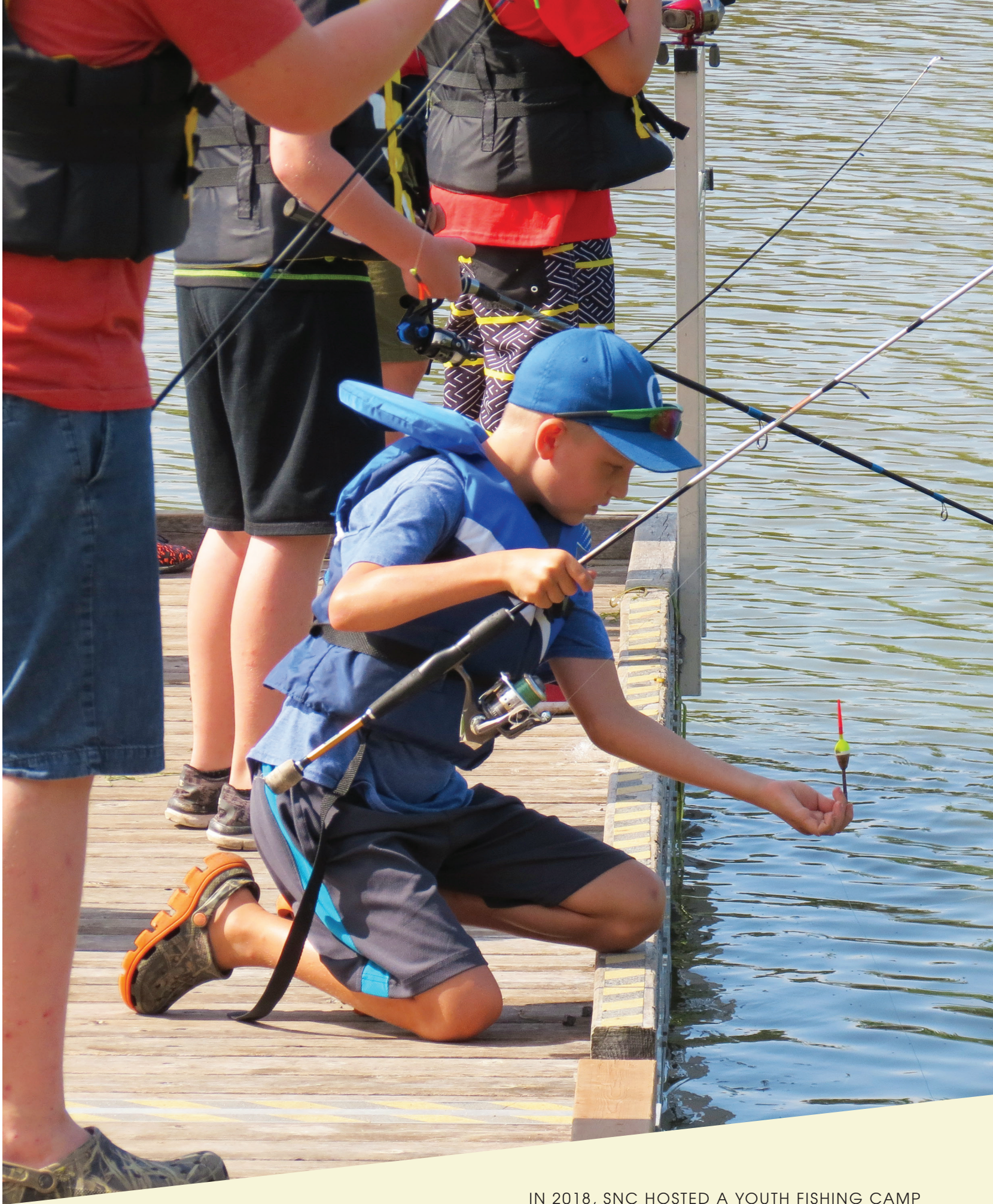
IN 2018, SNC HOSTED A YOUTH FISHING CAMP AT JESSUP'S FALLS CONSERVATION AREA