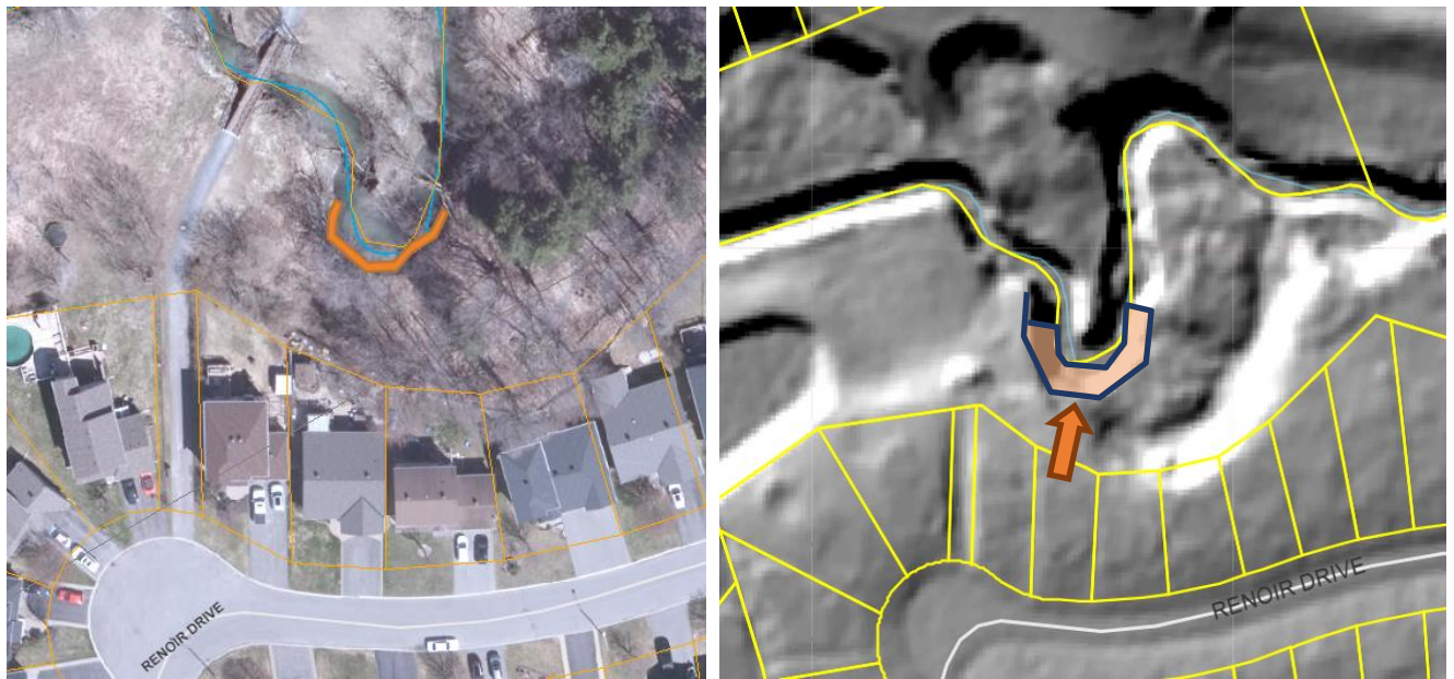
Figure 1. Restoration Project Site – East York Creek in Embrun.

This project site is located near the entrance to the property off Renoir Drive, approximately 30 metres downstream of the pedestrian bridge over the creek (Figure 1).