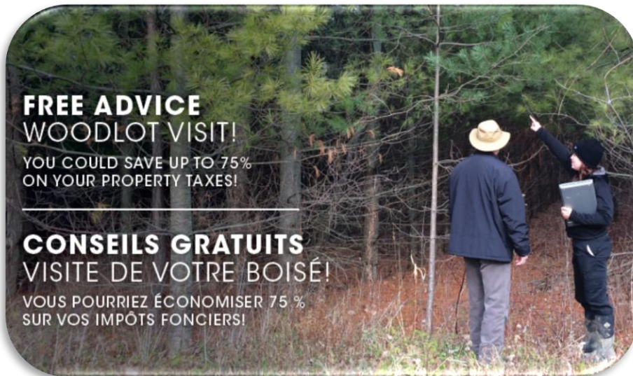
Woodlot Advisory Service postcard