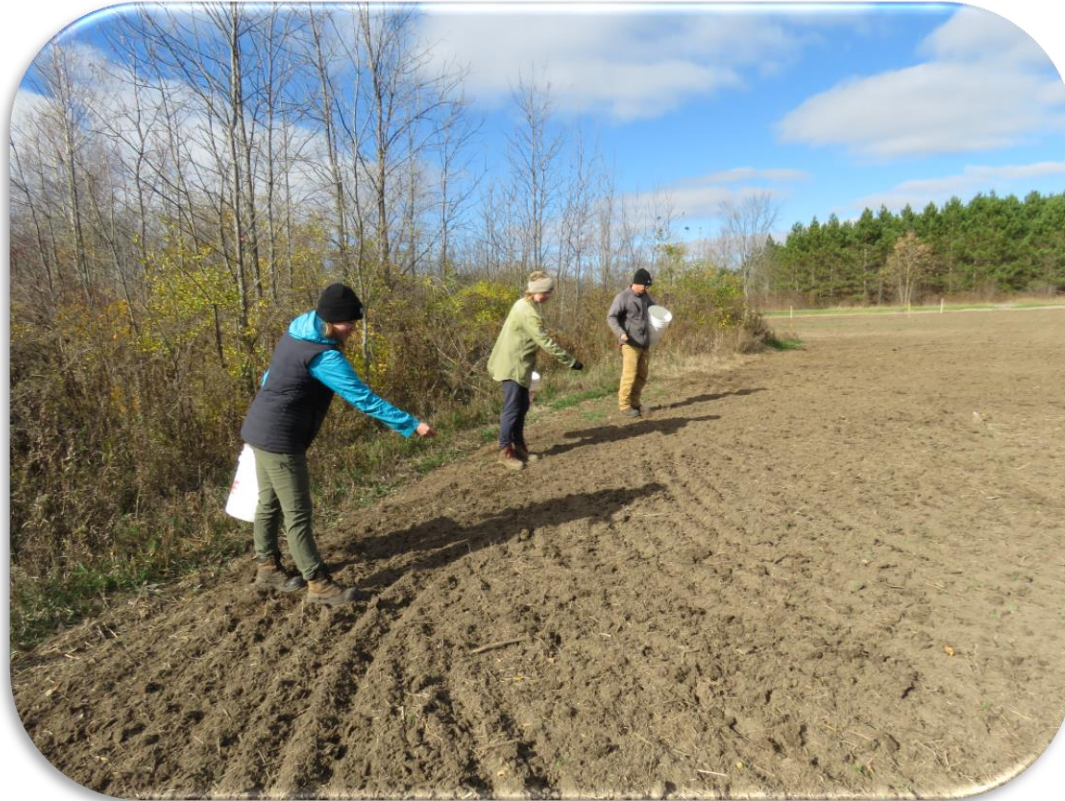
Sowing Pollinator Seed Mix Mill Run Conservation Area Augusta