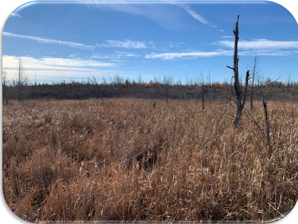
View of the Leitrim Wetland Along Proposed Extension Findlay Creek Ottawa