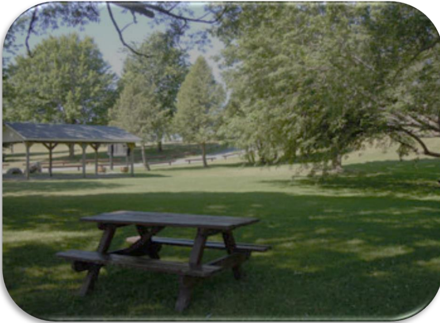
High Falls Conservation Area Casselman