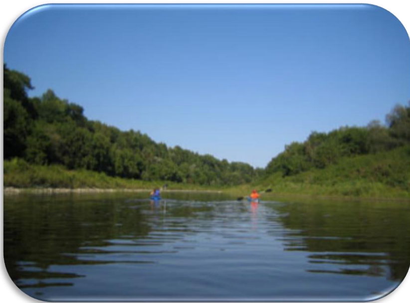
Swallows Path Casselman