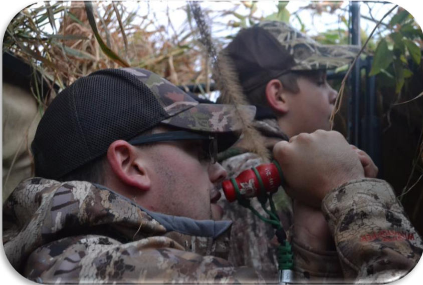
Delta Waterfowl Youth Hunt Program