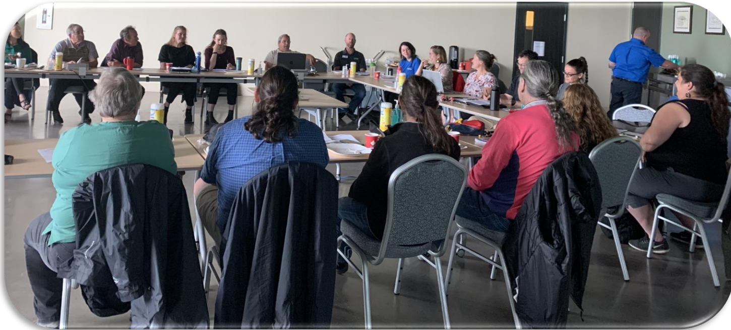
March 24, 2022 EOFNWG meeting hosted at the OPG Visitors Center in Cornwall