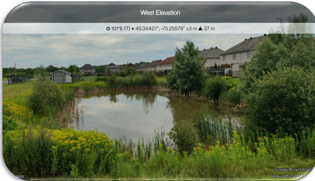
Brigil Subdivision, Limoges Nation