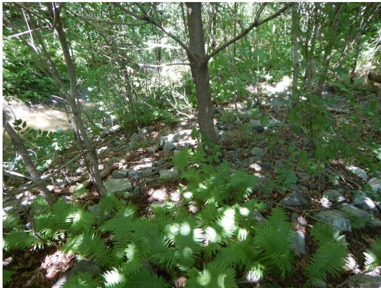
Figure 2. Existing Shoreline Maintenance (Rip-Rap).

In addition to the trail relocation, there is existing shoreline stabilization work (rip-rap) at the project location that is in need of maintenance (Figure 2).