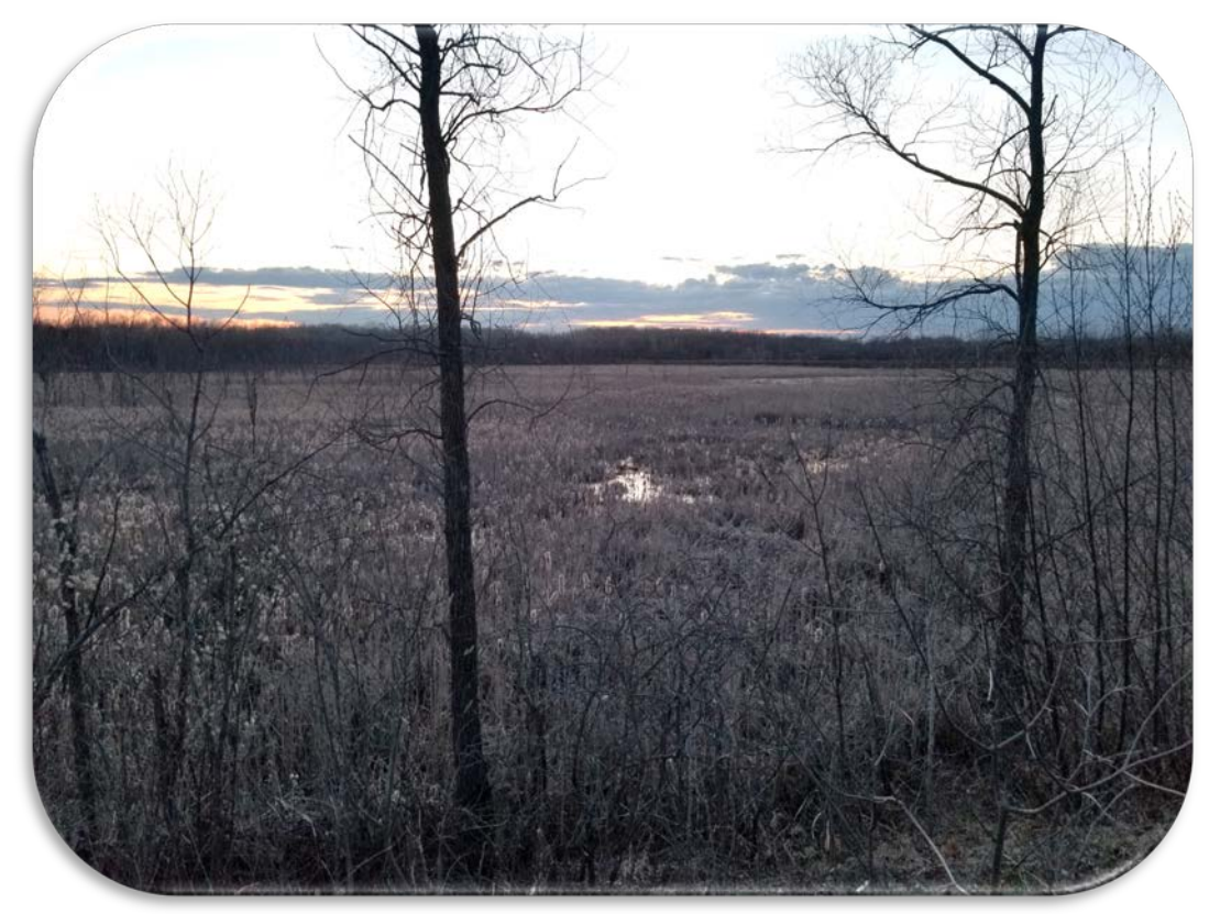
Lake View Marsh Provincially Significant Wetland Long Sault, South Stormont