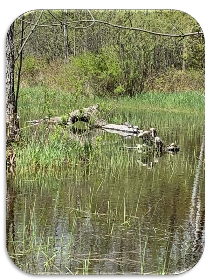
SNC 156, vernal pool #2, Midland Painted Turtles.