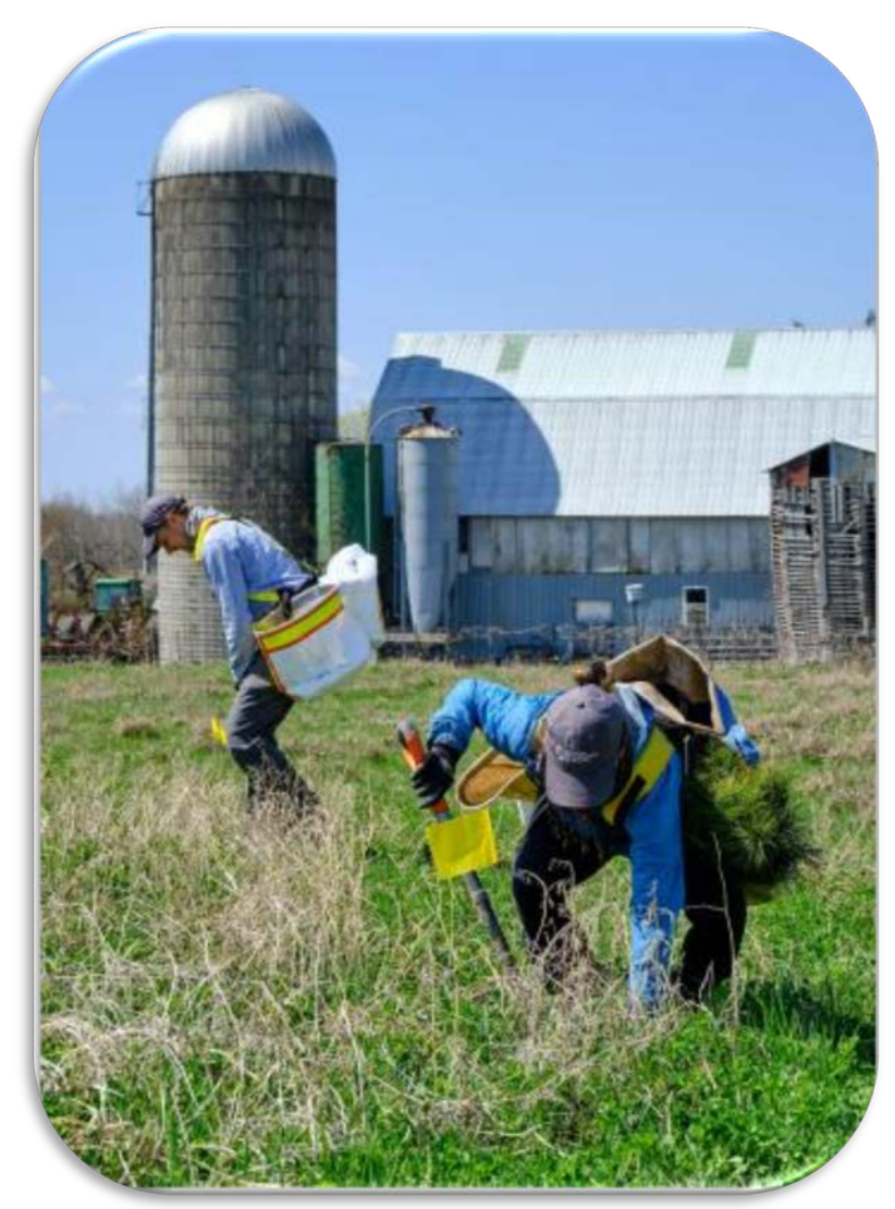
SNC Staff Tree Planting Navan