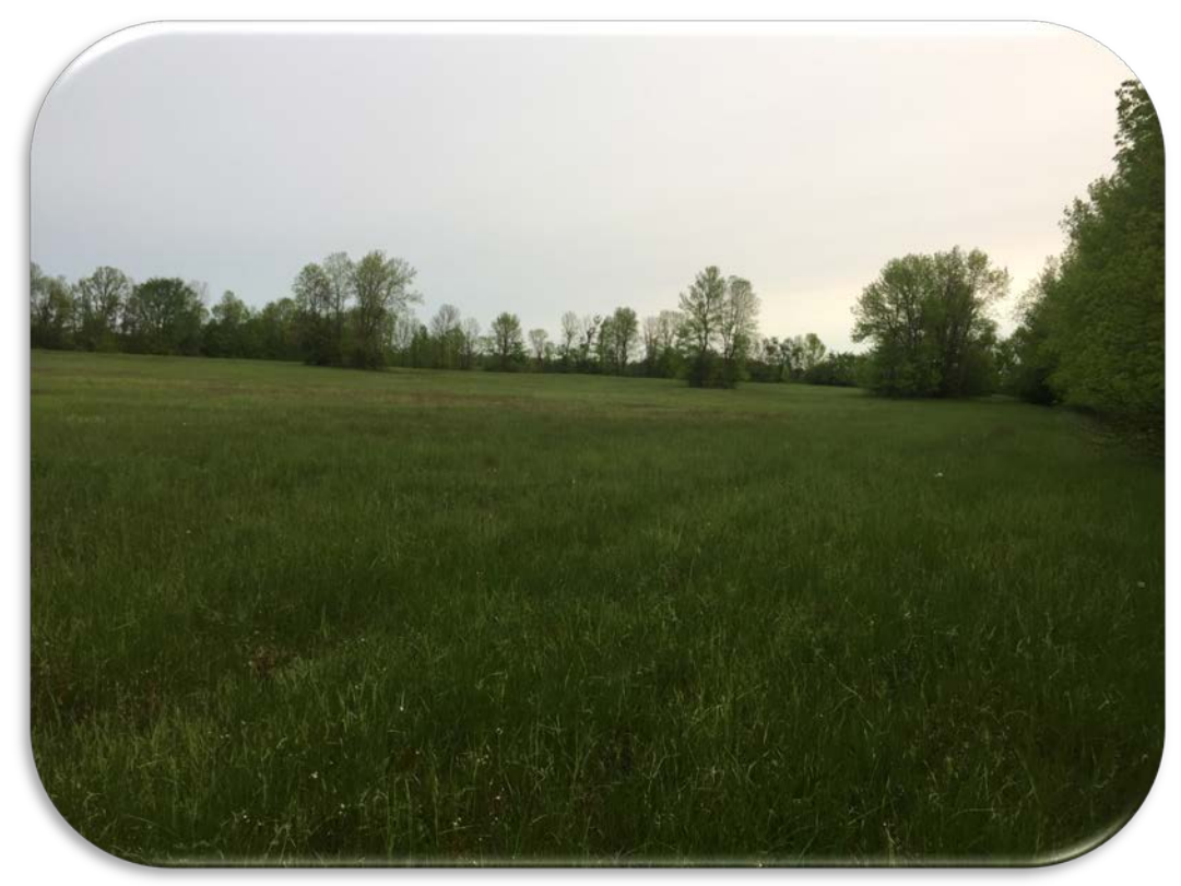
SNC 164 – The Healing Place Shanly, Edwardsburgh Cardinal