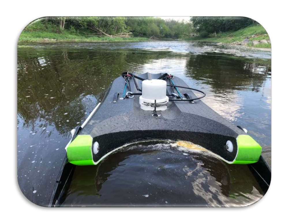
River Surveyor Unit on the South Nation River Chesterville, Ontario