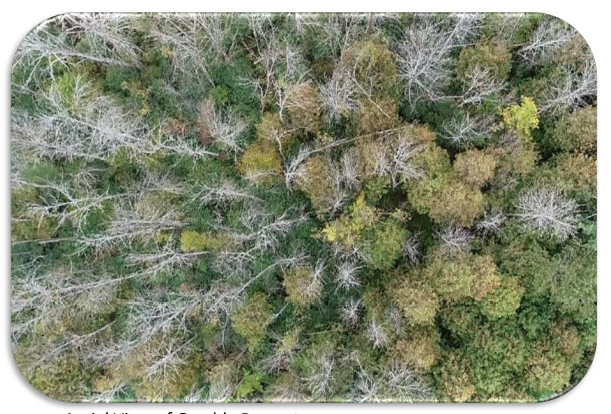
Aerial View of Gamble Property Greely, City of Ottawa