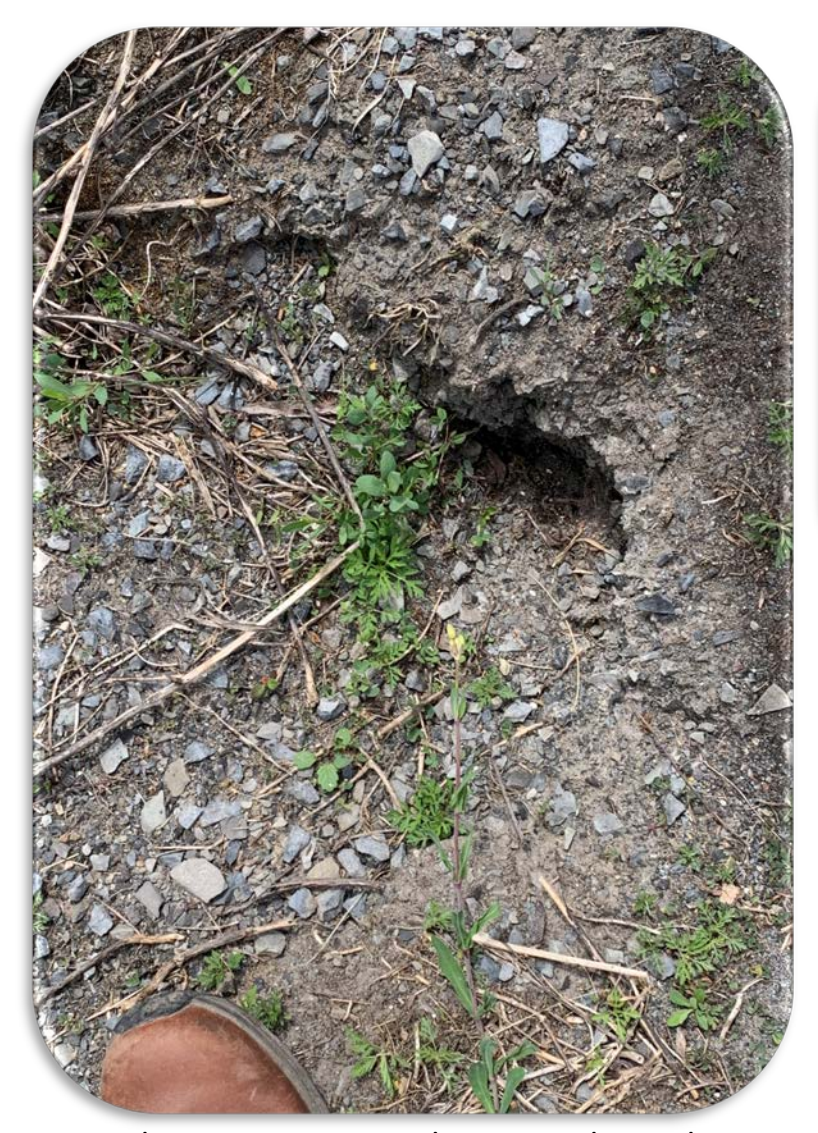
Turtle nest-County road #8 at Nash Creek