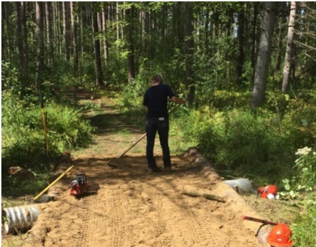
Trails at the Robert Graham Conservation Area in South Dundas were resurfaced and new culverts were installed to help alleviate seasonal flooding.

Increased visitation contributed to increase demand on maintenance activities and a need for park improvement projects including hazard and ash tree management, vandalism and litter control, restoration activities and parking lot and trail improvements.