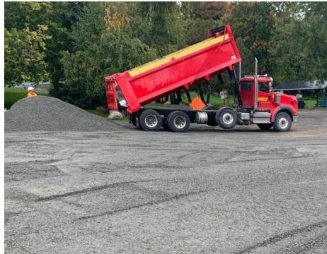
A newly expanded parking lot at the High Falls Conservation Area in Casselman will welcome and accommodate boat and trailer parking. Replacement trees were also planted, with more planned to help "spruce" up the park.