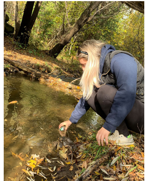
SNC Staff collecting water samples in Andy Shields Park in Greely

Approved $94,113 in cost-share grants for 37 projects within the City of Ottawa. The Ottawa Rural Clean Water Program is delivered by the Ottawa Conservation Partners (Rideau, Mississippi, and South Nation Conservation Authorities) on behalf of the City of Ottawa.