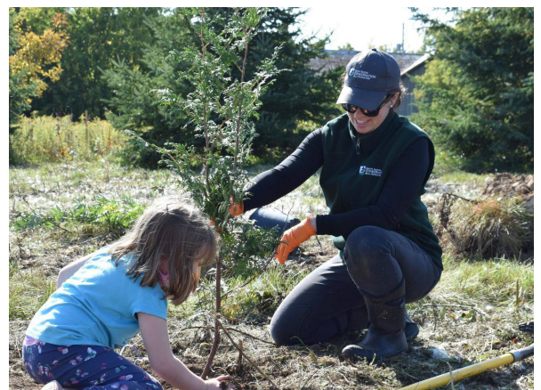
SNC Staff planting trees alongside youth participant in Shanly

The idea for a local Reconciliation Climate Change Planting started at the 2019 Climate Change Summit hosted by the Assembly of First Nations in Whitehorse, Yukon, where those in attendance made a commitment to offset their carbon emissions by planting trees.