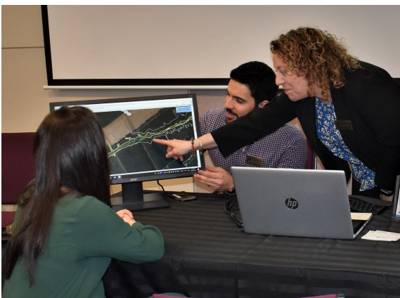
SNC staff at the East York Creek Open House in 2019