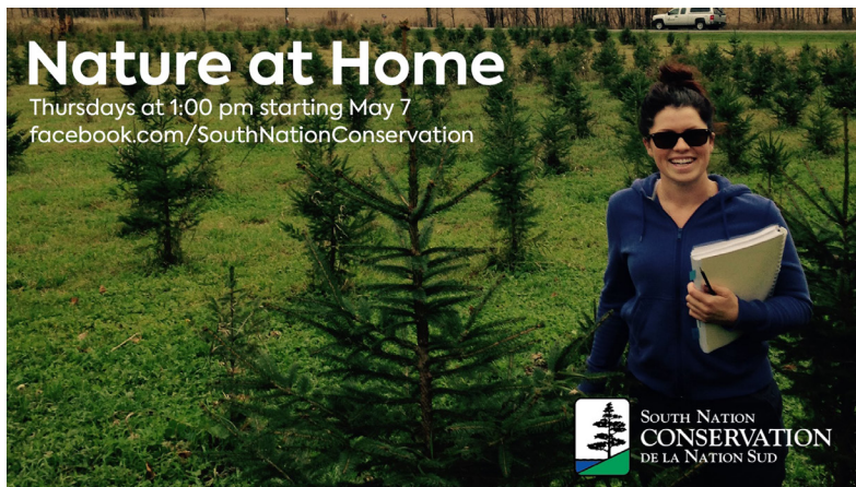
SNC Staff featured in Nature at Home videos series