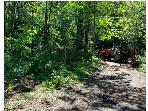
SNC will be restoring the J. Henry Tweed Conservation Area in Russell thanks to a new 3-year partnership with Ontario Power Generation. Restoration work will include Ash Tree removal, native tree planting, repairing erosion and streambank stabilization.