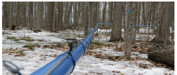
Pipeline through Oschmann Forest in North Dundas

30 acres of SNC land is leased to local farmers.