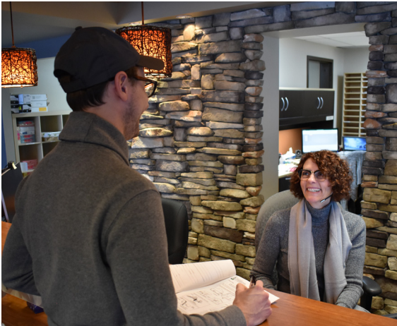
SNC Staff working on a permit application

SNC working continuously to improve efficiencies