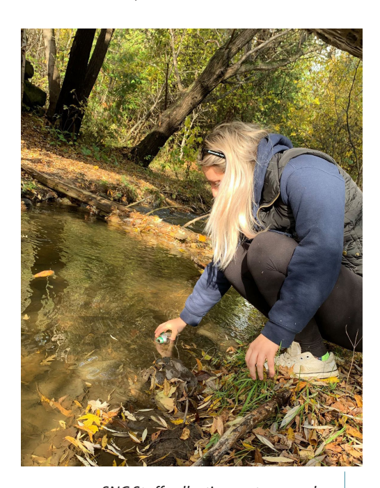
SNC Staff collecting water samples in Andy Shields Park in Greely

Approved $94,113 in cost-share grants for 37 projects within the City of Ottawa. The Ottawa Rural Clean Water Program is delivered by the Ottawa Conservation Partners (Rideau, Mississippi, and South Nation Conservation Authorities) on behalf of the City of Ottawa.