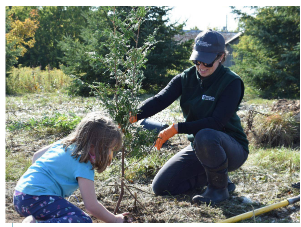
SNC Staff planting trees alongside participant in Shanly

The idea for a local Reconciliation Climate Change Planting started at the 2019 Climate Change Summit hosted by the Assembly of First Nations in Whitehorse, Yukon, where those in attendance made a commitment to offset their carbon emissions by planting trees.