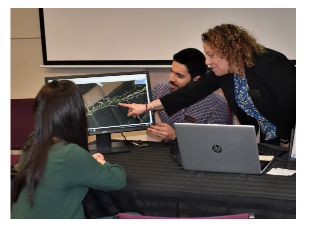
SNC staff at the East York Creek Open House in 2019