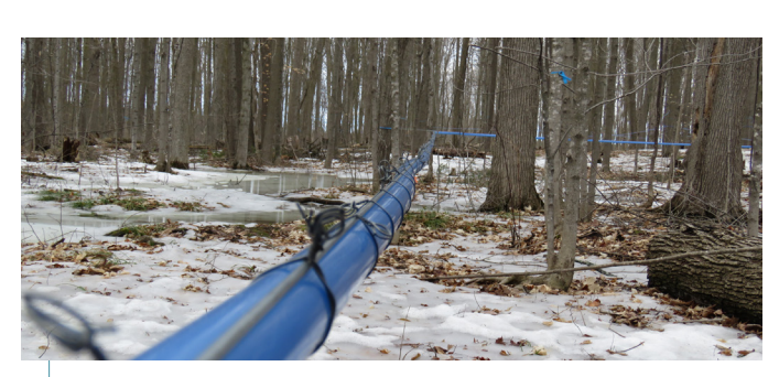
Pipeline through Oschmann Forest in North Dundas

30 acres of SNC land is leased to local farmers in 2020.