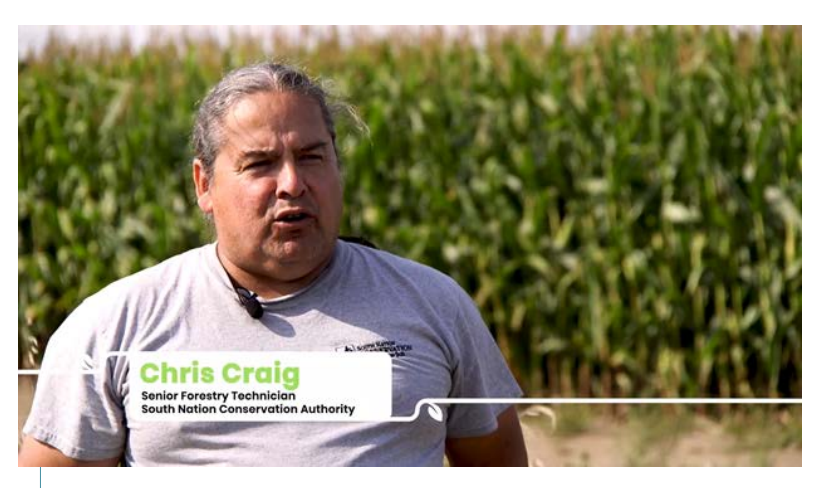
SNC Staff featured in Nature at Home videos series