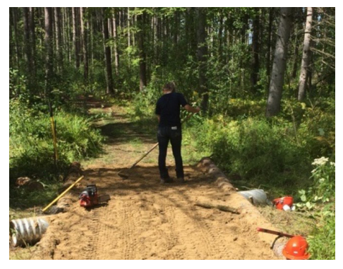
Trails at the Robert Graham Conservation Area in South Dundas were resurfaced and new culverts were installed to help alleviate seasonal flooding.

Increased visitation contributed to increase demand on maintenance activities and a need for park improvement projects including hazard and ash tree management, vandalism and litter control, restoration activities and parking lot and trail improvements.