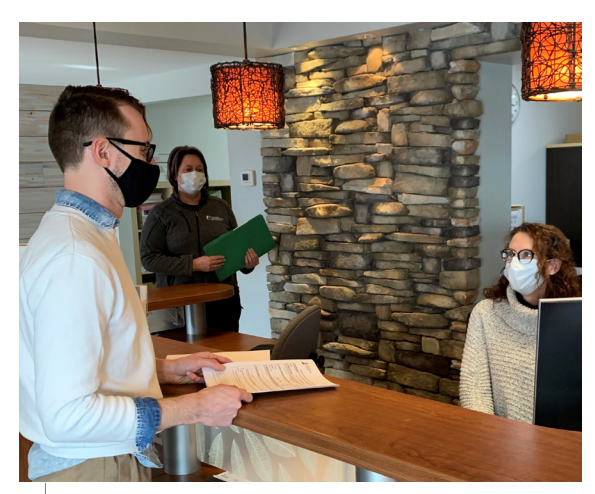
SNC Staff working on a permit application

SNC working continuously to improve efficiencies