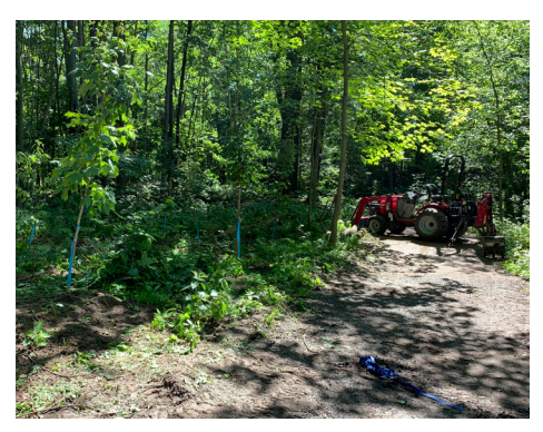
SNC will be restoring the J. Henry Tweed Conservation Area in Russell thanks to a new 3year partnership with Ontario Power Generation. Restoration work will include Ash Tree removal, native tree planting, repairing erosion and streambank stabilization.