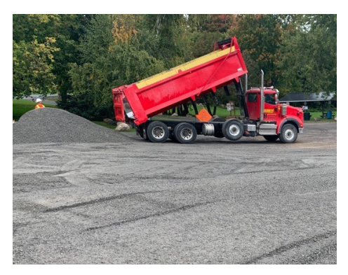
A newly expanded parking lot at the High Falls Conservation Area in Casselman will welcome and accommodate boat and trailer parking. Replacement trees were also planted, with more planned to help "spruce" up the park.