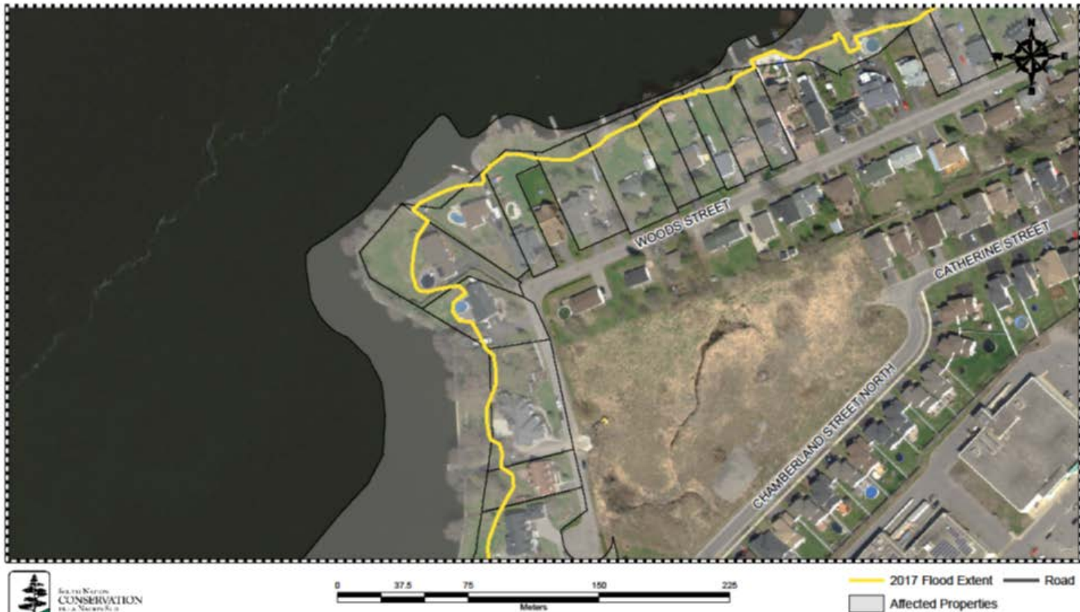
Ottawa River 2017 Flood Clarence Rockland Properties Affected