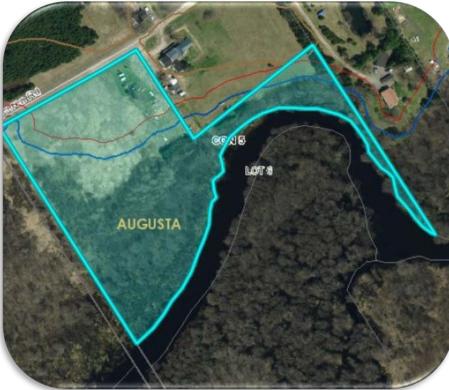
Aerial view of new SNC Property on McCrae Road in Augusta Township