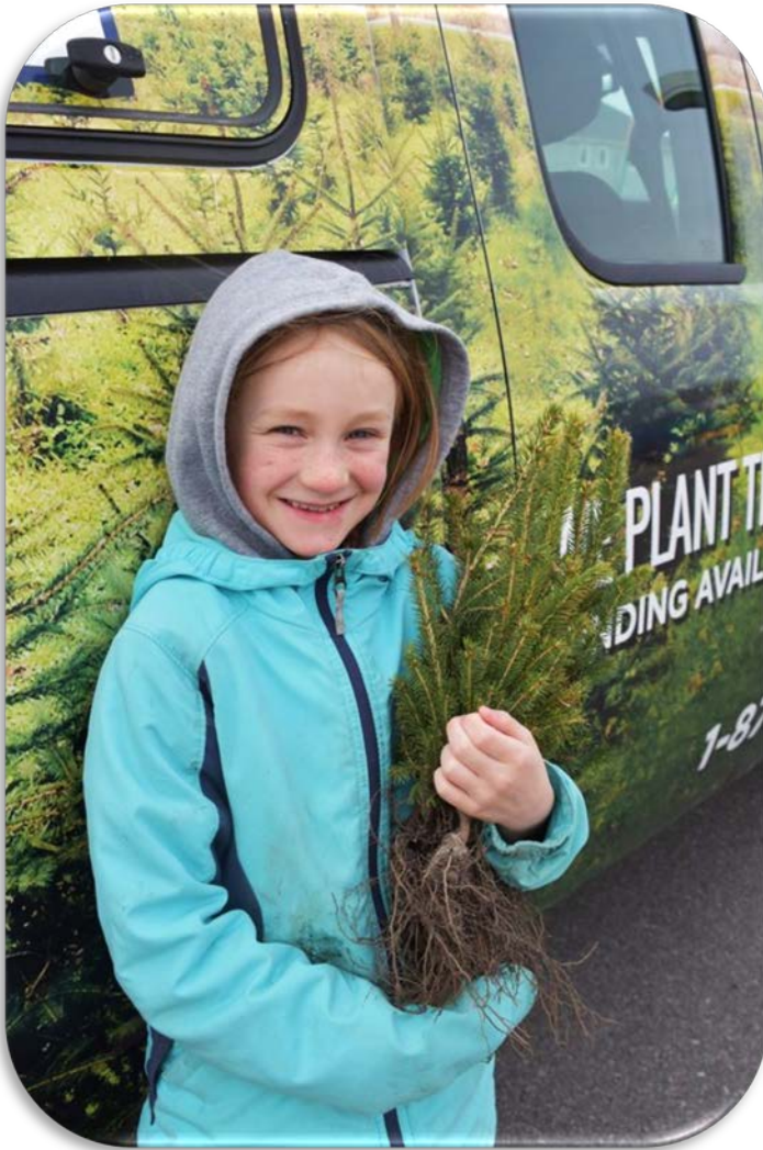
2019 Free Tree Recipient!