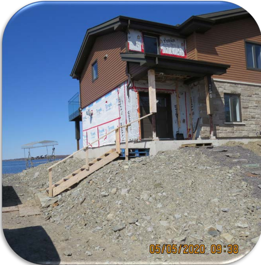
Natural Hazard Regulations along the Ottawa River