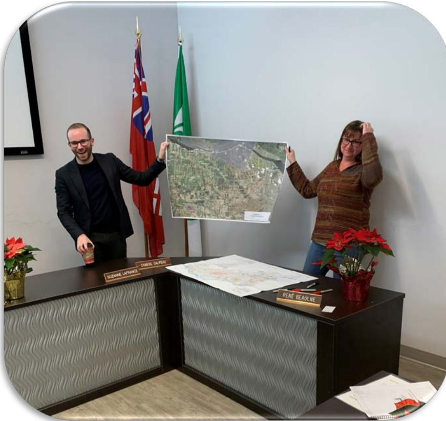
UCPR Municipal Engagement Session Plantagenet Town Hall