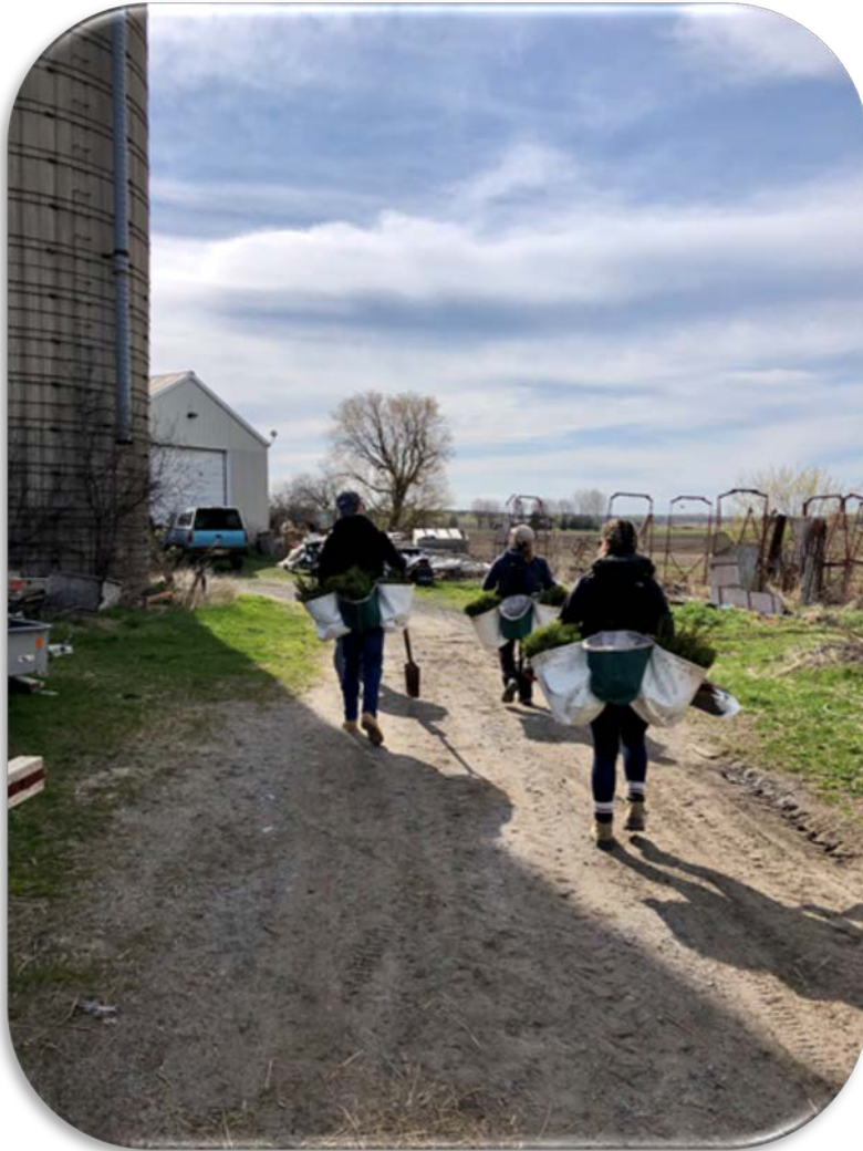
Private land planting 2020