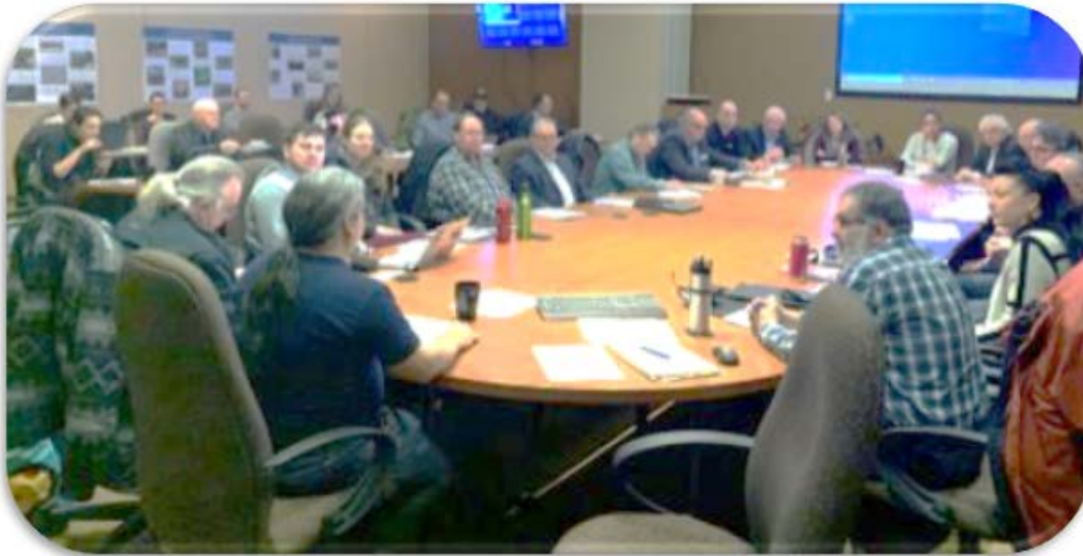
Eastern Ontario First Nation Working Group Meeting SNC Office, March 10 th , 2020