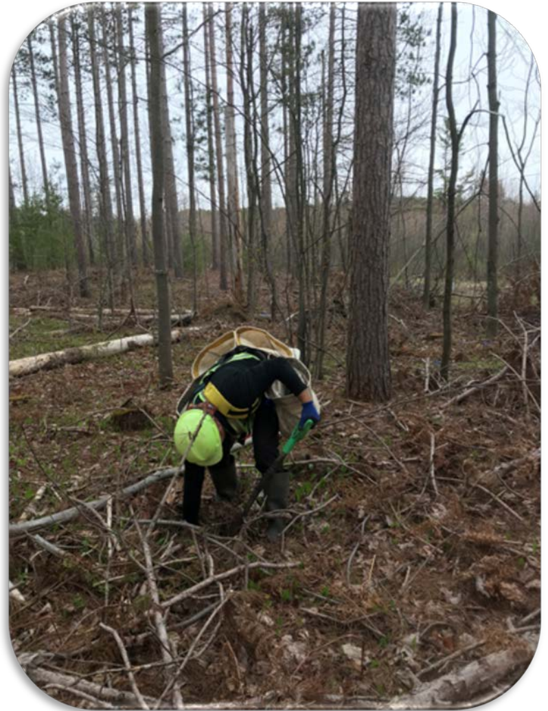
Larose Forest 2020