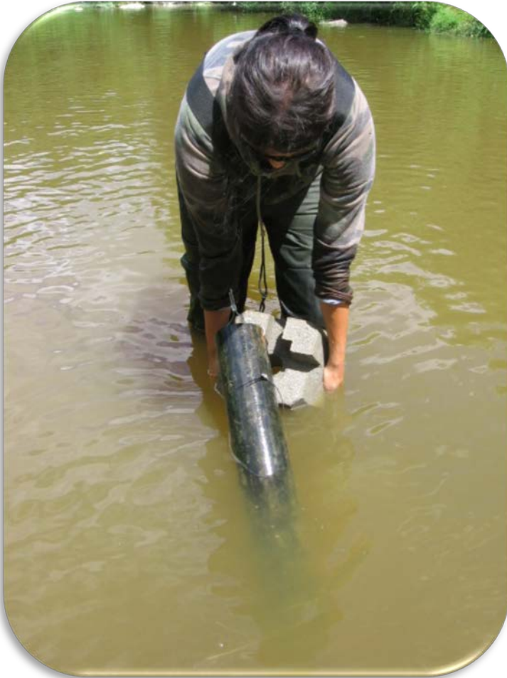
Water Quality Sensor Deployment