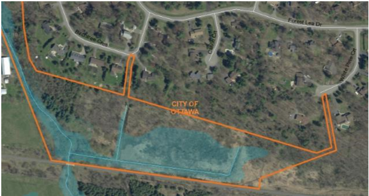
Figure 1 – The Navan Community Enhancement – Natural Habitat and Nature Trails project site at 999 Smith Road, Navan.