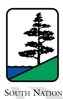
CONSERVATION DE LA NATION SUD