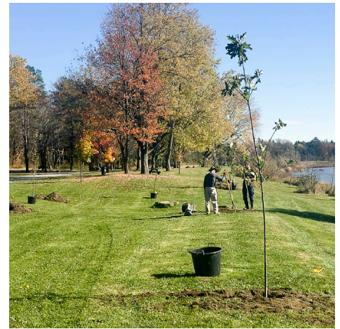
Improving shoreline tree cover at Jessup's Falls CA