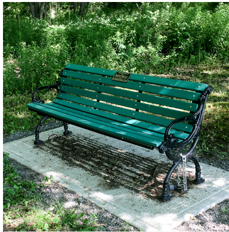
New bench at Two Creeks Forest CA