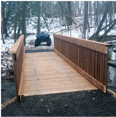
New bridge at J. Henry Tweed CA

2018 was a year of many CA upgrades! Improvement highlights included: a new bridge at J. Henry Tweed, new benches at Two Creeks Forest, tree planting, and trail enhancements at 35 km of trails.