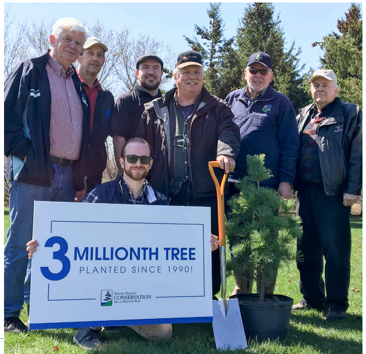
An eastern white pine marks SNC's official 3 millionth tree

Surface water, groundwater, and fisheries sampling was conducted to produce the Lower South Nation Subwatershed and State of the Nation report cards.