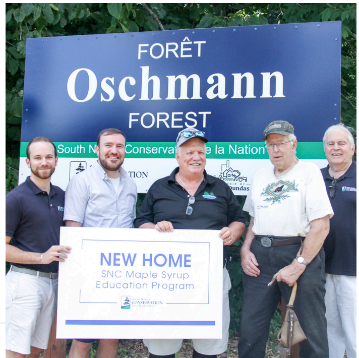
Opening of recent property donation, Oschmann Forest Conservation Area