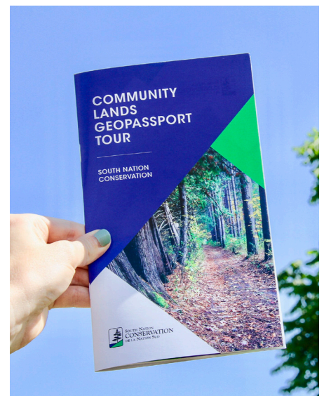
Take a tour of SNC's Community Lands with SNC's newest Geopassport

30 acres of SNC land is leased to local farmers.