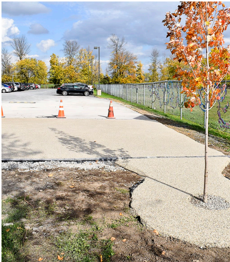
LID demonstration site at SNC's Administration Office

SNC and the City of Ottawa partnered in 2018 to launch the Ash Tree Replacement Pilot Program to assist Ottawa residents affected by the invasive emerald ash borer (EAB). Many property owners have been left with dead or dying ash trees, contributing to a decrease in local forest cover. The Program has made significant progress working with private property owners to replace hazard trees lost due to the EAB within the City. 96 Ottawa property owners received a 50% cost-share grant from SNC to replace 469 infected ash trees with a native tree.