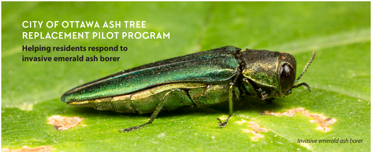
Invasive emerald ash borer

Helping residents respond to invasive emerald ash borer