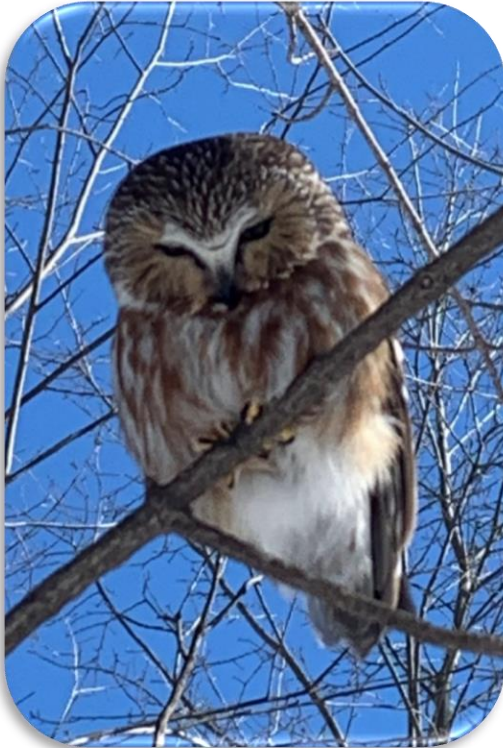
Reveler Conservation Area North Stormont