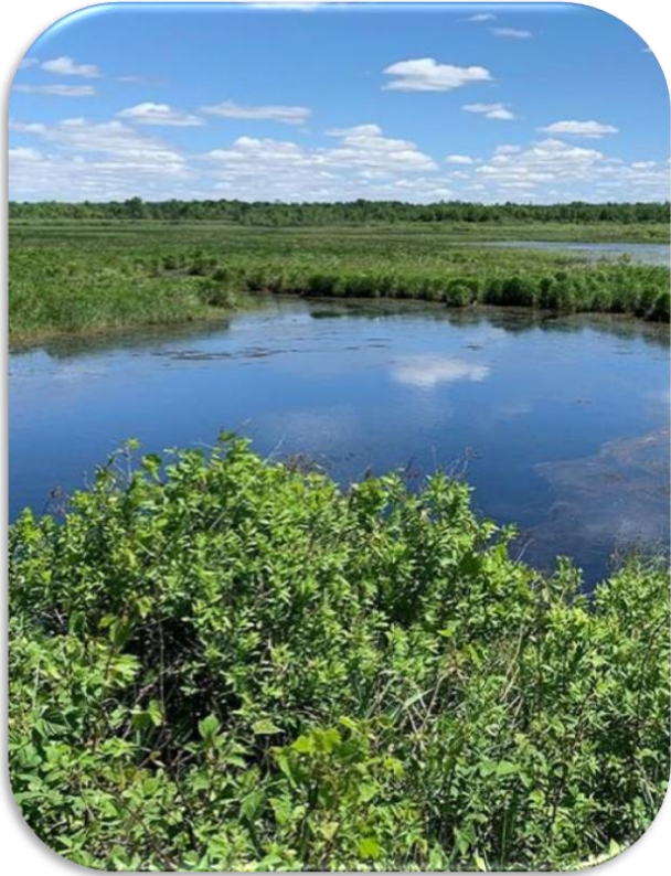
North Grenville Wetland SNC Land Aquisition

The Strategy will help SNC enhance delivery of Mandatory Programs and Services and assess issues and risks that impact effective delivery.