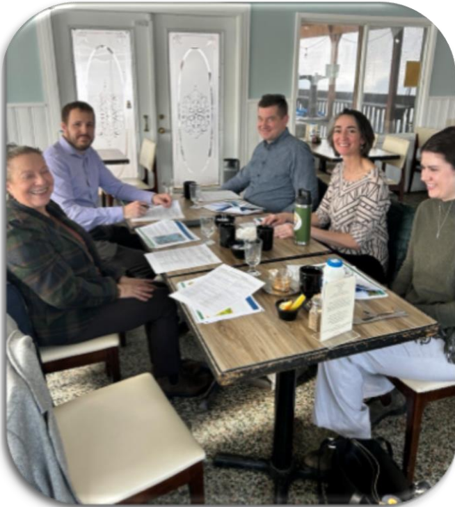
Meeting with SDG County Senior Staff