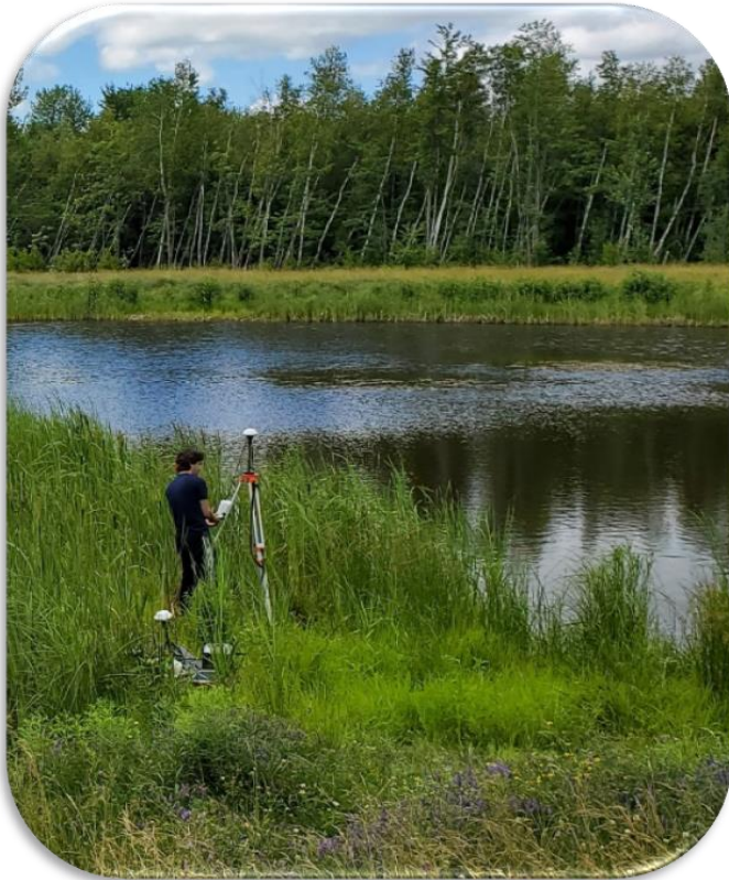
Staff surveying municipal infrastructure